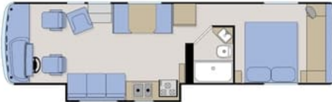
La Palma 34F