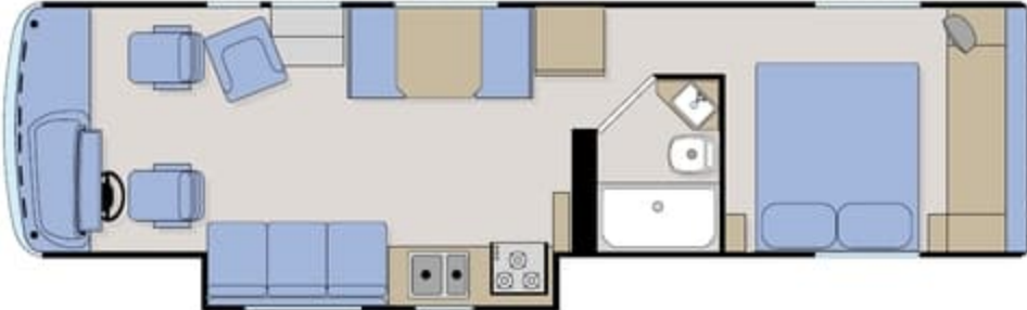
La Palma 34F