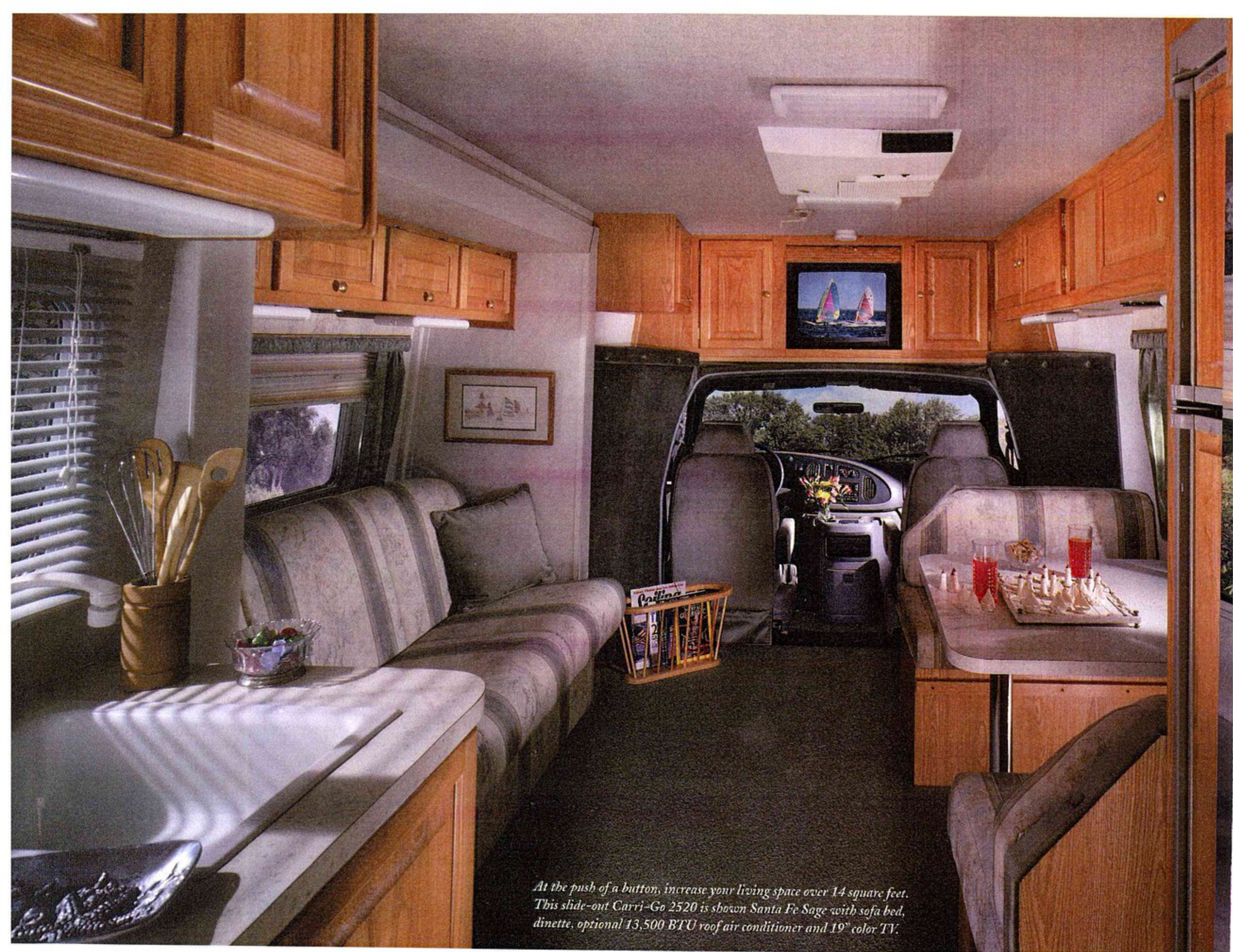
At the push of a button, increase your living space over 14 square feet. This slide-out Carri-Go 2520 is shown Santa Fe Sage with sofa bed, dinette, optional 13,500 BTU roof air conditioner and 19" color TV.