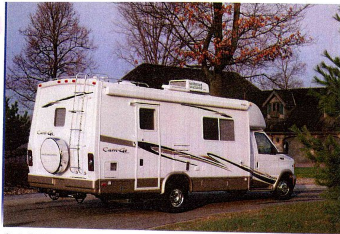
Carri-Go 2520 slide-out shown with optional lower accent paint, 15' awning and 13,500 BTU air conditioning.