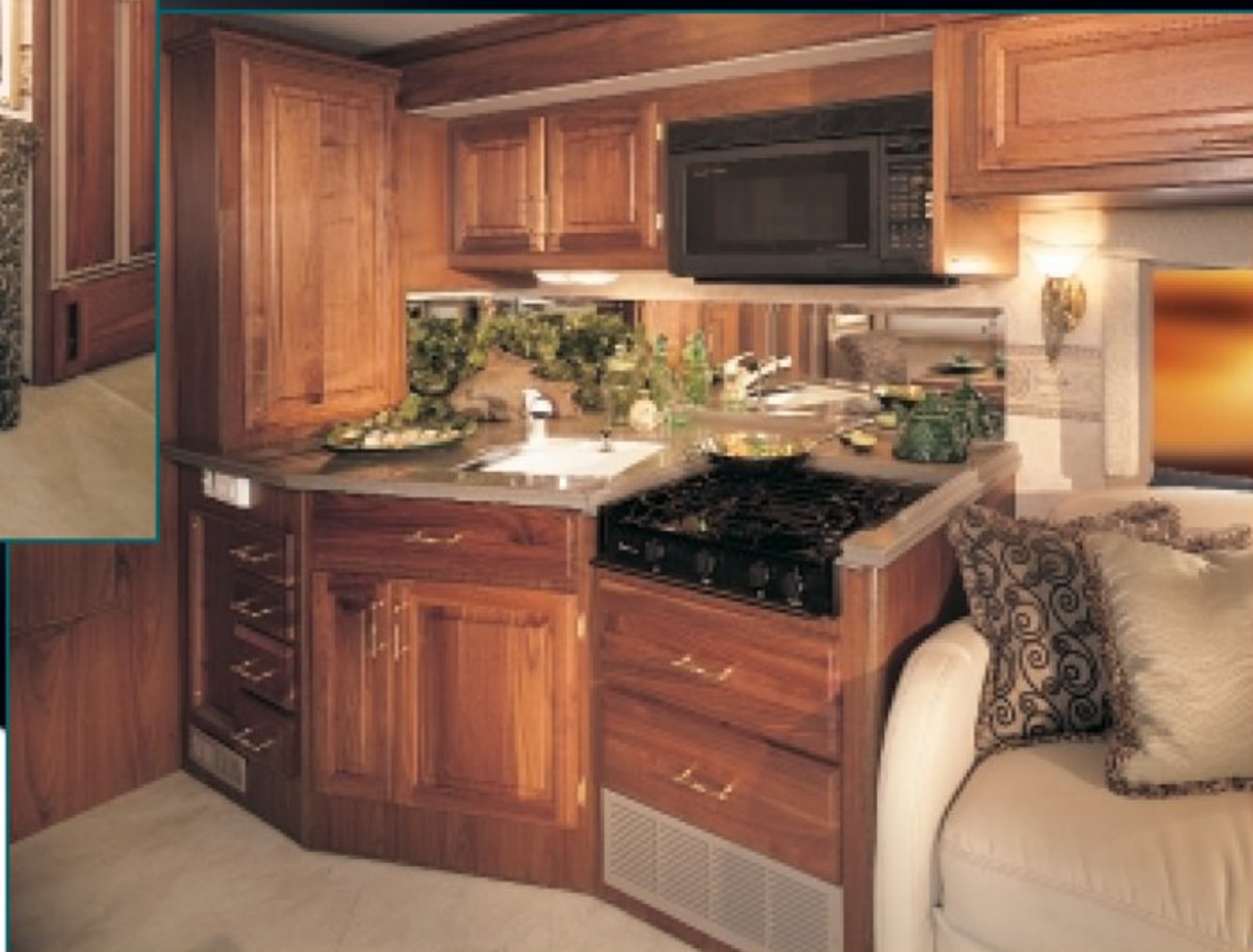
Cooking in Discovery is a five-star dream come true, with a galley that features a three-burner stove, GE® convection microwave, 12-cu. ft. side-by-side Dometic® refrigerator, porcelain sink and solid surface countertops.

But perhaps it is in the details where Discovery really makes an impact. It's loaded with premium appliances from companies you trust such as Panasonic®, Dometic® and Magic Chef® to name a few. The galley features laminated tile flooring and solid surface countertops. A new retractable spray head galley faucet, three-burner high-output cooktop, convection microwave plus an optional central vacuum system all complement your lifestyle and activities.