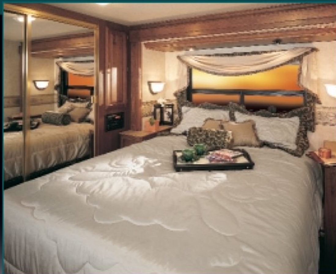
An interior designer's dream—Discovery's bedroom combines the warmth of optional walnut cabinets with custom fabrics and window treatments for that extra touch of elegance.