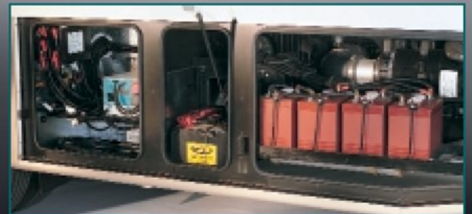
There's easy access to the 2,000-watt power inverter and all batteries in a single compartment.