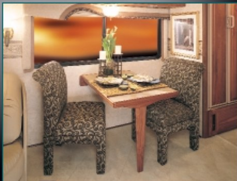
The dining area features a beautifully designed table with free-standing custom-upholstered chairs.