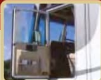
For added convenience, you'll appreciate the driver side entry/exit door.

With the 2002 Triple E Signature Motorhome, you're not choosing a vehicle, you're choosing a way of life. Detail, such as easy maintenance oak hardwood flooring in the galley and plenty of storage space, will ensure your way of life is simplified.