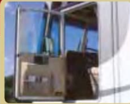
For added convenience, you'll appreciate the driver side entry/exit door.

With the 2002 Triple E Signature Motorhome, you're not choosing a vehicle, you're choosing a way of life. Detail, such as easy maintenance oak hardwood flooring in the galley and plenty of storage space, will ensure your way of life is simplified.