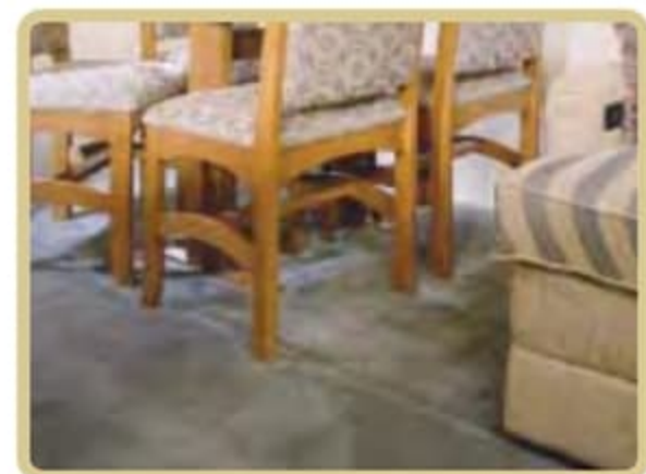
New for 2002, the Signature A3608F features a practically seamless flush floor slide out.