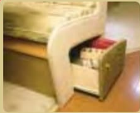
The Signature's thoughtful design provides extra space and ample storage.