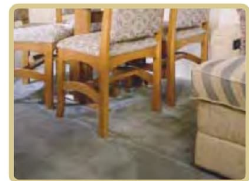
New for 2002, the Signature A3608F features a practically seamless flush floor slide out.