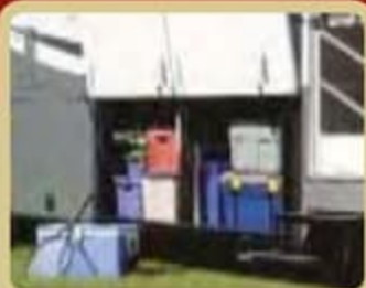
Handy and lockable exterior storage allows you to bring all the essentials.