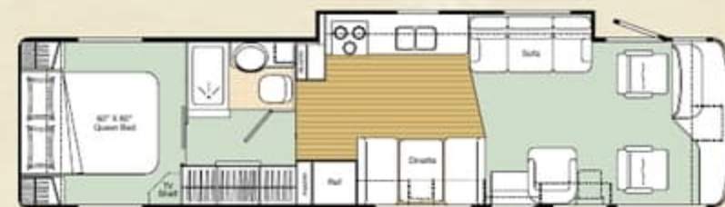
A3607G Wardrobe Slide-out Available