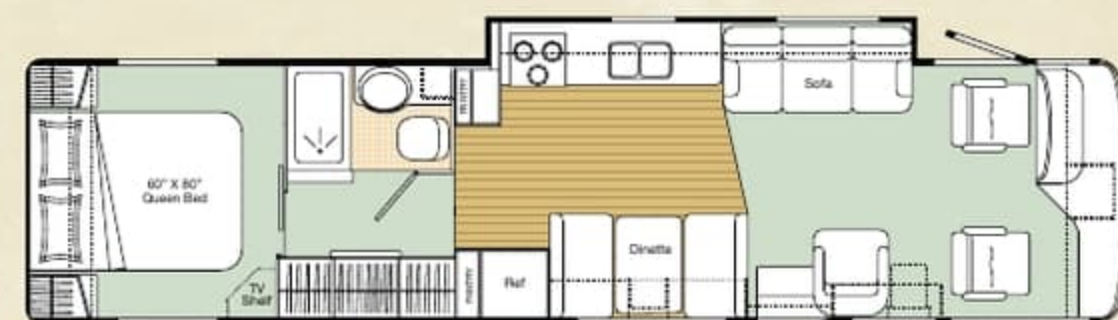
A3607G Wardrobe Slide-out Available