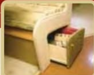
The Signature's thoughtful design provides extra space and ample storage.