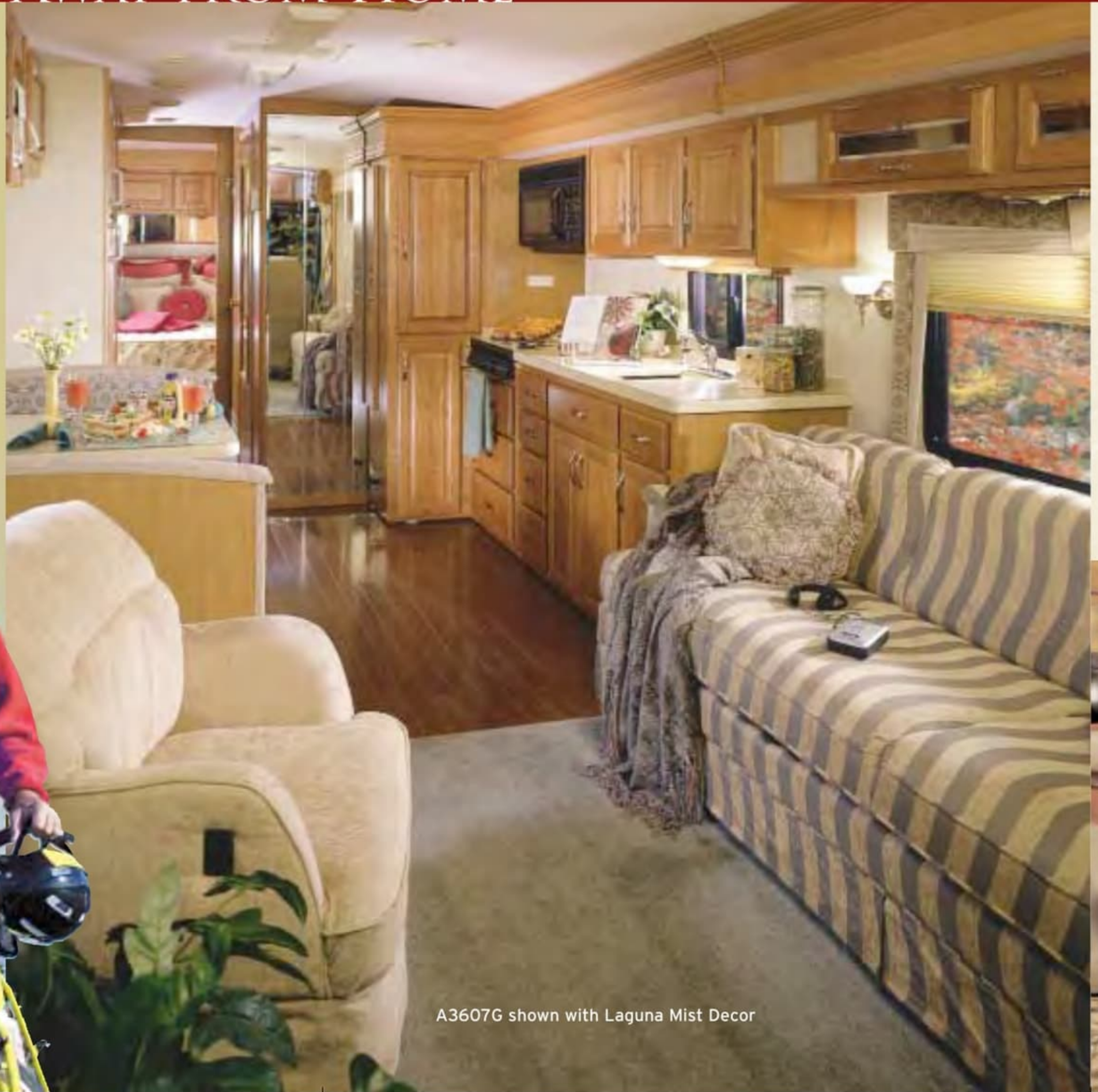
A3607G shown with Laguna Mist Decor