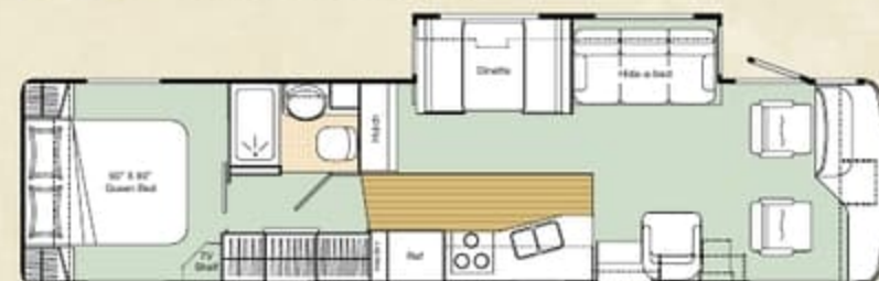
A3608F Wardrobe Slide-out Available

Product improvement is a continuing process at Triple E Recreational Vehicles. Thus we reserve the right to change specifications on any or all products without prior notice; errors and omissions excepted. Triple E Recreational Vehicles is under no obligation to undertake modification to units manufactured prior to changes on specifications.