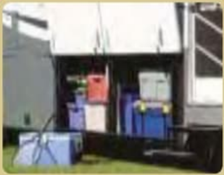
Handy and lockable exterior storage allows you to bring all the essentials.