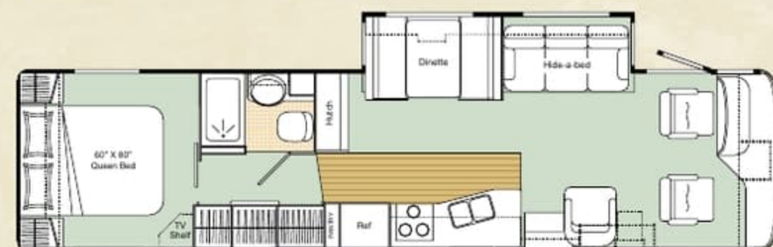
A3608F Wardrobe Slide-out Available

Product improvement is a continuing process at Triple E Recreational Vehicles. Thus we reserve the right to change specifications on any or all products without prior notice; errors and omissions excepted. Triple E Recreational Vehicles is under no obligation to undertake modification to units manufactured prior to changes on specifications.