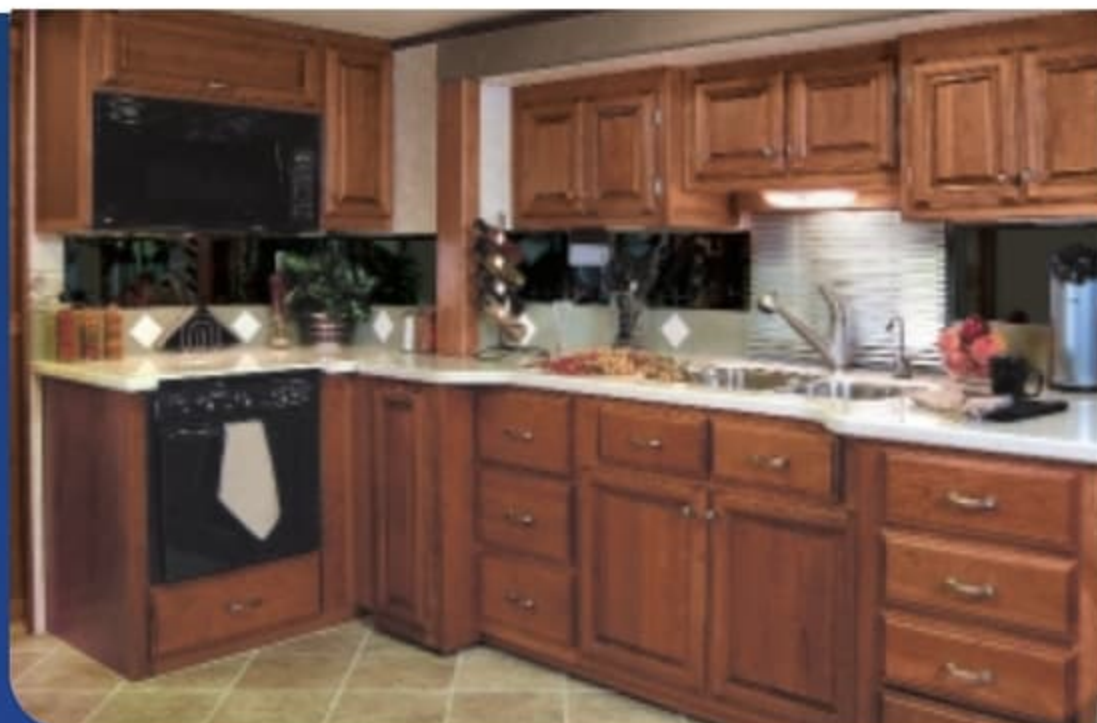
40 C SHOWN WITH TOPAZ INTERIOR & NATURAL WALNUT WOOD

Revolution once again leads the way with striking interior changes. Choose from nine wood and fabric combinations and ultra leather furniture with color coordinated inserts. In the galley area you'll discover newly designed cabinet hardware, solid surface backsplash and sealed oven burners.