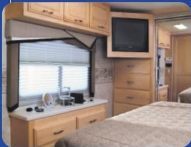
38 B BEDROOM SHOWN WITH ONYX INTERIOR AND CLEAR WHITE MAPLE WOOD

The Revolution bath has been elegantly redecorated with new chrome faucets, handles, towel holders and light fixtures. Standard this year are an obscure glass shower door and shower seat. Rear ventilation is provided by an electrically-powered ceiling vent with rain sensor technology.