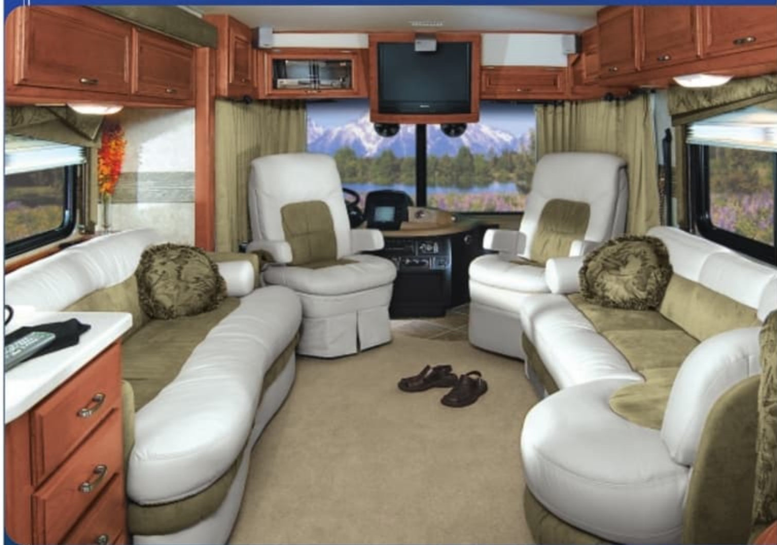
40 C SHOWN WITH TOPAZ INTERIOR & REGENCY CHERRY WOOD

From aft to bow, stem to stern and wall to wall, Revolution now comes with quality Fabrica carpeting, diagonally tiled floors in the galley and entryway, as well as padded vinyl ceilings. A new optional central vacuum system is now available to keep your cabin shipshape.