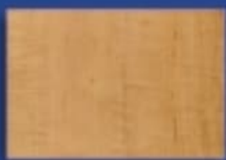
Clear White Maple