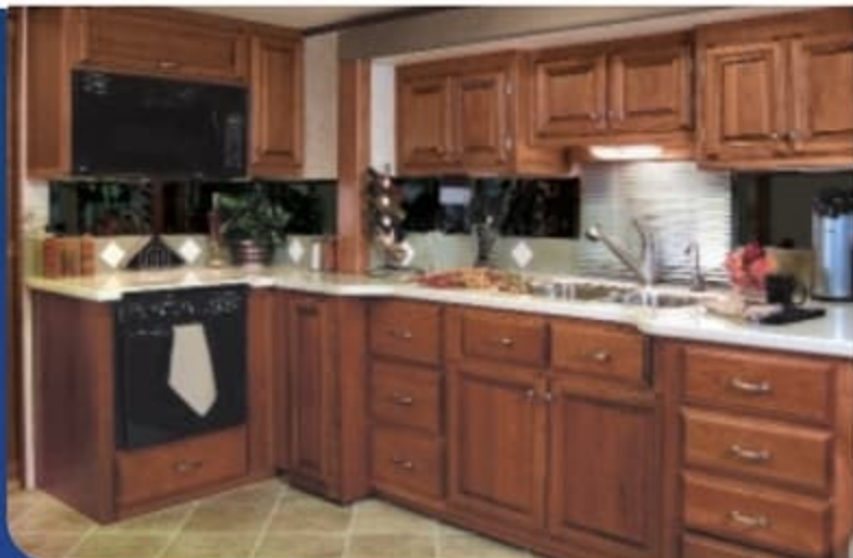
40 C SHOWN WITH TOPAZ INTERIOR & NATURAL WALNUT WOOD

Revolution once again leads the way with striking interior changes. Choose from nine wood and fabric combinations and ultra leather furniture with color coordinated inserts. In the galley area you'll discover newly designed cabinet hardware, solid surface backsplash and sealed oven burners.