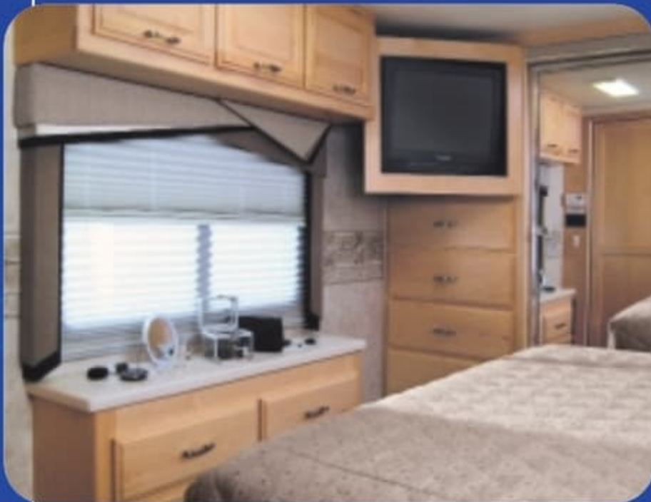
38 B BEDROOM SHOWN WITH ONYX INTERIOR AND CLEAR WHITE MAPLE WOOD

Bedroom storage space is the new order for the day thanks to a full wardrobe and optional base cabinet and overhead storage compartments. A large 20" TV swivels out and conveniently stows away when not in use.