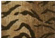
Sofa Pillows, Reversible Afghan Throw & Dinette Chairs