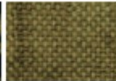
Window Seat Cushions