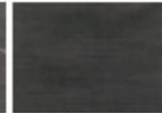
Throw Pillows & Pillow Sham Accent