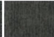
Window Seat Cushions