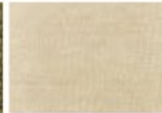
Ultraleather Sofa Bed, Sofa Sleeper, Love Seat & Free-standing Recliner