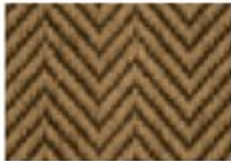
Window Seat Cushions