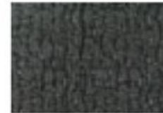
Sofa Pillows, Reversible Afghan Throw & Dinette Chairs