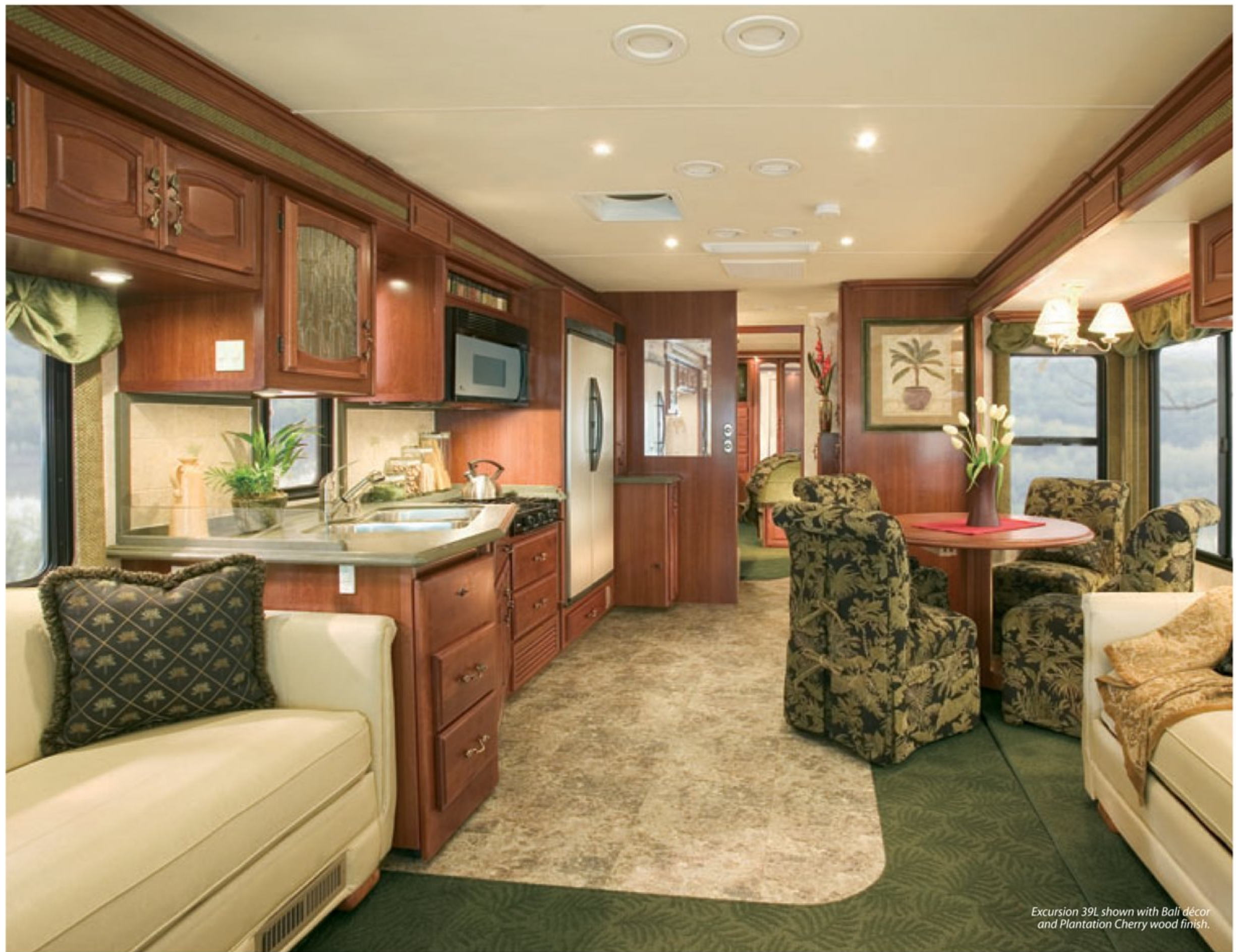
Excursion 39L shown with Bali décor and Plantation Cherry wood finish.