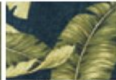
Throw Pillows & Pillow Sham Accent