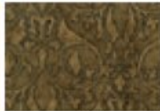
Bedspread, Pillow Shams & Reversible Afghan Throw