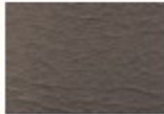
Ultraleather Sofa Bed, Sofa Sleeper, Love Seat & Free-standing Recliner