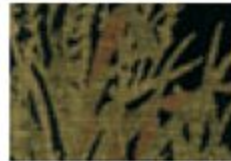
Sofa Pillows, Reversible Afghan Throw & Dinette Chairs