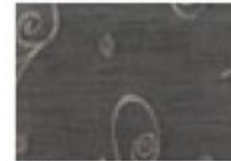
Bedspread, Pillow Shams & Reversible Afghan Throw