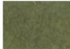
Bedspread, Pillow Shams & Reversible Afghan Throw