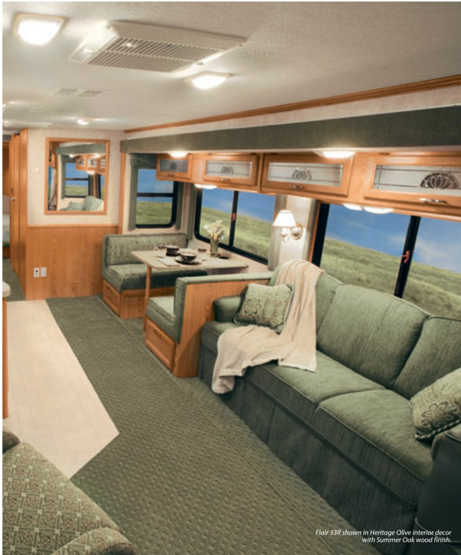
Flair 33R shown in Heritage Olive interior decor with Summer Oak wood finish.

Enjoy Flair's spacious layout, providing a comfortable atmosphere on the road. Features like flush flooring provide a near seamless living area when the slide-outs are extended, while comfortable Flexsteel® furniture, with a lifetime warranty on the frame, is the perfect place to relax.