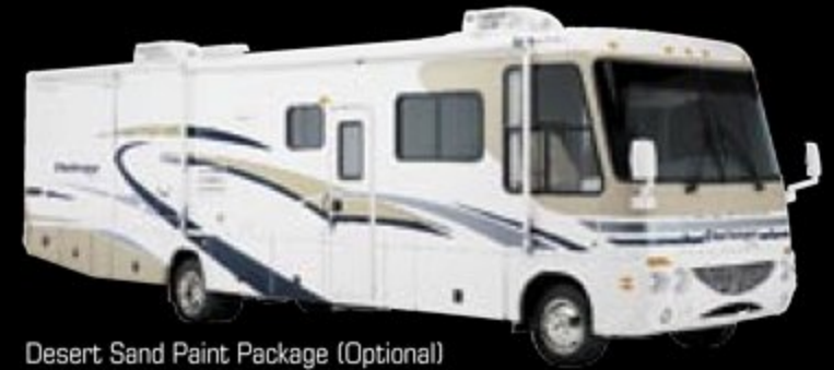
Desert Sand Paint Package (Optional)