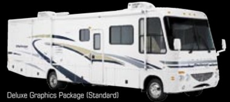
Deluxe Graphics Package (Standard)

Challenger's exterior has a wonderfully fluid, sweeping look, with bold, clean graphics and optional paint styles. Few other motorhomes in Challenger's class offer this many choices.