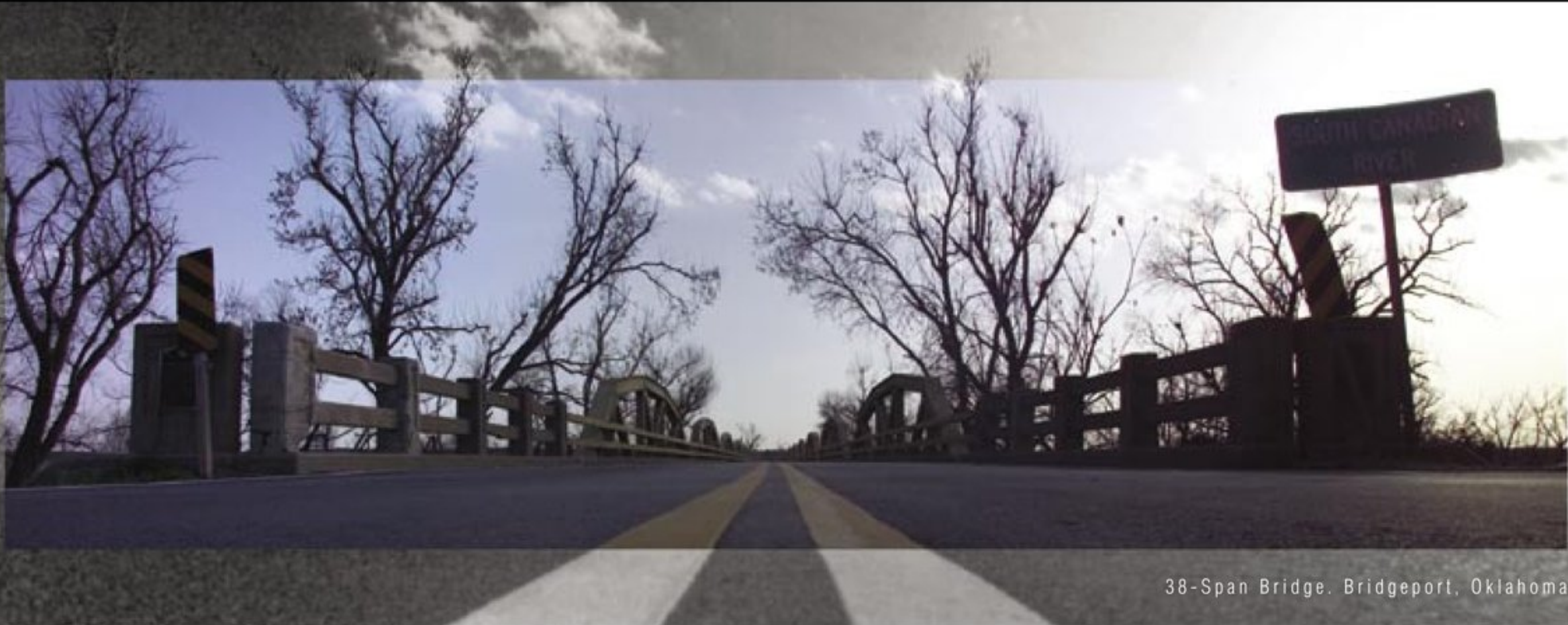
38-Span Bridge. Bridgeport, Oklahoma