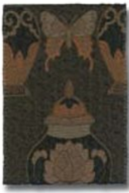
Living Area Accent