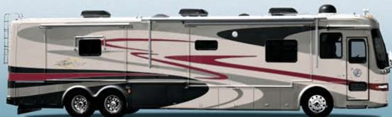
SUNLIT SAND FULL BODY

ADDITIONAL FLOORPLANS MAY BE AVAILABLE ON OUR WEBSITE. www.tiffinmotorhomes.com