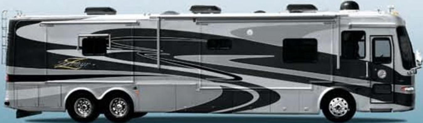
NASA FULL BODY