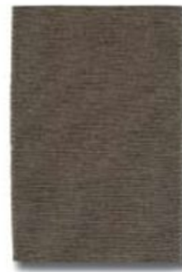
Living Area Accent