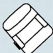
OPTIONAL RECLINER WITH END TABLE / COMPUTER DESK