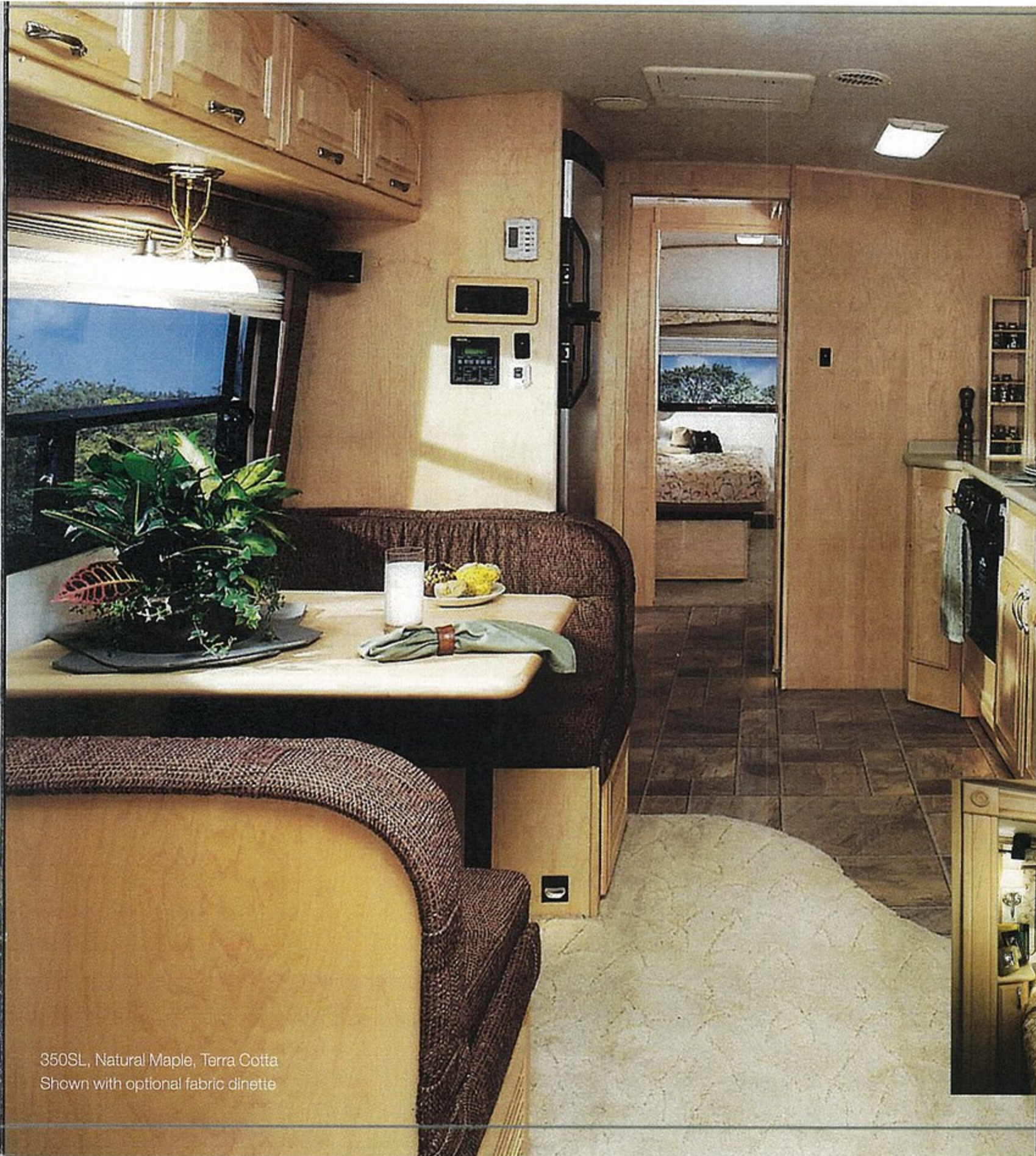
350SL, Natural Maple, Terra Cotta Shown with optional fabric dinette