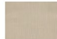
Bedspread & Throw Pillow