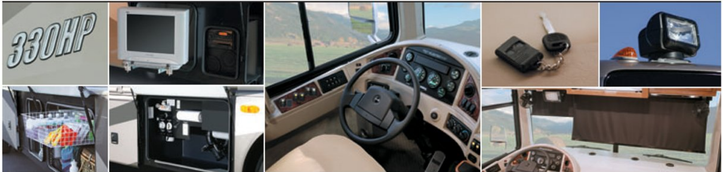
Vehicle shown in White Diamond full-body paint.

A CAT® C7 330 HORSE POWER ENGINE comes standard in Discovery, providing supreme driving and towing power.