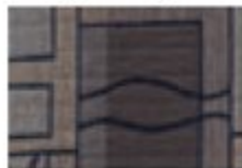
Sofa Bed & Dinette Cushions