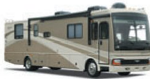
White Diamond (opt#502)