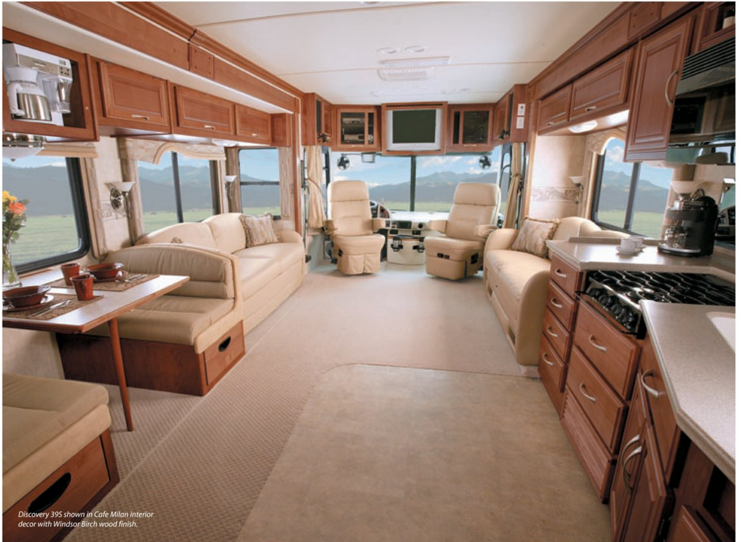
Discovery 395 shown in Cafe Milan interior decor with Windsor Birch wood finish.