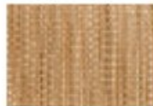
Sofa Bed & Dinette Cushions