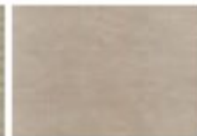
Ultraleather™ Driver & Front Passenger Seats