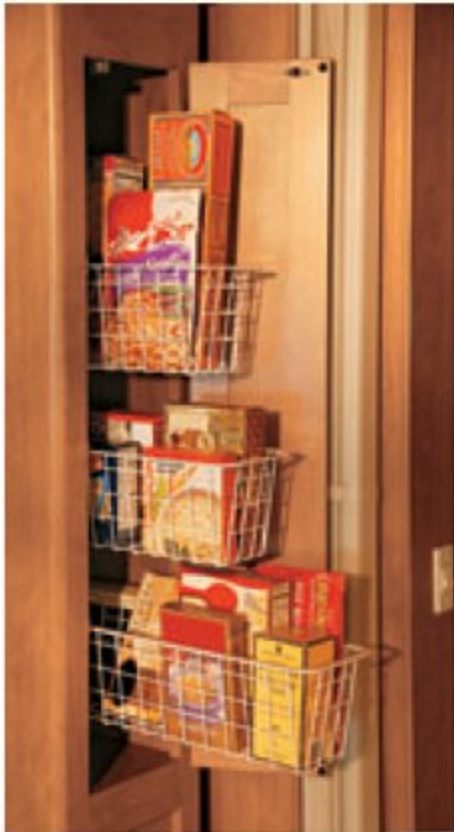
CONVENIENT PULL-OUT BASKETS (select models) in the galley pantry, slide in/out with ease for storing your non-perishable food items.