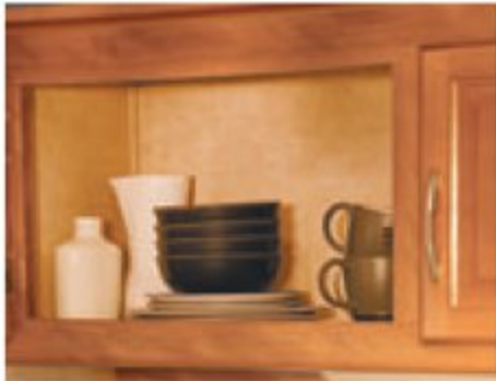
CONVENIENT OVERHEAD STORAGE above the sink provides plenty of room for full-size plates and dishes.