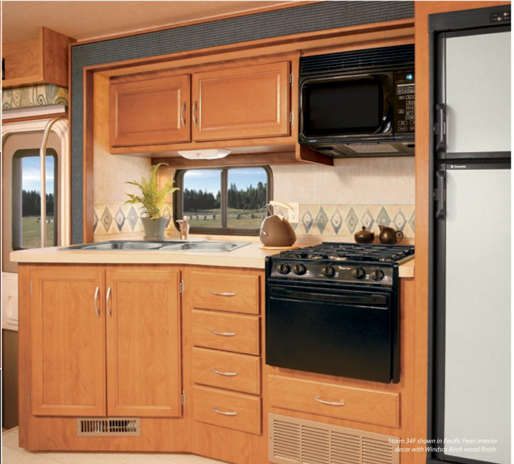
Storm 34F shown in Pacific Pearl interior decor with Windsor Birch wood finish.