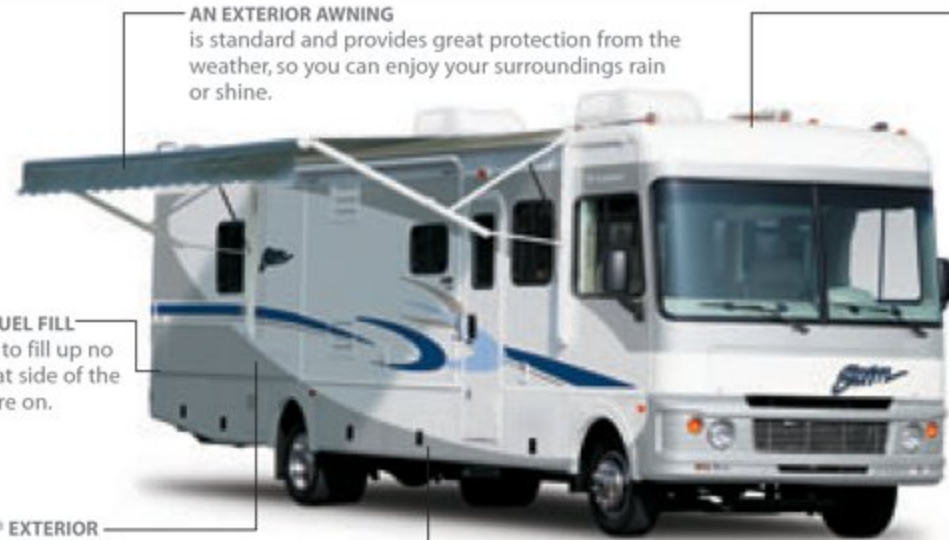
Vehicle shown in Pacific Pearl.

STORAGE COMPARTMENTS are lighted and include single paddle latches, gas-lift strut supports, stainless-steel hinges and insulated aluminum doors.