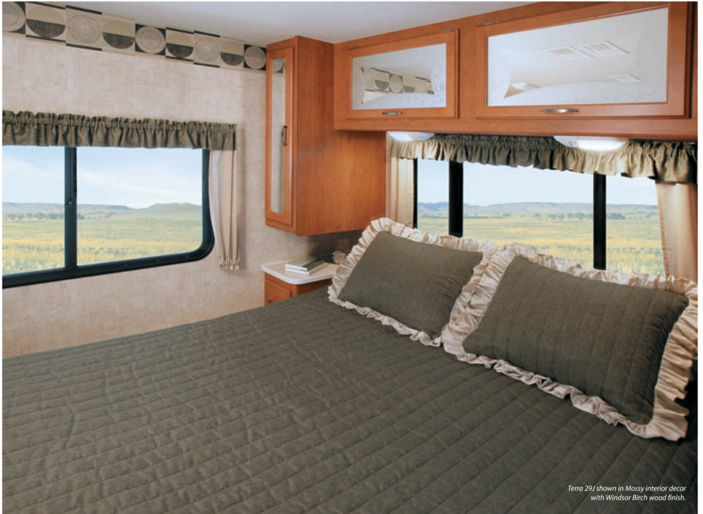
Terra 29J shown in Mossy interior decor with Windsor Birch wood finish.