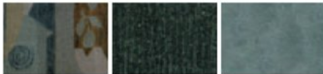
Sofa Bed & Dinette Cushions