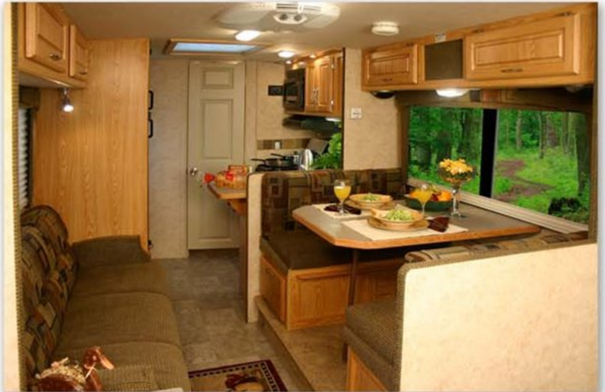
▲ Dinette and Love Seat

This brochure may not be used for contractual purposes. Bigfoot Industries reserves the right to improve or modify its products without prior written notice.