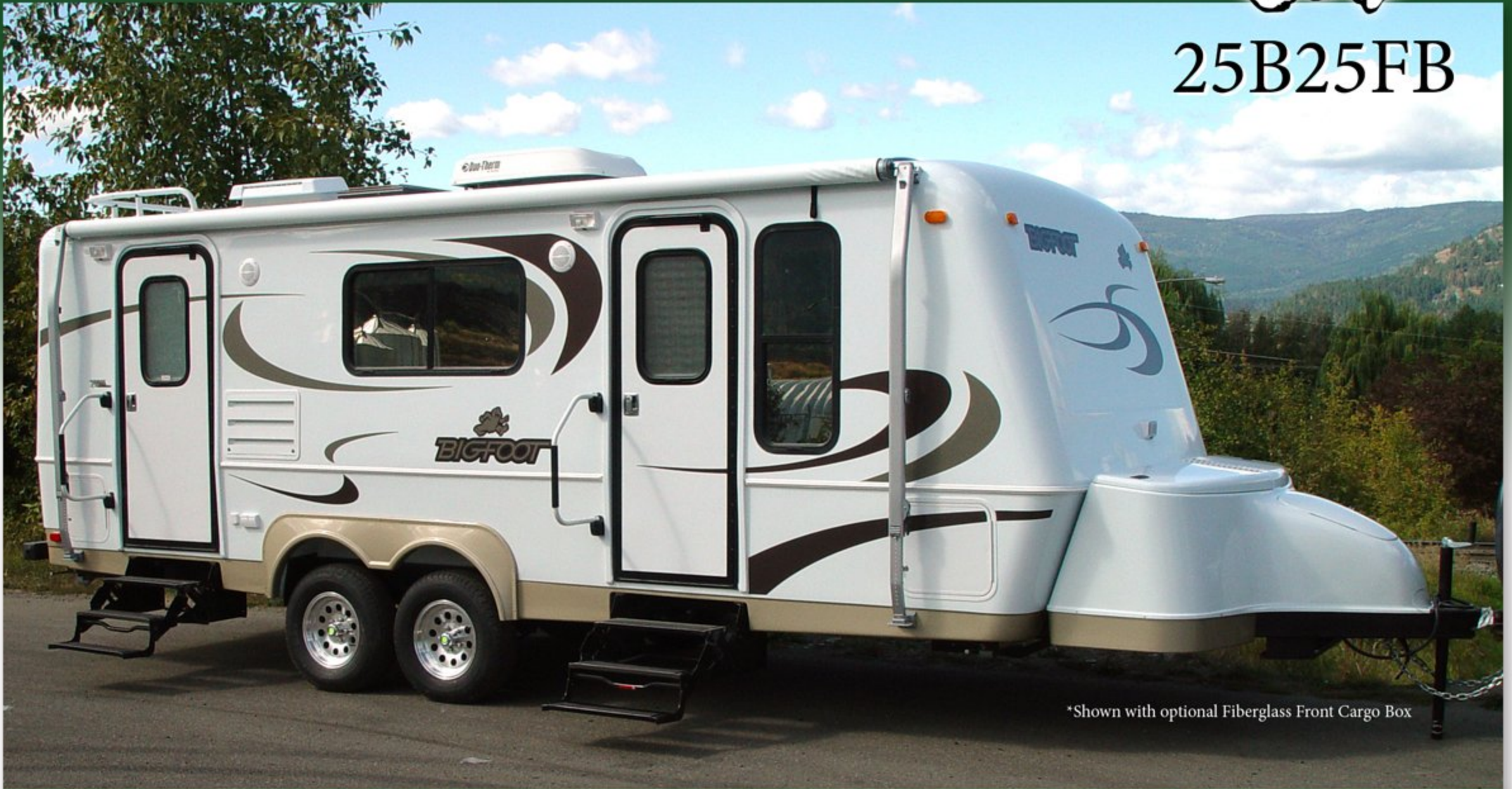
*Shown with optional Fiberglass Front Cargo Box