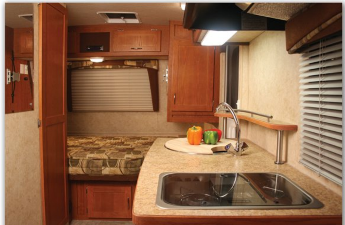
▲ Galley and Bedroom