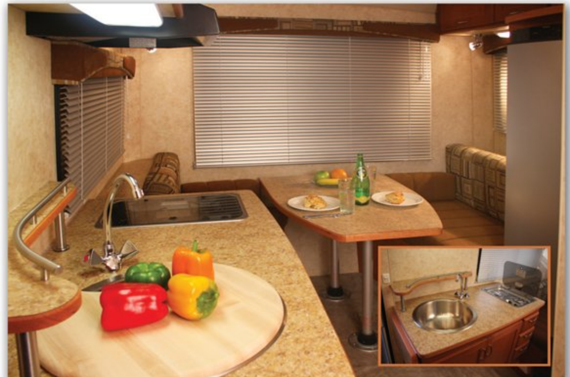
▲ Galley and Dinette

*To top of Refrigerator Vent ** Not including optional Front Cargo Box