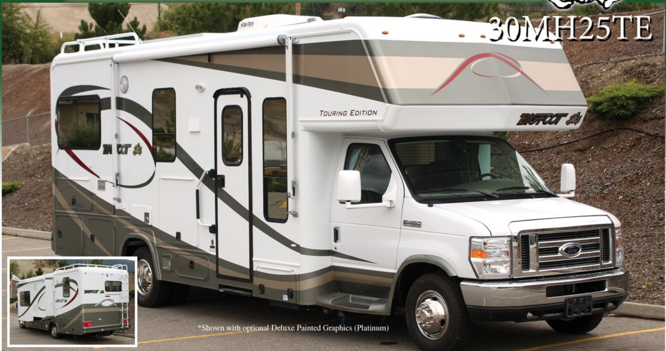
*Shown with optional Deluxe Painted Graphics (Platinum)