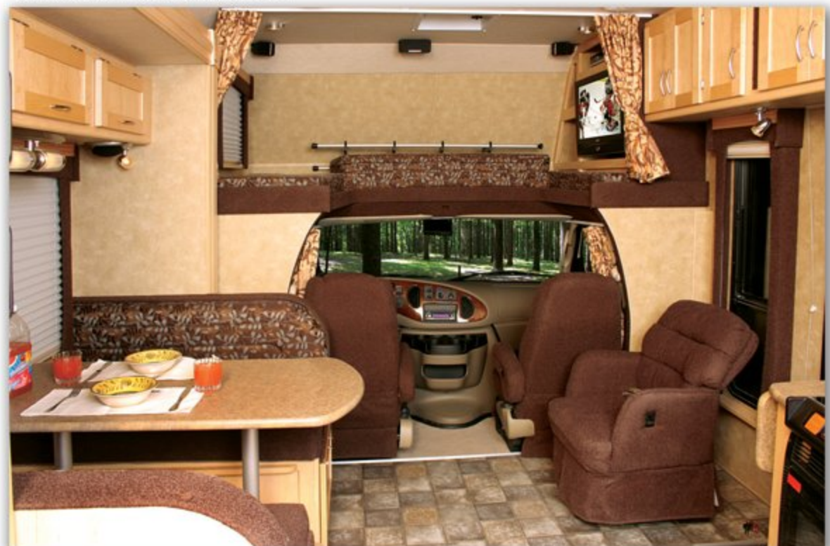
▲ Dinette and Front Bunk shown with optional 26" LCD HDTV