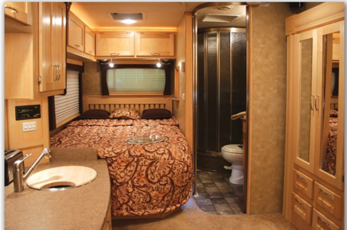
▲ Bedroom and Bathroom

This brochure may not be used for contractual purposes. Bigfoot Industries reserves the right to improve or modify its products without prior written notice.