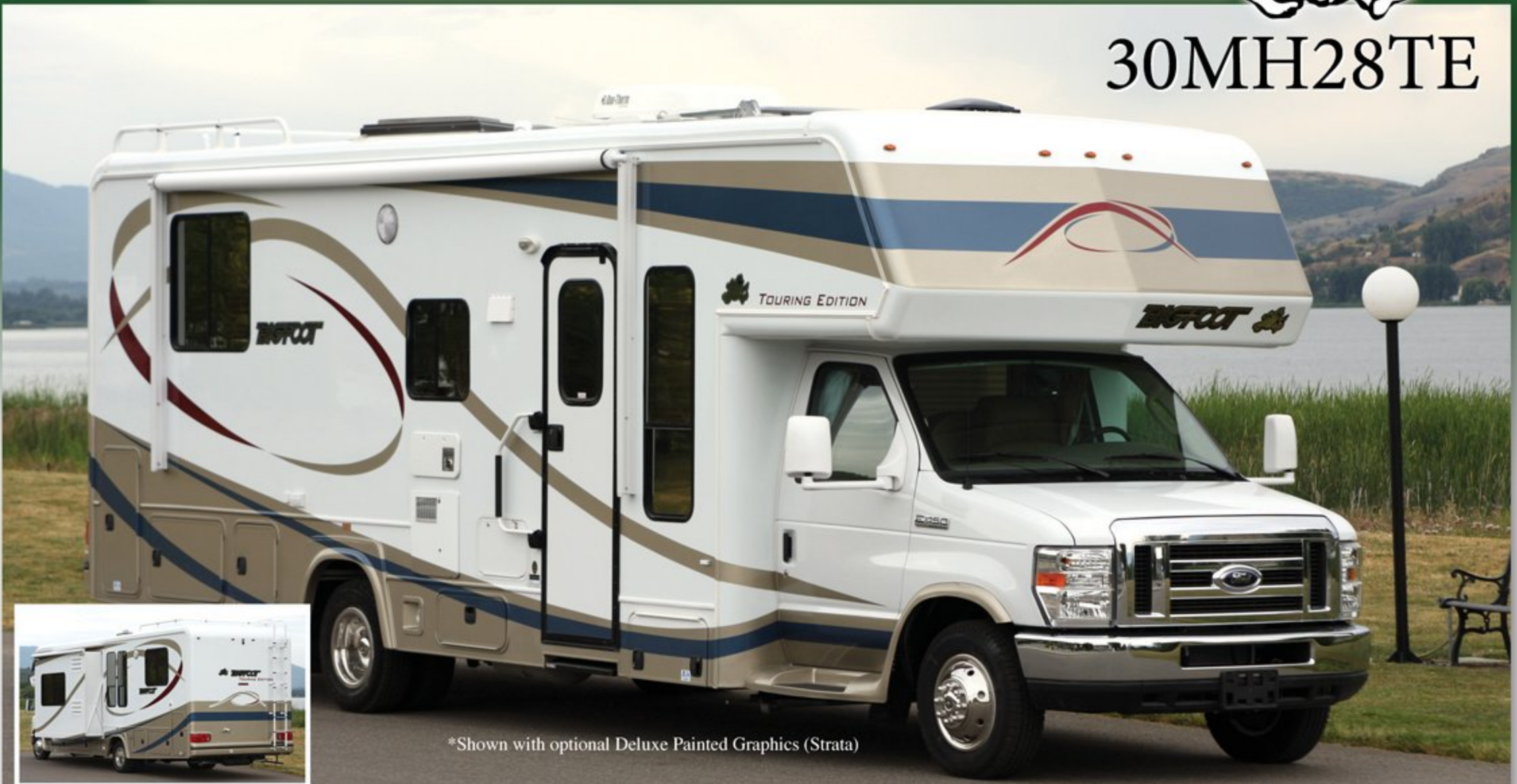
*Shown with optional Deluxe Painted Graphics (Strata)