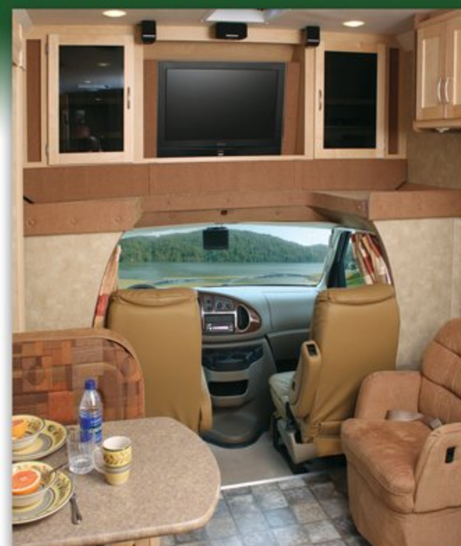
▲ Living Area