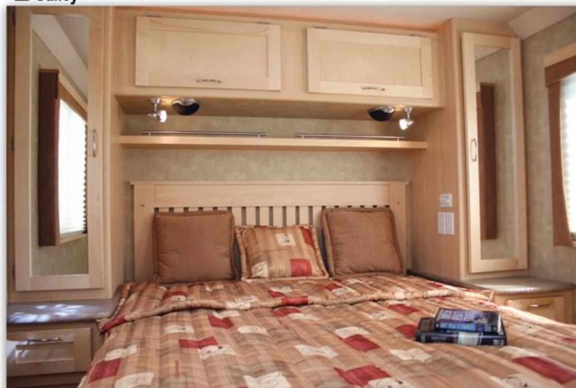
▲ 60" x 74" Walk Around Bed

This brochure may not be used for contractual purposes. Bigfoot Industries reserves the right to improve or modify its products without prior written notice.