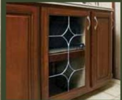
The spacious kitchen of the 40SBS features an under mount stainless steel sink, swing out storage and Corian® counter tops.