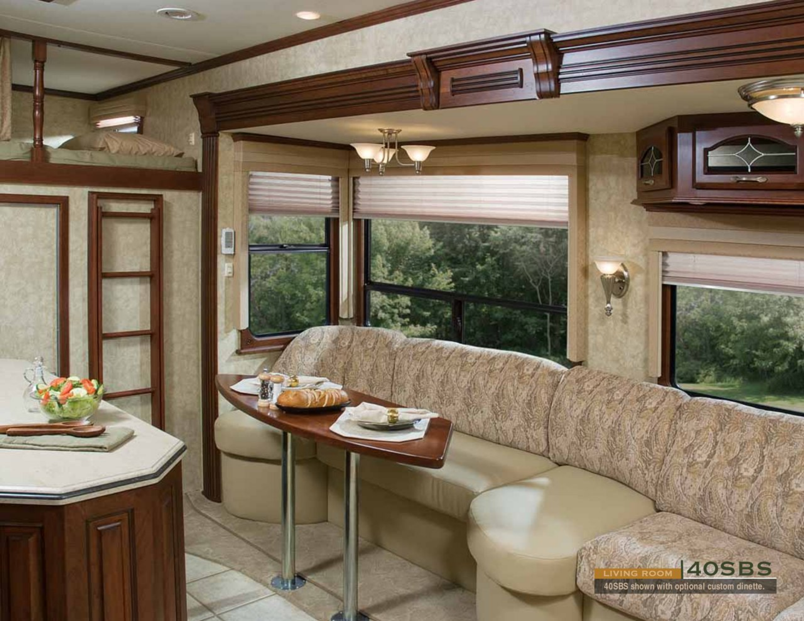
LIVING ROOM | 40SBS 40SBS shown with optional custom dinette.