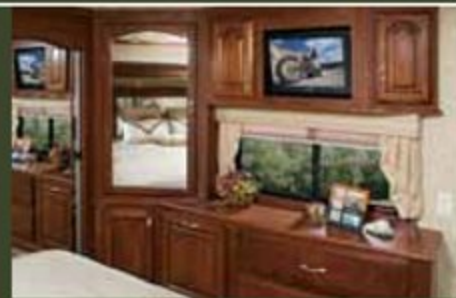
All Escalade Sportsters feature a bedroom retreat with ample hanging storage, 19" LCD TV and designer bedding package. This bedroom will be your place to get away from it all.