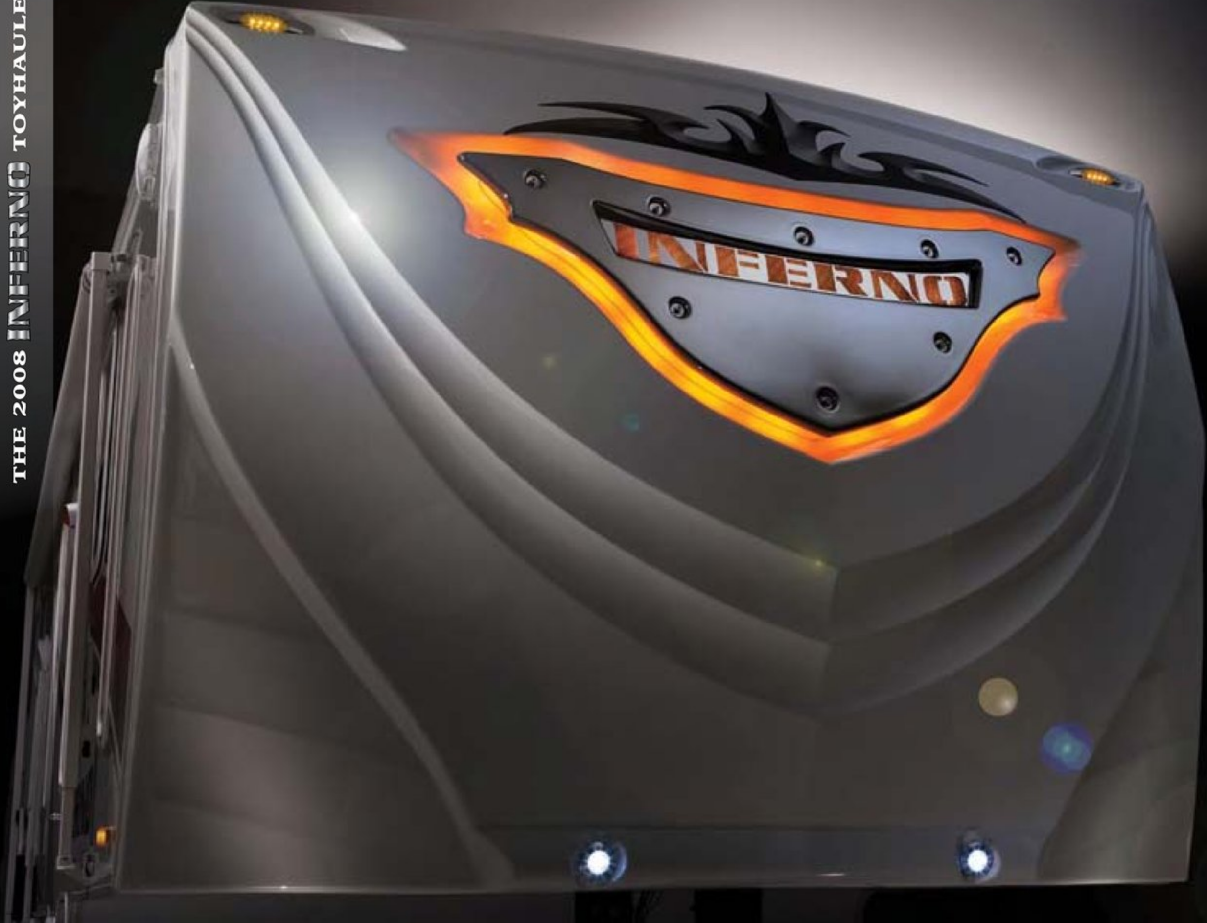
THE 2008 INFERNO TOYHAULER