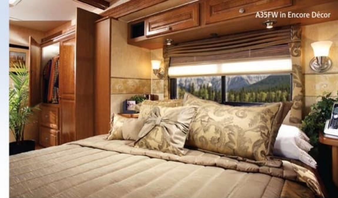
A35FW in Encore Décor

Leave your cares behind and explore the big, beautiful world out there in the luxurious and tastefully appointed Embassy, which promises even more of the comforts of home in 2009. No matter how far afield you travel, you'll feel indulged amidst amenities like reclining optima leather seats, wood-framed refreshment center, standard LCD TV and home theater center with CD and DVD. It's powered by a Ford 6.8L V-10 Triton engine and constructed to Triple E's exacting standards. So get behind the wheel and relax. New worlds beckon.