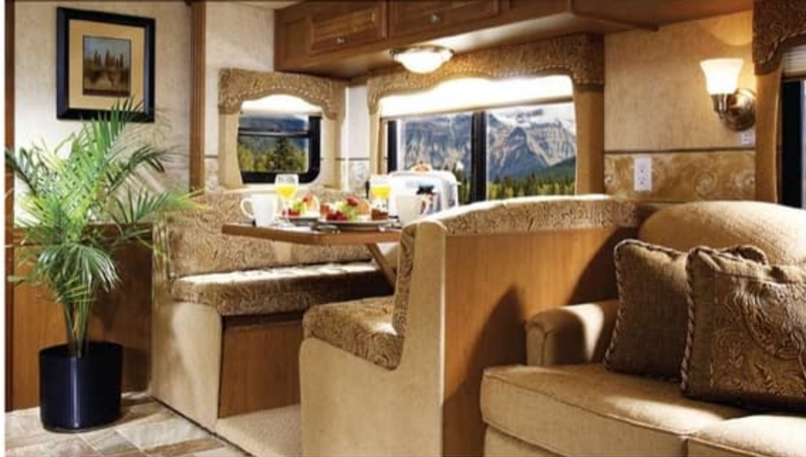
All 3 pictures: A35FW in Encore Décor

The booth dinette is one of the most versatile features of the Embassy A35 series. A full slide accommodates the dinette (which affords additional sleeping if needed) and hide-a-bed in coordinating fabrics.