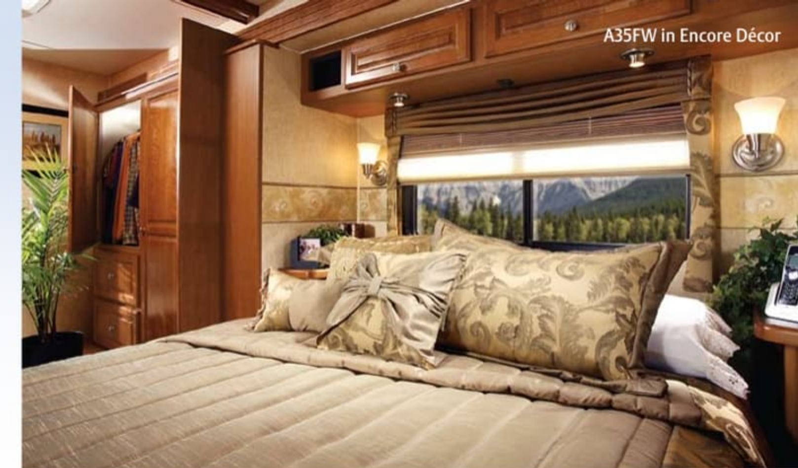
A35FW in Encore Décor

Leave your cares behind and explore the big, beautiful world out there in the luxurious and tastefully appointed Embassy, which promises even more of the comforts of home in 2009. No matter how far afield you travel, you'll feel indulged amidst amenities like reclining optima leather seats, wood-framed refreshment center, standard LCD TV and home theater center with CD and DVD. It's powered by a Ford 6.8L V-10 Triton engine and constructed to Triple E's exacting standards. So get behind the wheel and relax. New worlds beckon.