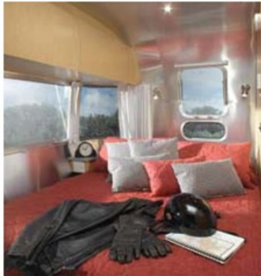
▲ Large Queen Size Bed.

▼ Dining and Galley Area in the PanAmerica