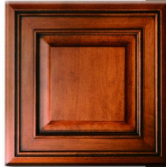
Washington Cherry Glazed Maple