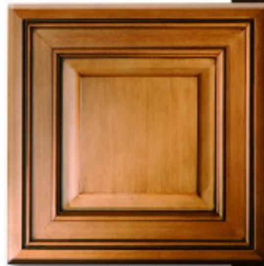
Burnished Glazed Maple