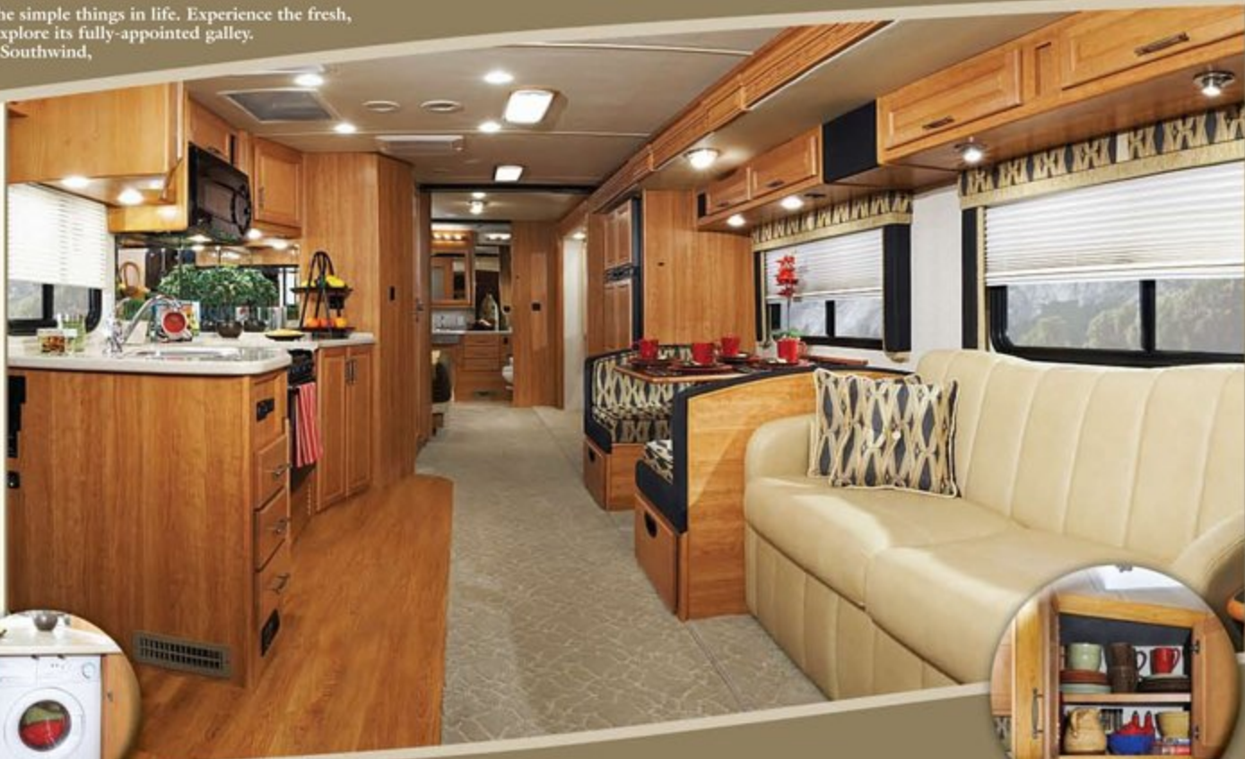
Southwind 36D shown in Domino interior décor with Symphony Cherry wood cabinetry.