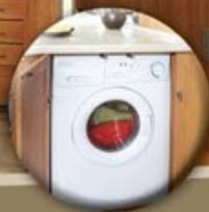
Optional washer/dryer combo available on select models.