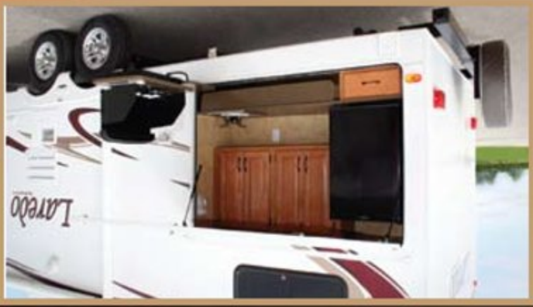
291 TG Shown in Rain Forest Decor

Laredo gives best in class outdoor cooking with the industry leading Outside Kitchen.