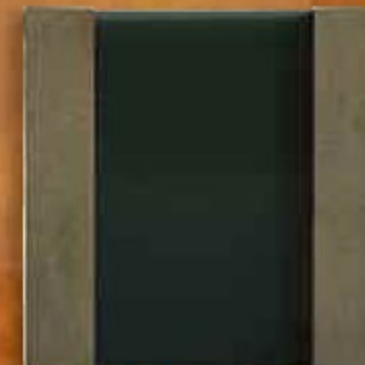
Cabinet Door (Lava)