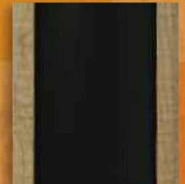
2-Tone Wood (Bedrock)