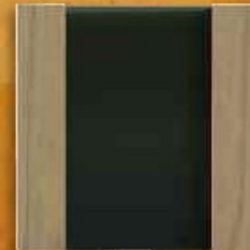
Cabinet Door (Bedrock)