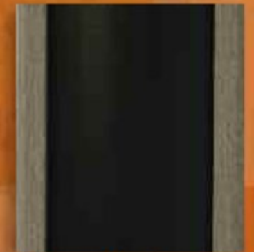
2-Tone Wood (Lava)