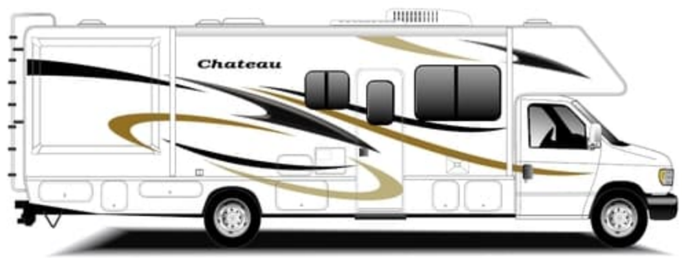
Standard Graphics Package