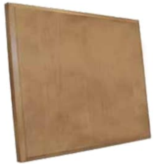
Standard Cinnamon Maple Cabinetry