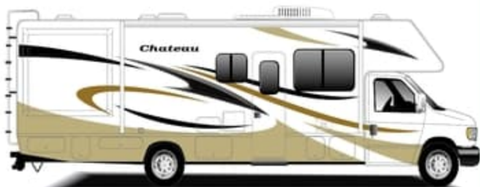
Optional Partial Paint and Graphics Package