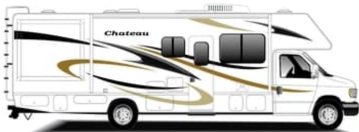
Standard Graphics Package