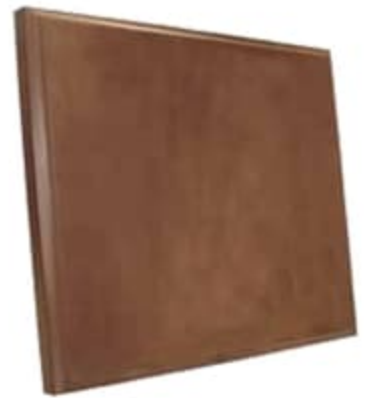
Optional Cherry Cabinetry