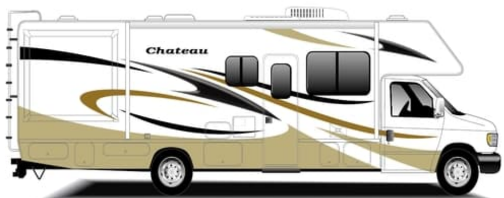
Optional Partial Paint and Graphics Package