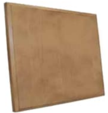
Standard Cinnamon Maple Cabinetry