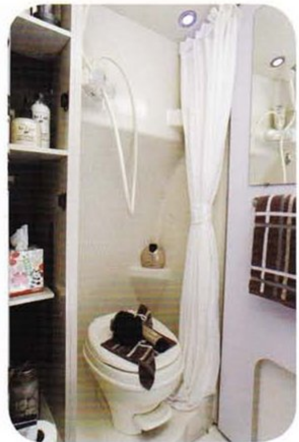
▲ Wet bath