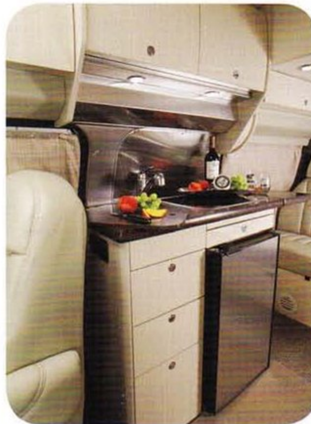
▲ Galley in Light Camel decor