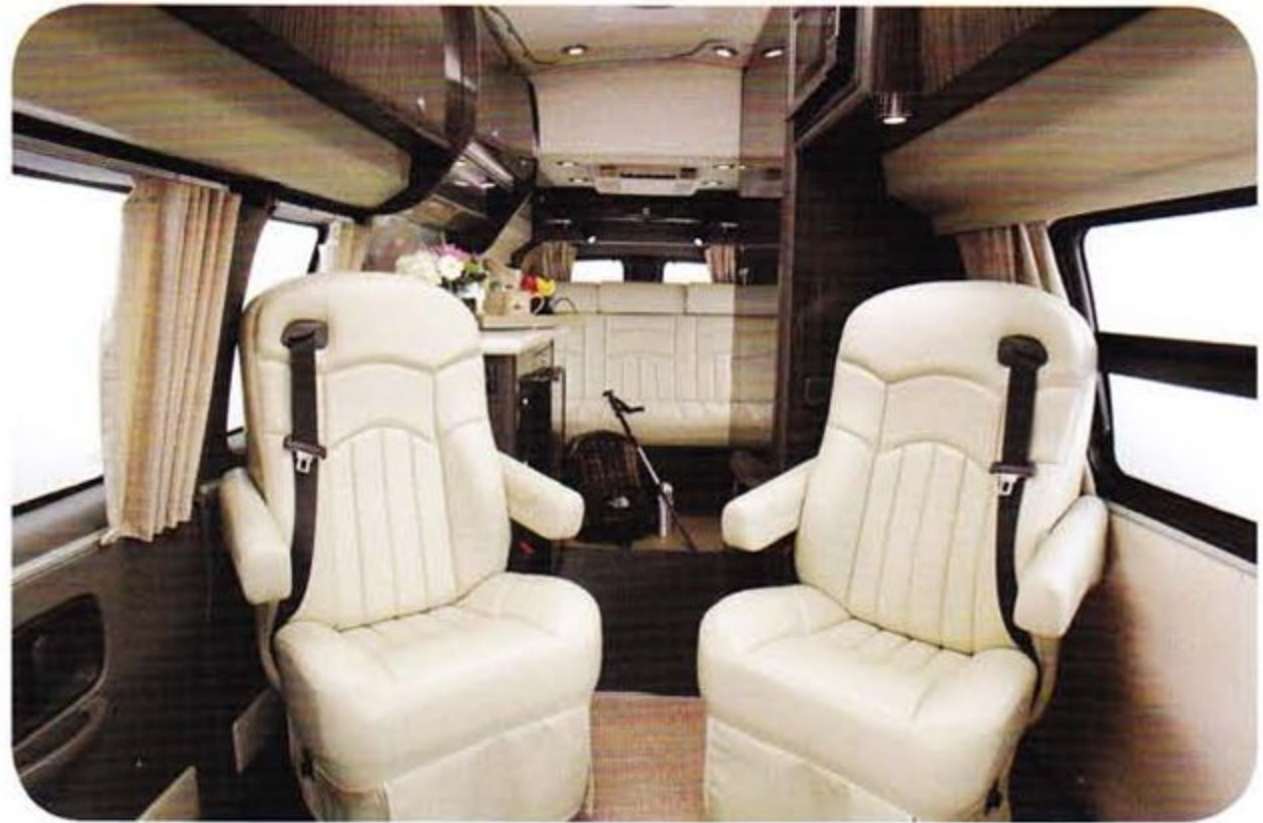
▲ Front-to-back interior in Onyx decor