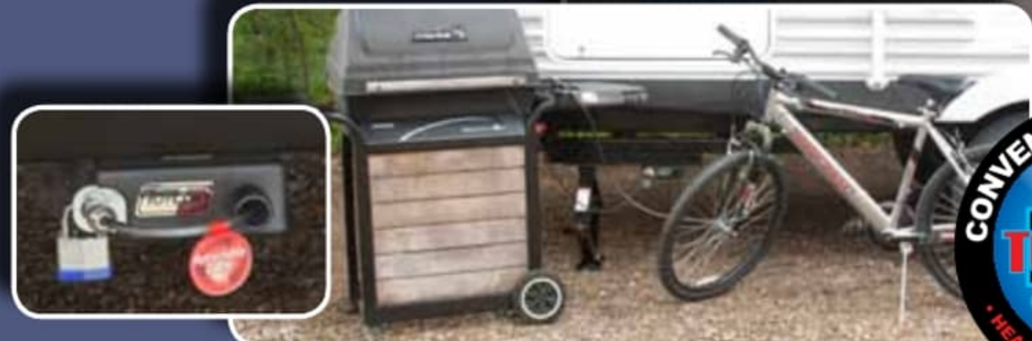
OPTIONAL ToyLok. Quick and easy security for bikes, grills and other items you wish to secure while your away.