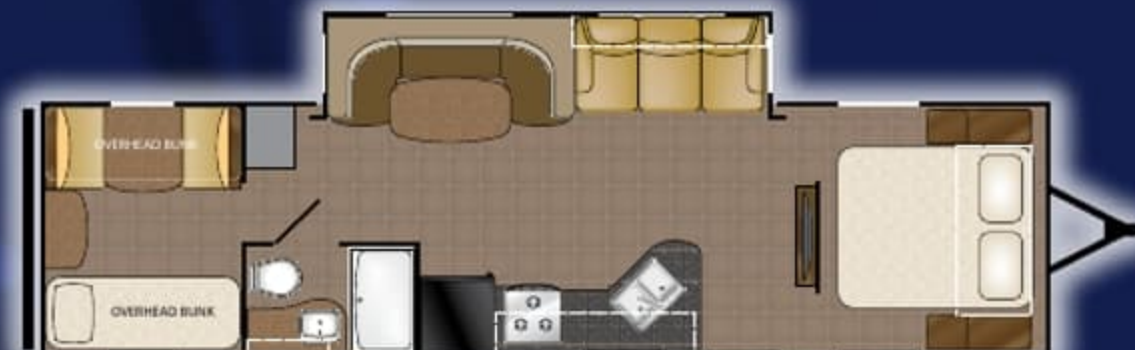
TR 30 USBH

Fresh: 50 gal. Gray: 37 gal. Black: 37 gal.