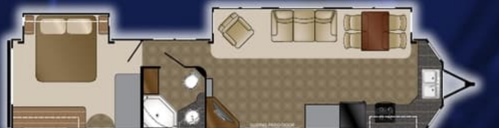
TR DT 40 FKDS

Dry: TBD Carrying: TBD Hitch: TBD Length: 40'-11" Height: 12'-9" Width: 8'-0" Fresh: 50 gal. Gray: 37 gal. x2 Black: 37 gal.