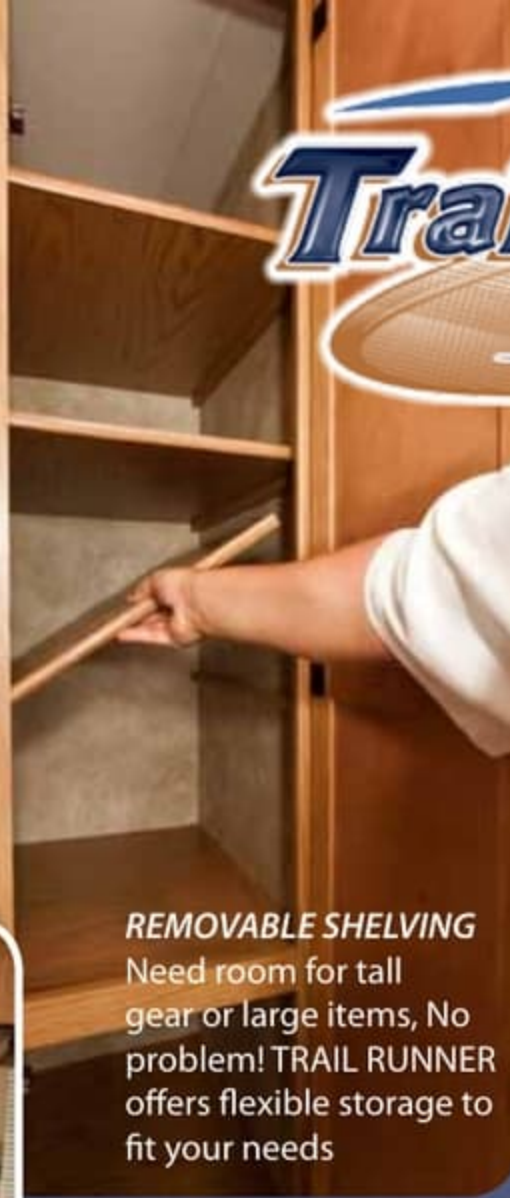
REMOVABLE SHELVING Need room for tall gear or large items, No problem! TRAIL RUNNER offers flexible storage to fit your needs