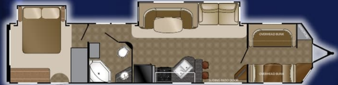
TR DT 40 DBDS

Dry: TBD Carrying: TBD Hitch: TBD Length: TBD Height: 12'-9" Width: 8'-0" Fresh: 50 gal. Gray: 37 gal. x3 Black: 37 gal.