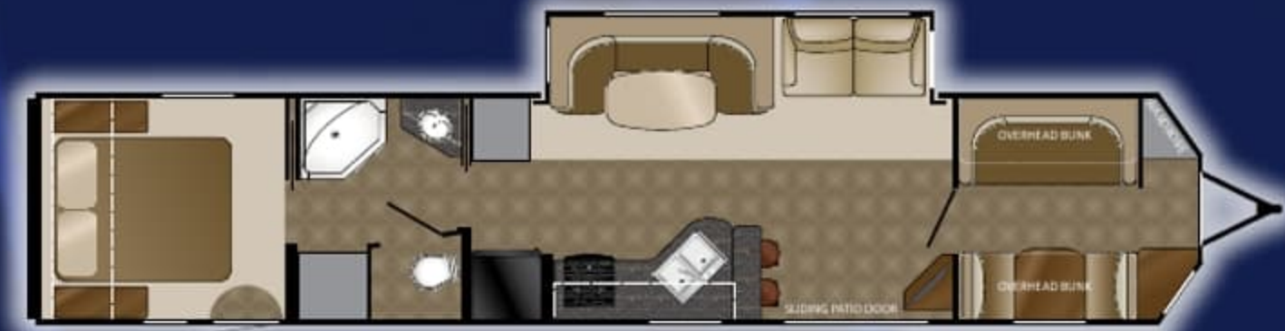
TR DT 39 DBSS

Dry: TBD Carrying: TBD Hitch: TBD Length: TBD Height: 12'-9" Width: 8'-0" Fresh: 50 gal. Gray: 37 gal. x3 Black: 37 gal.