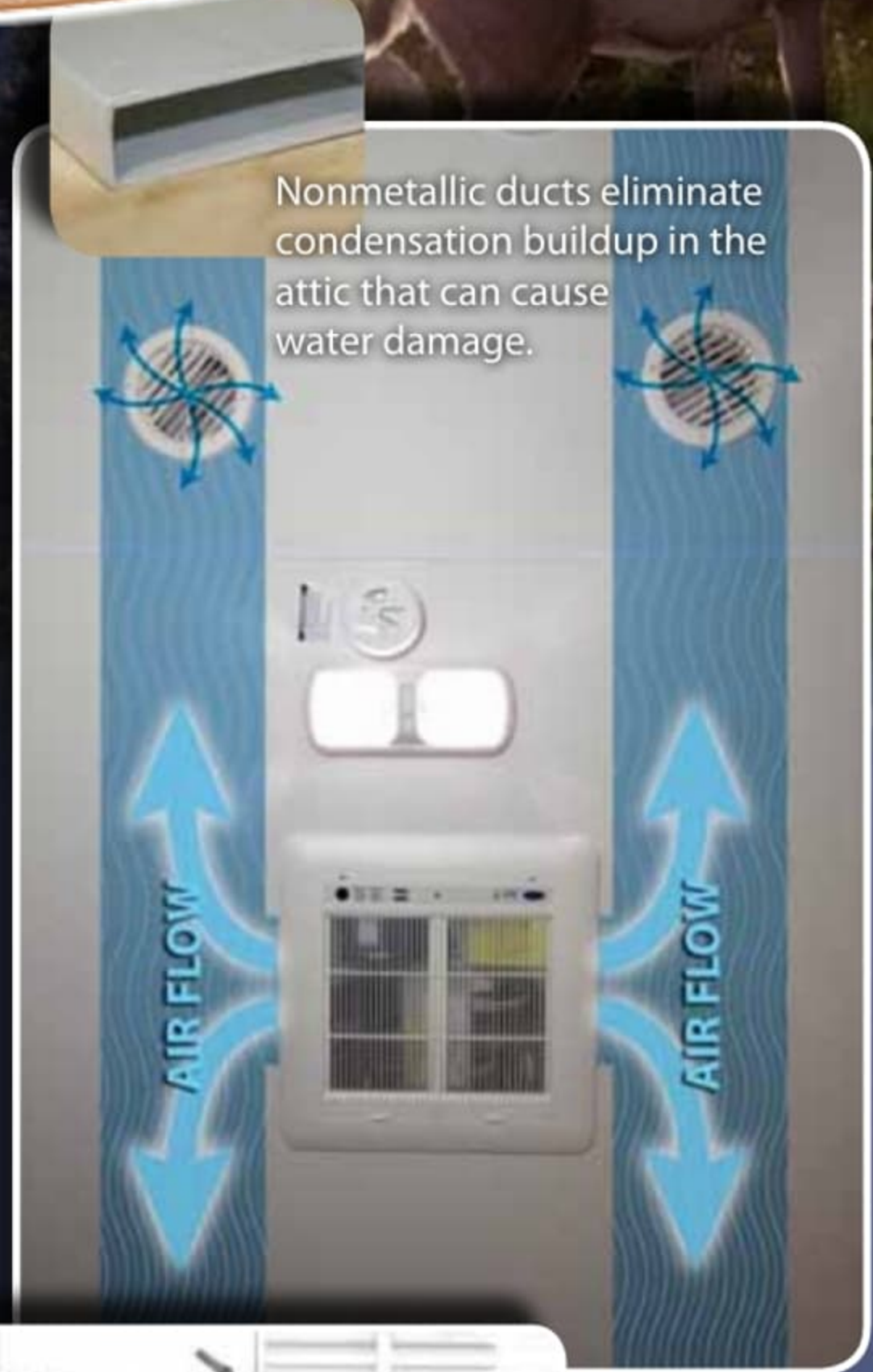
DUAL DUCTED AC Comfort is key. TRAIL RUNNER'S dual ducted AC distributes the cool air evenly throughout the travel trailer rather than cooling one spot and relying on fans to spread it around.