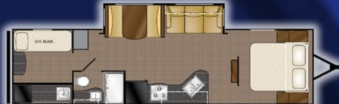
TR 30 OKBS

Fresh: 50 gal. Gray: 37 gal. Black: 37 gal.