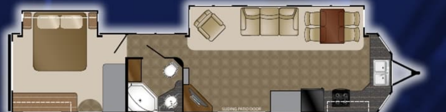
TR DT 40 FKDS

Dry: TBD Carrying: TBD Hitch: TBD Length: 40'-11" Height: 12'-9" Width: 8'-0" Fresh: 50 gal. Gray: 37 gal. x2 Black: 37 gal.