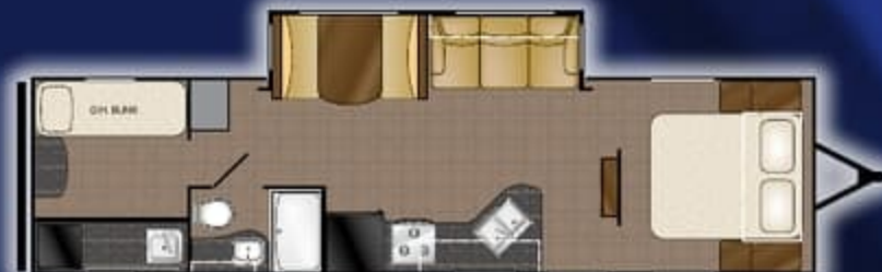
TR 30 OKBS

Fresh: 50 gal. Gray: 37 gal. Black: 37 gal.