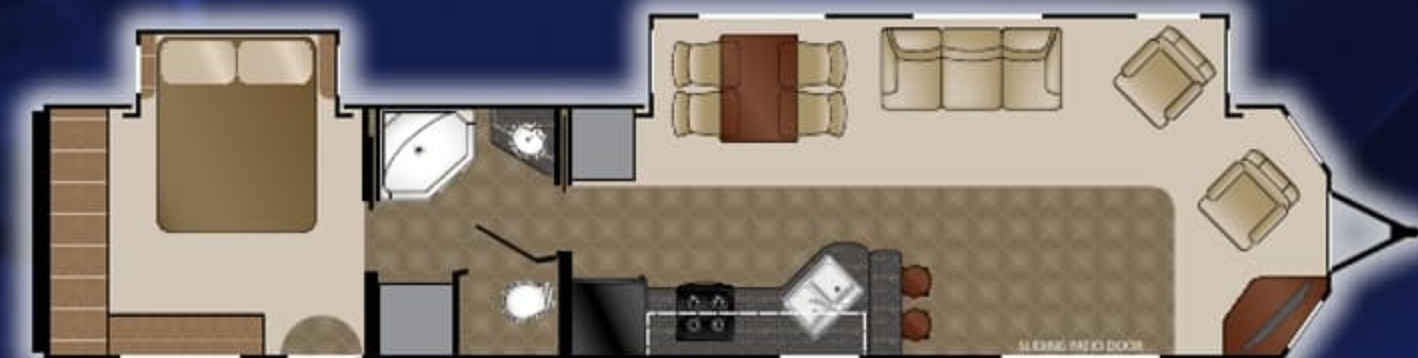
TR DT 40FLDS

Dry: TBD Carrying: TBD Hitch: TBD Length: TBD Height: 12'-9" Width: 8'-0" Fresh: 50 gal. Gray: 37 gal. x2 Black: 37 gal.