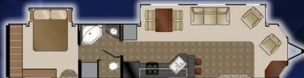
TR DT 40FLDS

Dry: TBD Carrying: TBD Hitch: TBD Length: TBD Height: 12'-9" Width: 8'-0" Fresh: 50 gal. Gray: 37 gal. x2 Black: 37 gal.