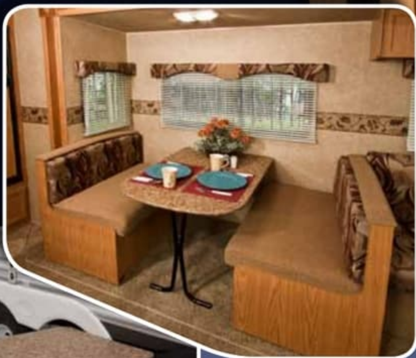
FREE-STANDING DINETTE TABLE The free-standing dinette table offers maximum flexibility. You can even take the table outside for lunch to enjoy the outdoors.