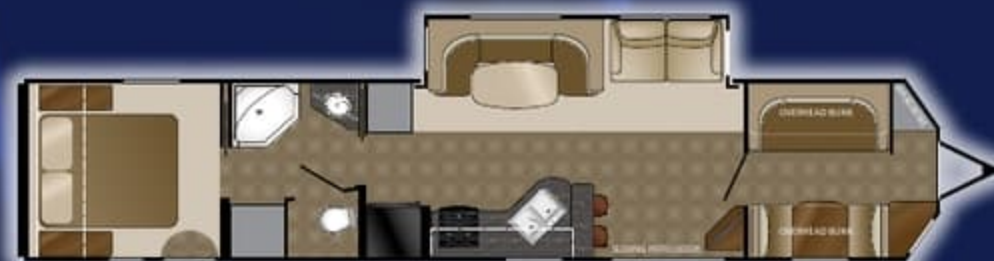
TR DT 39 DBSS

Dry: TBD Carrying: TBD Hitch: TBD Length: TBD Height: 12'-9" Width: 8'-0" Fresh: 50 gal. Gray: 37 gal. x3 Black: 37 gal.