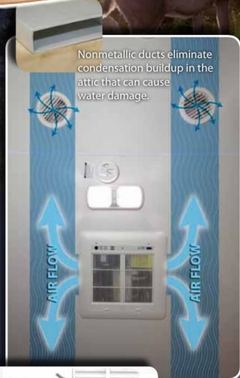
DUAL DUCTED AC Comfort is key. TRAIL RUNNER'S dual ducted AC distributes the cool air evenly throughout the travel trailer rather than cooling one spot and relying on fans to spread it around.