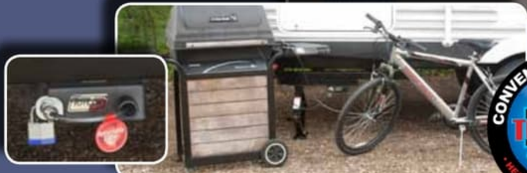
OPTIONAL ToyLok. Quick and easy security for bikes, grills and other items you wish to secure while your away.