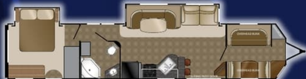
TR DT 40 DBDS

Dry: TBD Carrying: TBD Hitch: TBD Length: TBD Height: 12'-9" Width: 8'-0" Fresh: 50 gal. Gray: 37 gal. x3 Black: 37 gal.