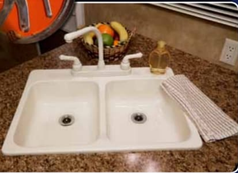
RESIDENTIAL 50/50 SINK No more little travel trailer sink, a real sink for a real kitchen