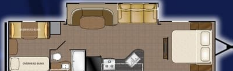
TR 30 USBH

Fresh: 50 gal. Gray: 37 gal. Black: 37 gal.