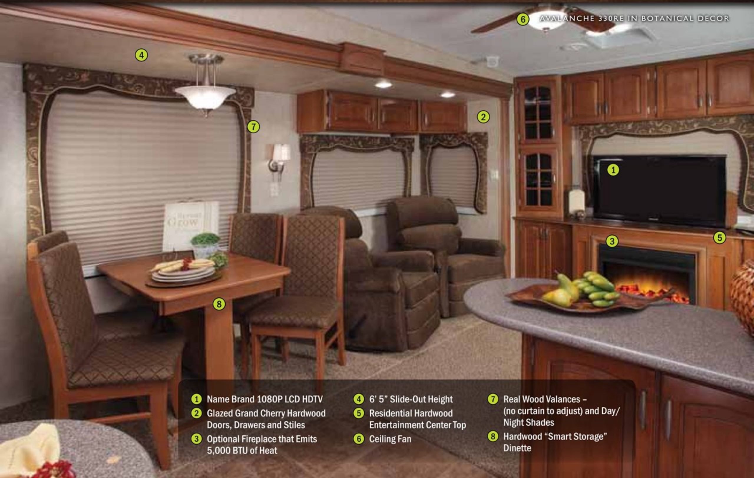
6 AVALANCHE 330RE IN BOTANICAL DECOR