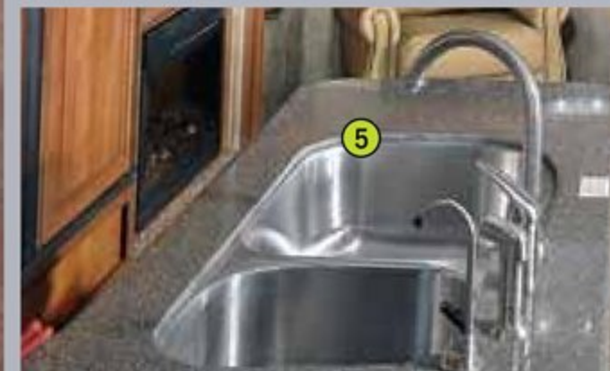
AVALANCHE 330RE KITCHEN