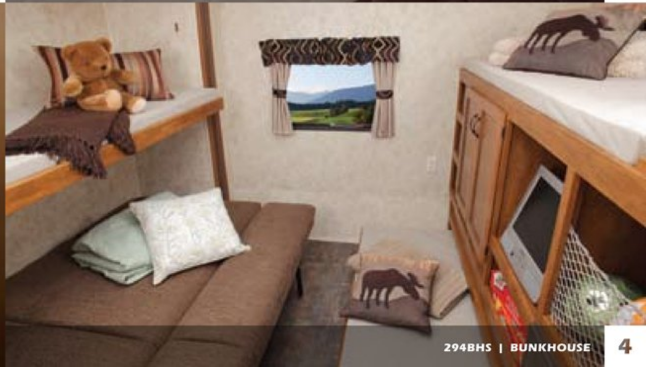
294BHS | BUNKHOUSE 4