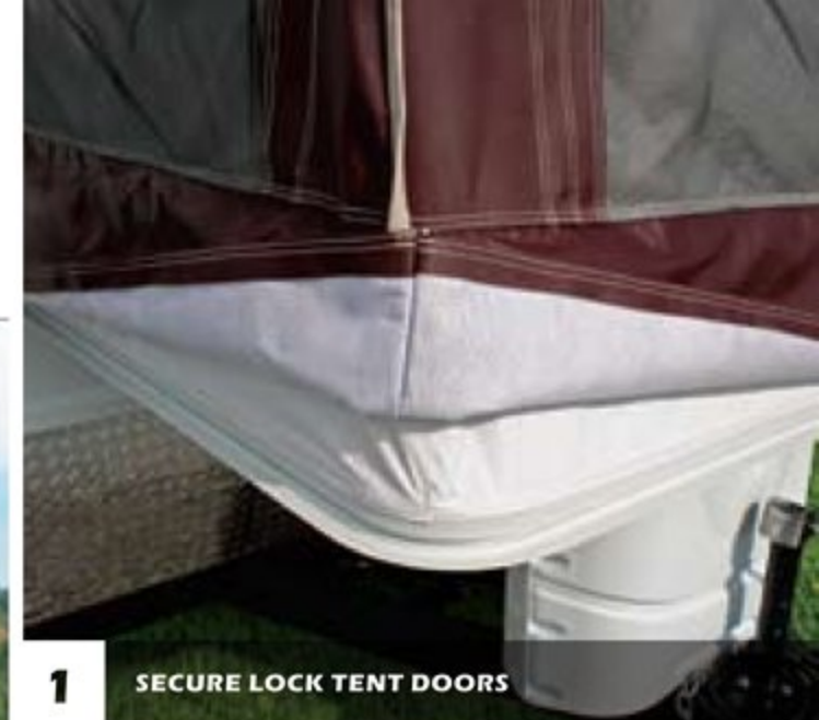
1 SECURE LOCK TENT DOORS