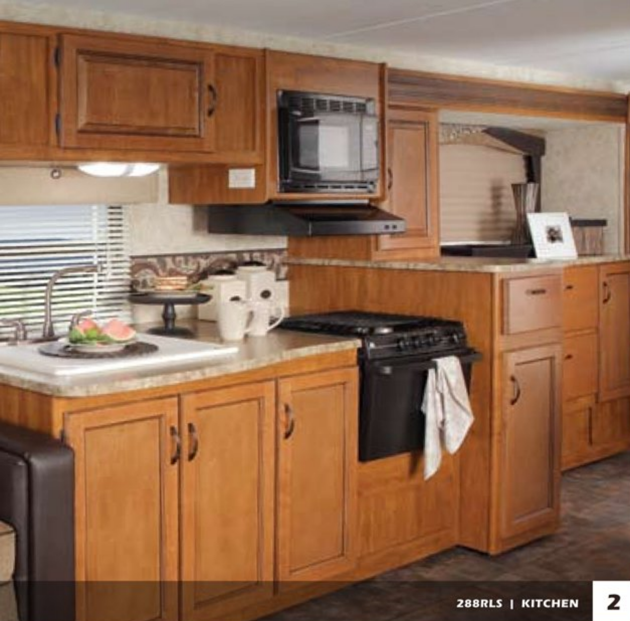
288RLS | KITCHEN 2