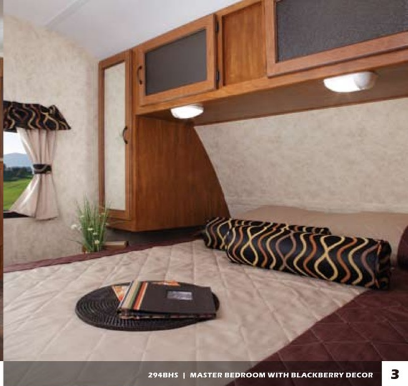
294BHS | MASTER BEDROOM WITH BLACKBERRY DECOR 3