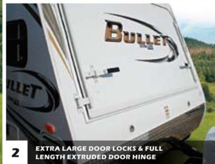
2 EXTRA LARGE DOOR LOCKS & FULL LENGTH EXTRUDED DOOR HINGE