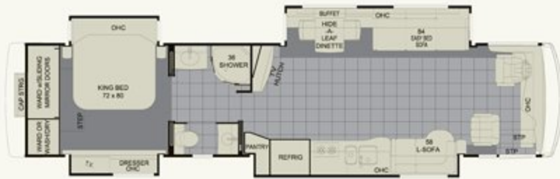
2011 Mountain Aire Diesel Pusher 4034

pusher power. And all at a surprising low sticker price. So the hardest decision to make is: which one?