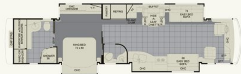
2011 Mountain Aire Diesel Pusher 4344