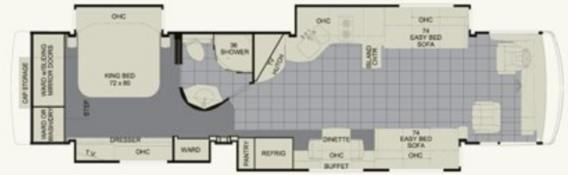
2011 Mountain Aire Diesel Pusher 4085