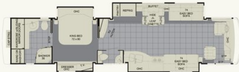
2011 Mountain Aire Diesel Pusher 4336