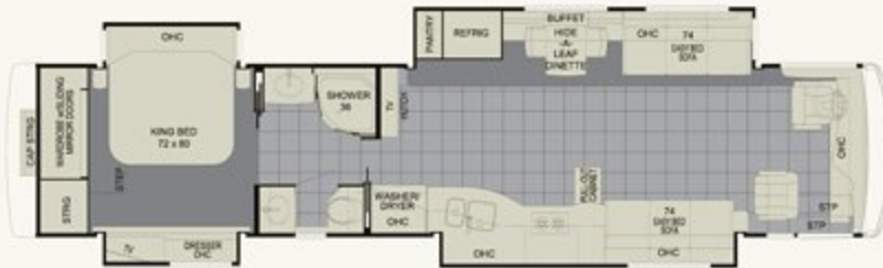
2011 Mountain Aire Diesel Pusher 4314