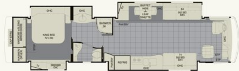
2011 Mountain Aire Diesel Pusher 4333