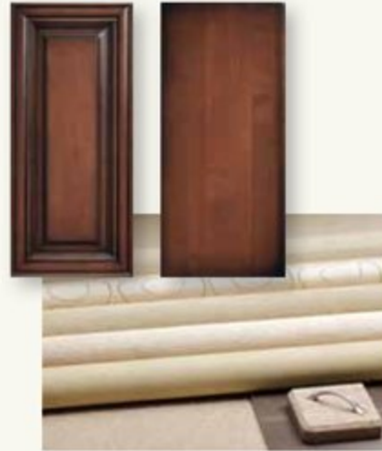
Manhattan Glazed Maple Hardwood