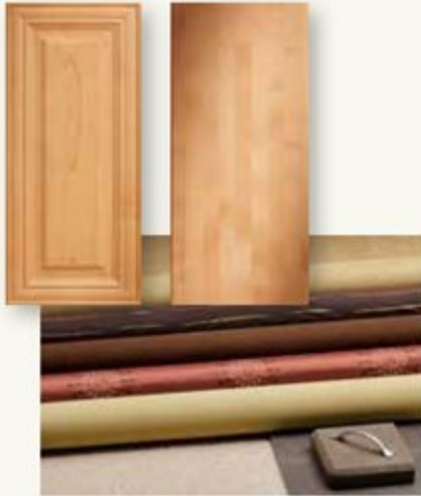
Windsor Beech Hardwood-Standard