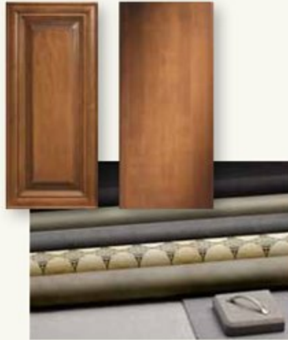
Mondavi Maple Hardwood