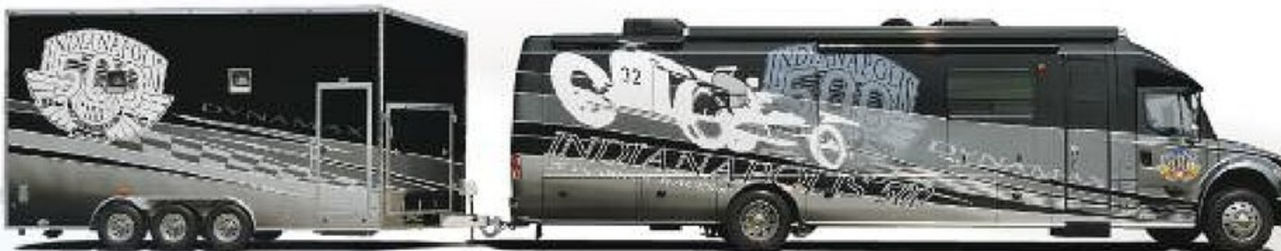
DynaQuest XL 100th Anniversary Indianapolis 500, Special Edition shown with matching stacker trailer.

Legendary Five Step Paint - Three on-site 25' x 60' down draft bake booths can apply any custom paint option you can dream up.