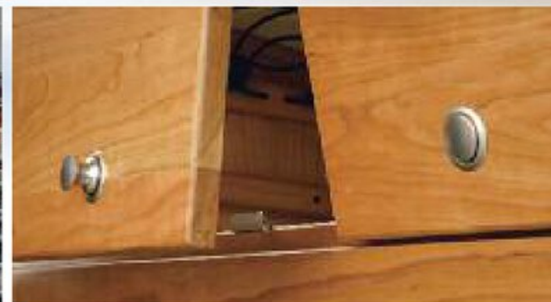
Contemporary Posi-Lock hardware secures cabinets and drawers