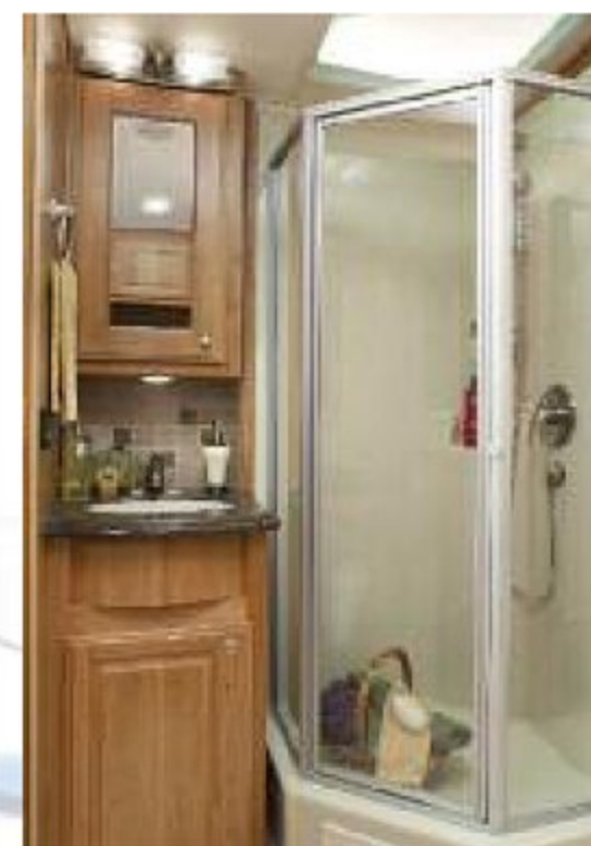
This Garnet bedroom slide out includes a queen size bed with a Serta® Mattress. The large neo-angle shower features a domed skylight for added light and headroom in the shower. The bath has a Natural Cherry hardwood medicine cabinet and a vanity a with Corian® countertop.