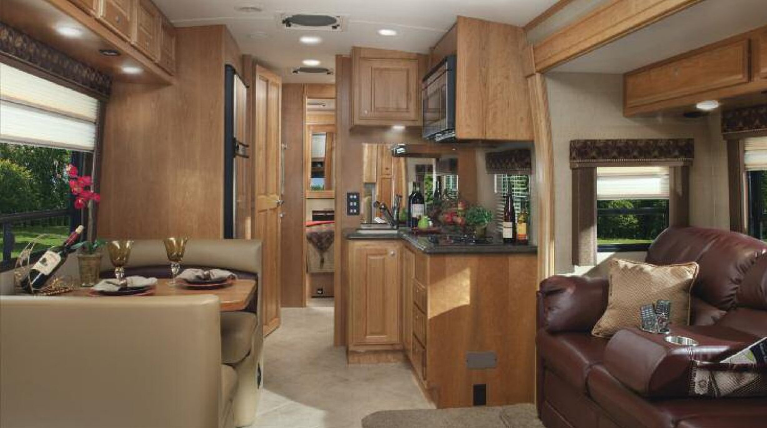
Model 340, shown with Garnet interior and Natural Cherry hardwood, features a Flexsteel® hide-a-bed sofa and optional two-tone ultra leather dream dinette.