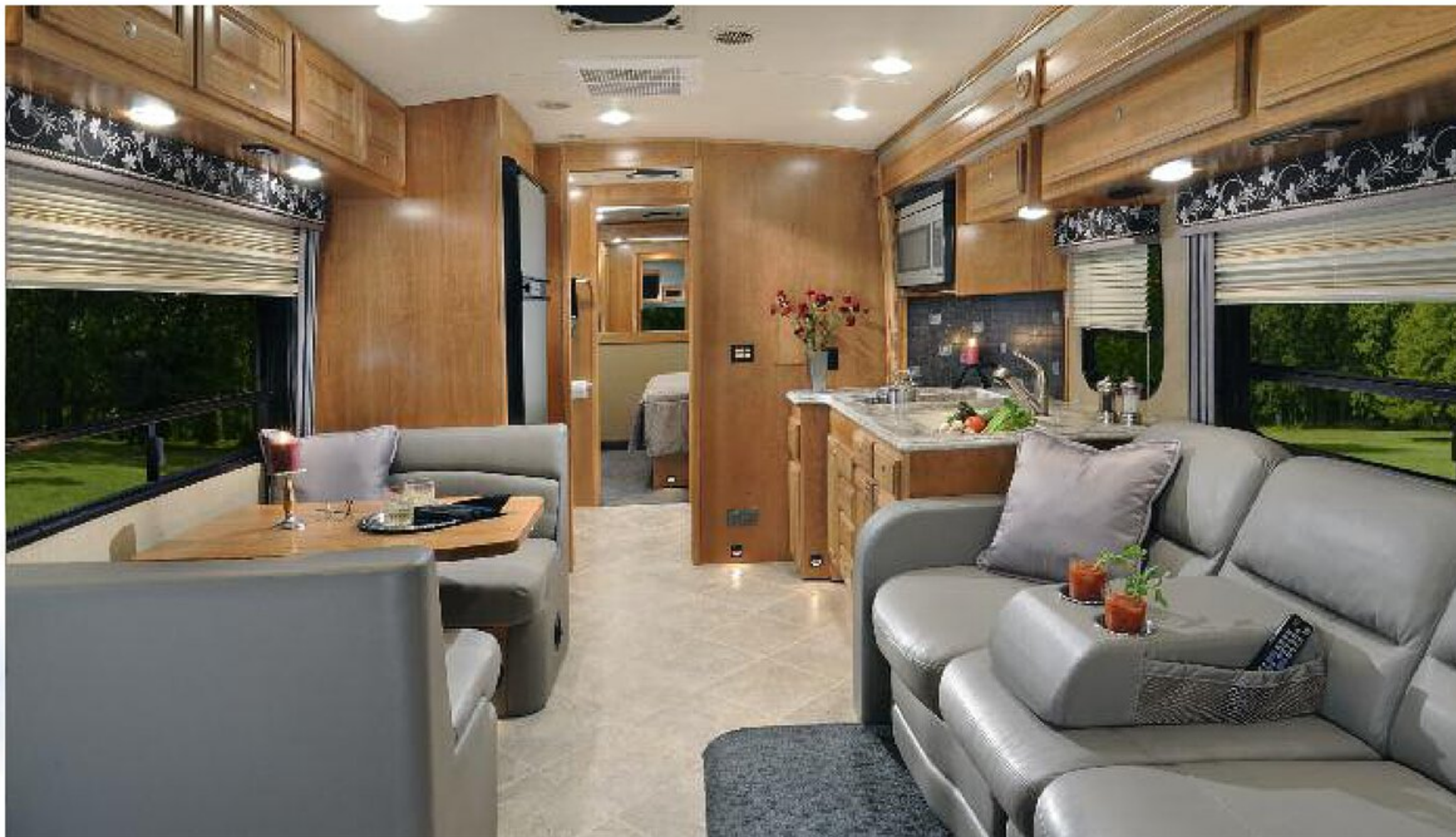
Model 360 shown with Slate Gray interior and optional ceramic tile flooring in kitchen, dining and bath areas. Kitchen features include Natural Cherry hardwood cabinets with raised panel doors, Corian® countertops, an over the range convection microwave oven and a 10 cubic foot refrigerator.