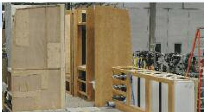
Dividing walls and cabinets are reinforced for added strength