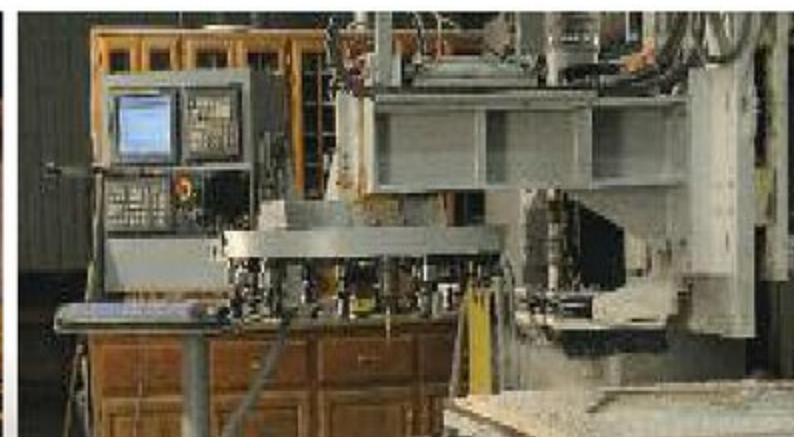
CNC routed custom Corian® countertops