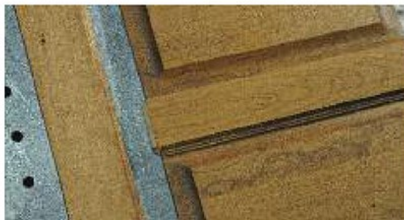
Raised panel door detail