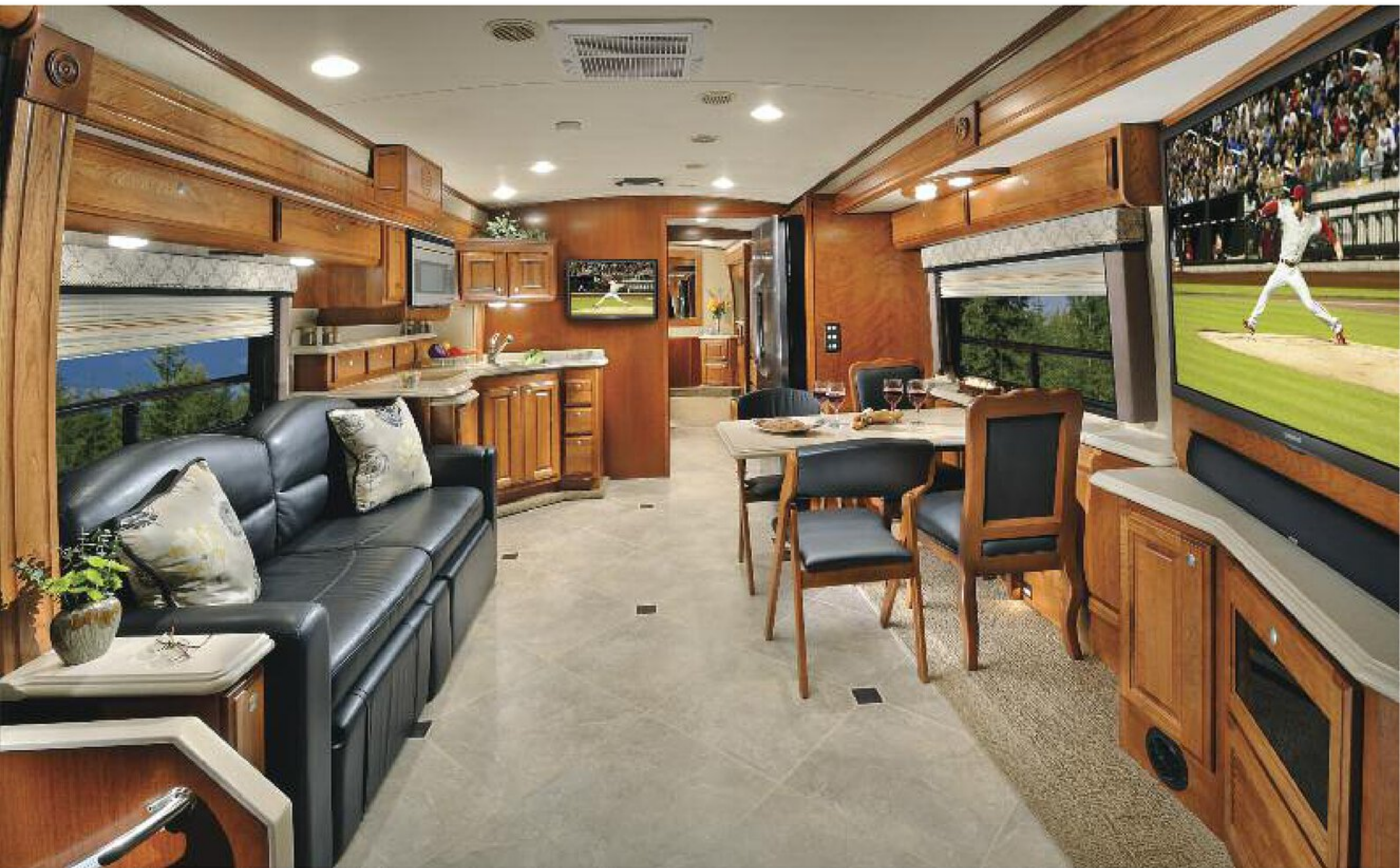
DynaQuest XL - This Model 390 features a triple slide out. The 27' full wall slide out on the roadside of the coach helps create an incredibly spacious living, kitchen and dining area. Style details include: a diagonal ceramic tile floor, expandable Corian® dinette table with two free-standing cherry hardwood dinette chairs and two easy to stow cherry hardwood folding chairs. The kitchen has Corian® countertops, a two-burner stove top, an over the range convection/microwave oven and a stainless steel residential refrigerator. Shown with optional 26' LED/LCD TV.