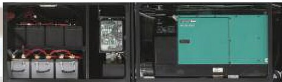
Easy access battery bank, leveling system controls and generator