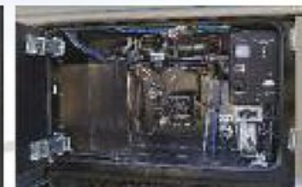
Easy access water bay and 50 amp power land line