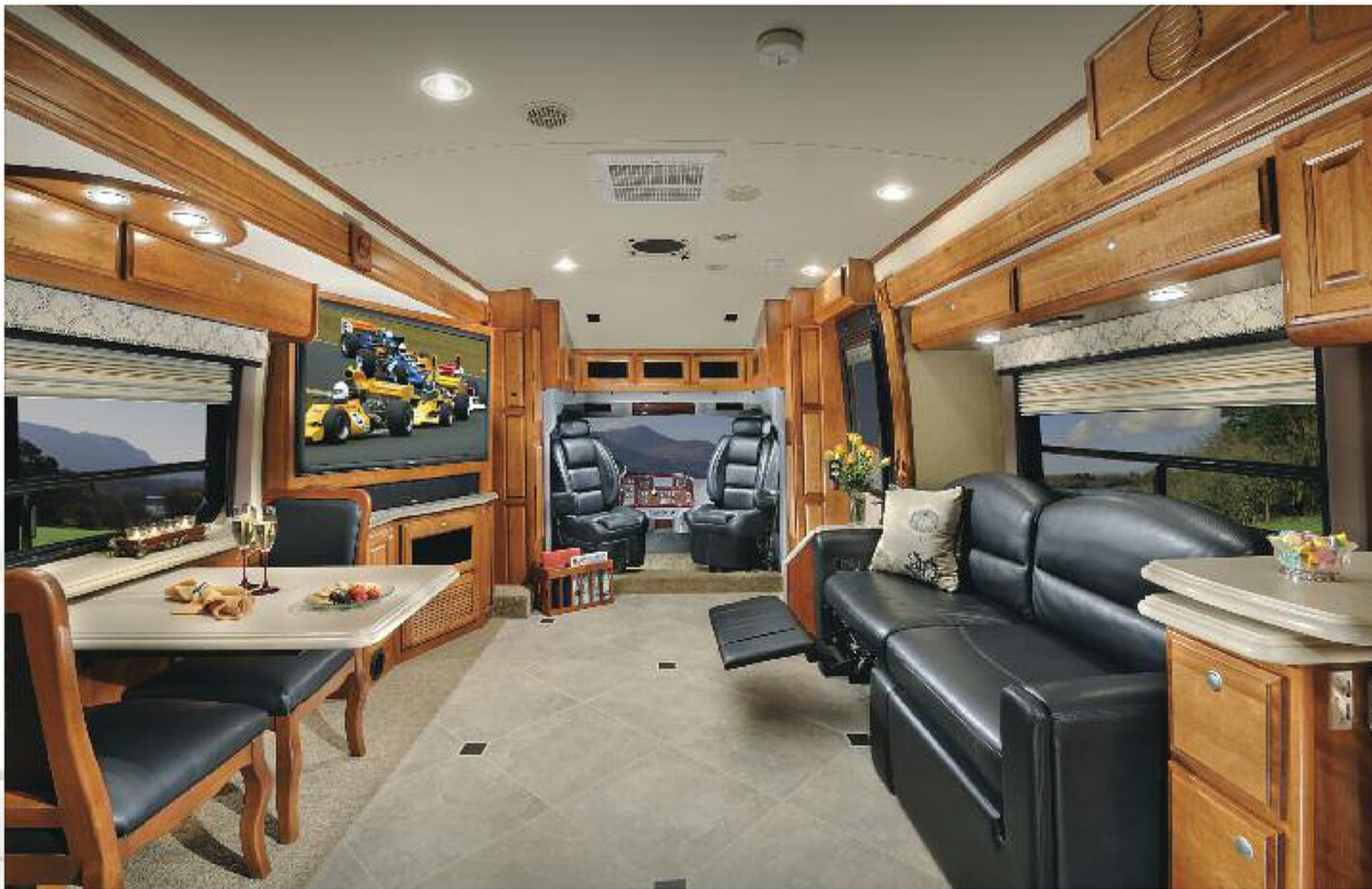
Driver and passenger ultra leather captain's chairs swivel to enlarge living room seating area. The entertainment center has a 55" LED/LCD TV, Blu-Ray DVD player, AM/FM receiver and a sound bar with a powered subwoofer, all standard in the DynaQuest XL Model 390, shown in Alabaster with Stained Cherry hardwoods.