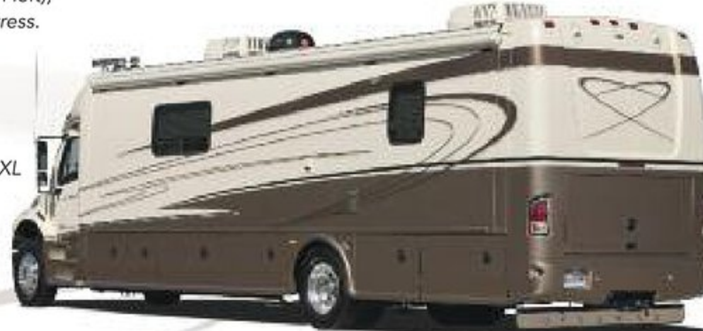
DynaQuest XL Model 390

DynaQuest XL is standard equipped with LED tail lights, eight docking lights and a stainless steel stone guard on rear. (Ivory paint scheme)