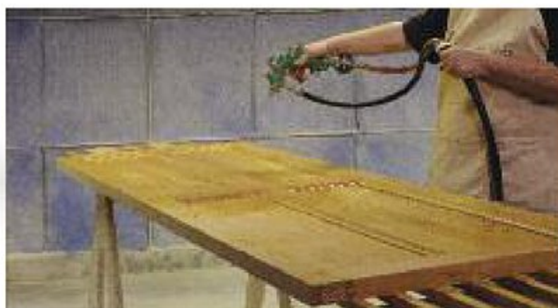
Clear coated natural hardwood doors bring out the luster