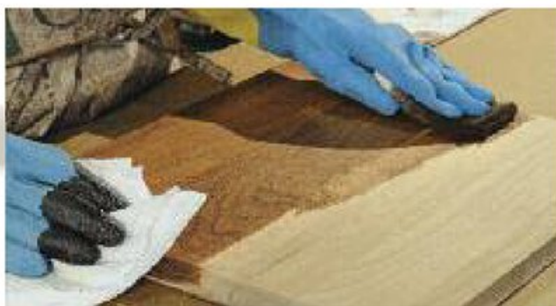
Hand rubbed finishes optimize grain definition