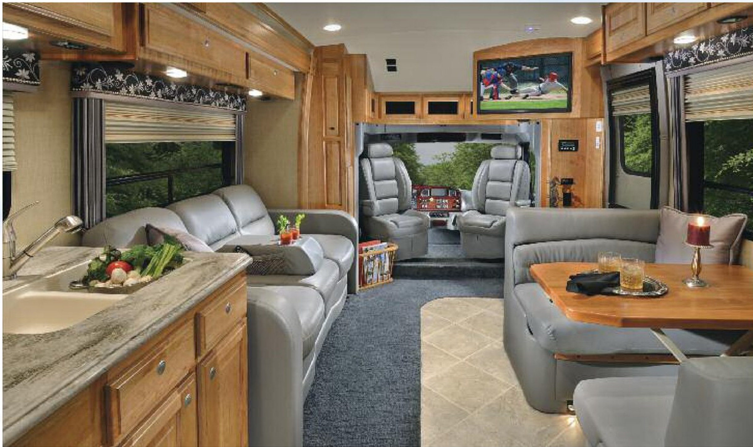
DynaQuest XL Model 360 living area, shown in Natural Cherry with our cool, classic Slate Gray decor. High end amenities include a 32" LED/LCD TV, Blu-Ray DVD player, ultra leather hide-a-bed sofa with air mattress, captains chairs and a dream dinette.