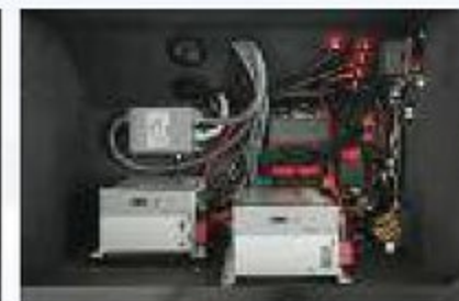
Deutsch heavy-duty, water-tight, bulk connectors with two 3,000 watt power inverters shown