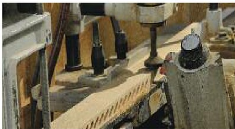
Custom louvered doors