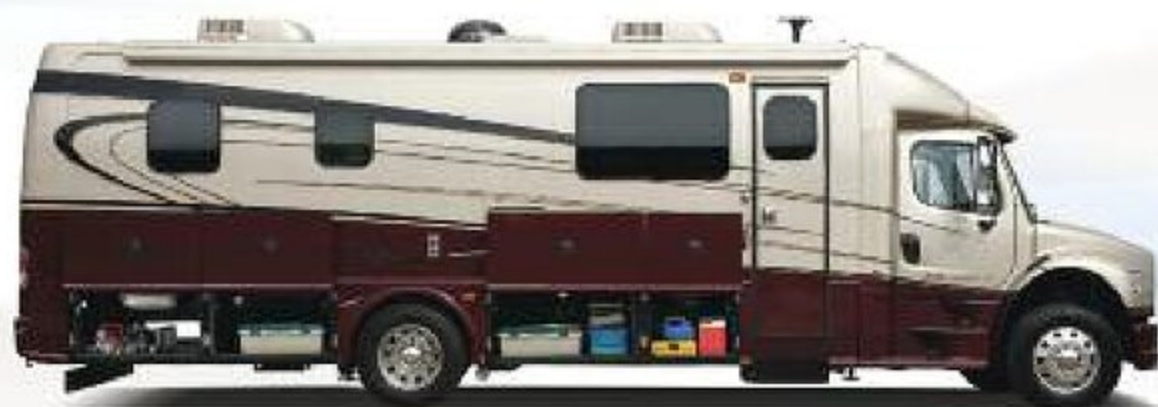
DynaQuest XL Model 340 has four large exterior storage compartments on the curb side of the coach with a rear pass through compartment. Powder coating inside and out, inhibits exterior storage compartment corrosion.