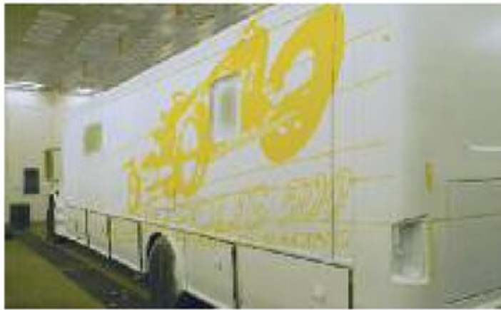
Digitally plotted, spray mask is carefully applied

Making a big statement is all in a day's work for Dynamax paint specialists. Virtually any logo, graphic or design can be digitally enlarged for precise masking and painting. This painstaking process is shown below with the 100th Anniversary Indianapolis 500, DynaQuest XL Special Edition. This prestigious 5-step paint process really shines with three coats of clear sanded and buffed, for a distinctively polished finish.