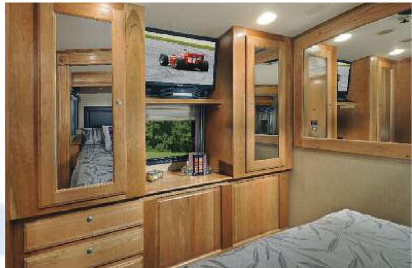
This spacious bedroom slide out includes a queen size bed with a Serta® mattress. Easy to access under bed storage provides plenty of room for extra gear. The bedroom dresser includes two shirt closets, and a 32" LED/LCD TV. Shown with optional Bose® integrated sound system in Slate Gray decor.