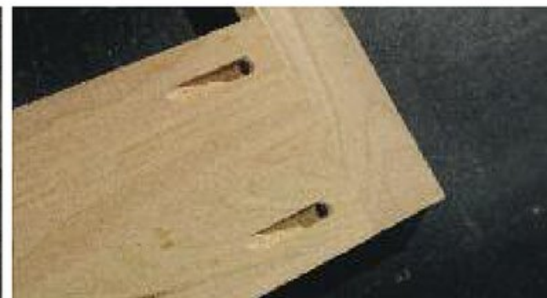
Pocket screws for structural integrity