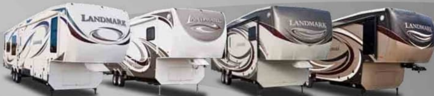
Vinyl Graphics Standard