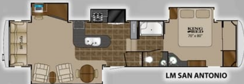
LM SAN ANTONIO

Length: 40' 11" Dry: 13,488 GVWR: 16,250 Hitch: 2,860 Height: 12' 11½"