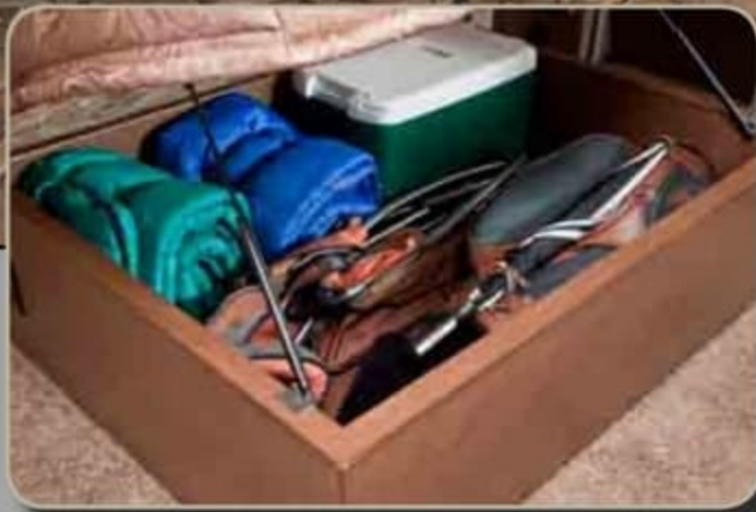
Massive, 18 Cubic Foot, finished Under Bed Storage with gas strut lifters for easy access.