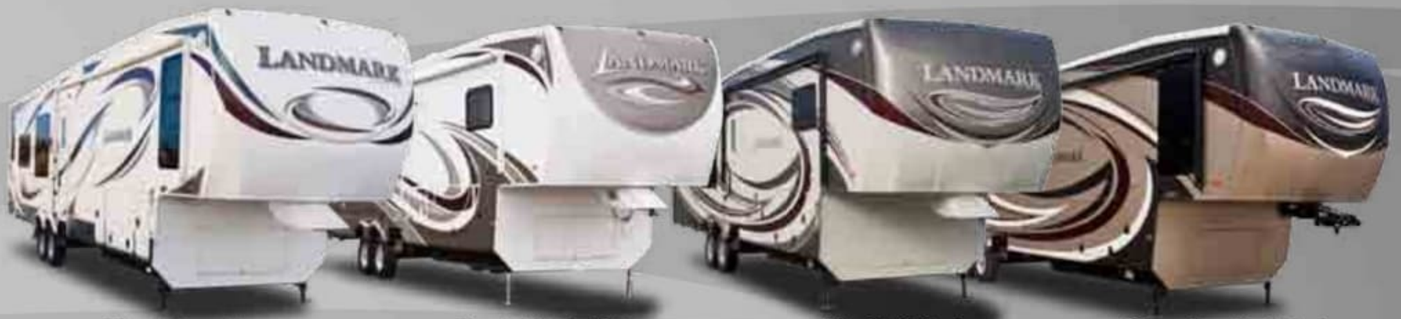
Vinyl Graphics Standard