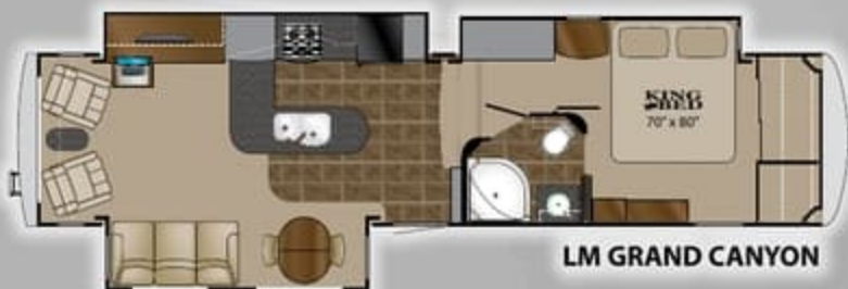
LM GRAND CANYON

Length: 37' 7" Dry: 12,629 GVWR: 16,200 Hitch: 2,295 Height: 12' 11½"