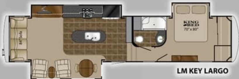
LM KEY LARGO

Length: 40' 6" Dry: 12,972 GVWR: 16,250 Hitch: 2,460 Height: 12' 11½"