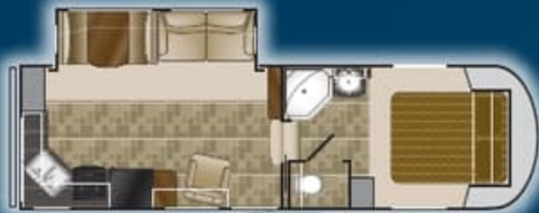
SD XLT 265RK

Length: 31' 7" Dry: 7,580 GVWR: 9,900 Height: 11' 10" Hitch: 1,420 Tanks: 53 F 80 G 40 B