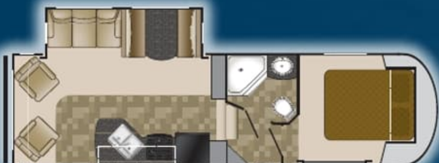
SD XLT 277 RL

Length: 31' 3" Dry: 7,620 GVWR: 9,900 Height: 11' 10" Hitch: 1,690 Tanks: 53 F 80 G 40 B