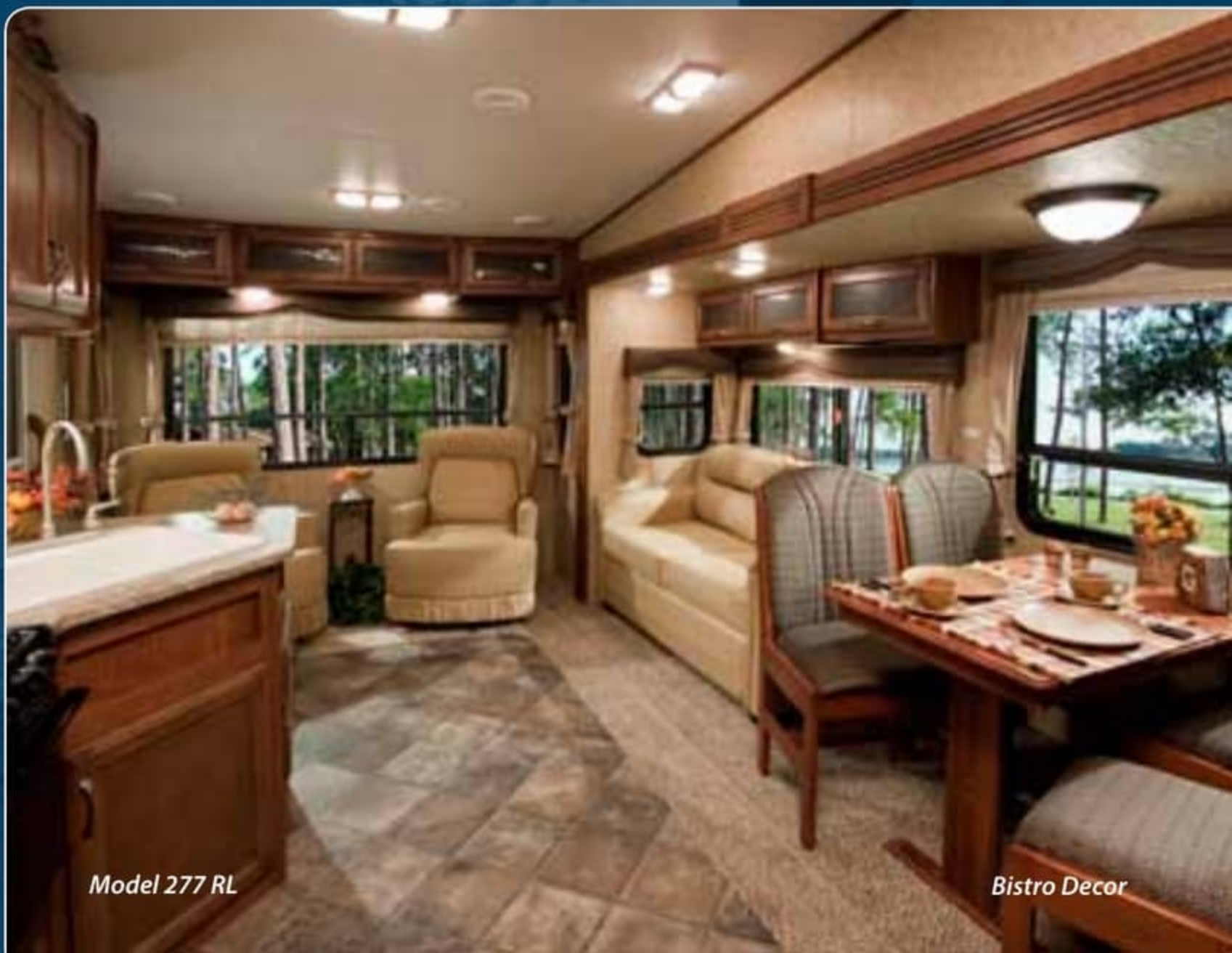
Model 277 RL