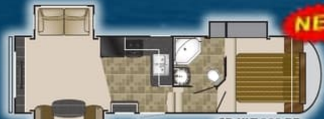
SD XLT 293 RE

Length: 29' 10" Dry: 7,466 GVWR: 9,900 Height: 11' 10" Hitch: 1,625 Tanks: 53 F 40 G 40 B