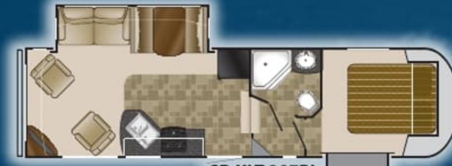
SD XLT 287RL

Length: 28' 5" Dry: 6,970 GVWR: 9,900 Height: 11' 10" Hitch: 1,270 Tanks: 53 F 80 G 40 B