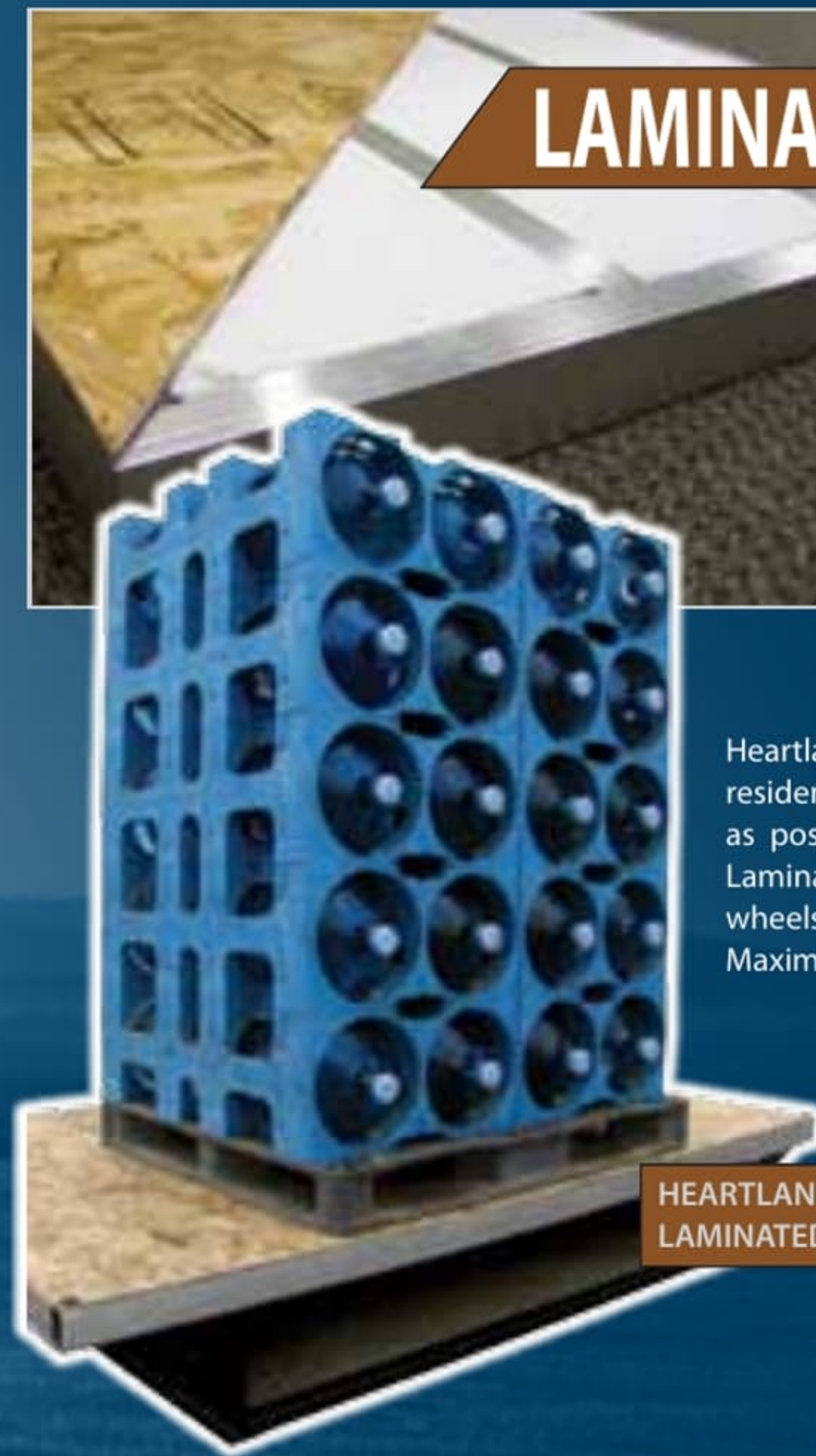
HEARTLAND'S LAMINATED FLOOR

Heartland builds recreational vehicles with as many residential features and construction methods as possible and we are excited to introduce this Laminated Floor System in our mid-profile fifth wheels. Choose Heartland for Maximum Strength; Maximum Insulation Value; and Minimal Flex!!