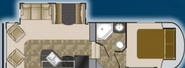
SD XLT 277 RL

Length: 31' 3" Dry: 7,620 GVWR: 9,900 Height: 11' 10" Hitch: 1,690 Tanks: 53 F 80 G 40 B