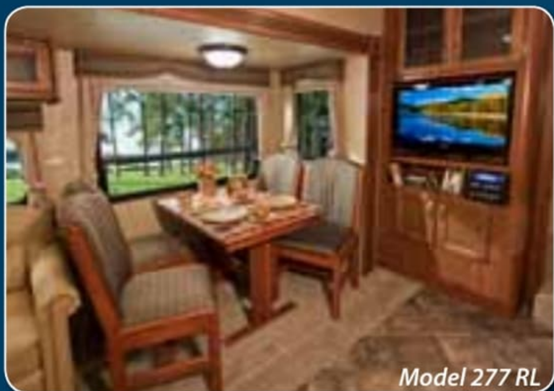
Model 277 RL