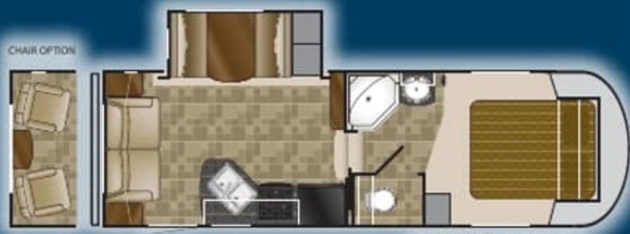
SD XLT 245 RL

Length: 26' 4" Dry: 6,610 GVWR: 9,900 Height: 11' 10" Hitch: 1,135 Tanks: 53 F 40 G 40 B