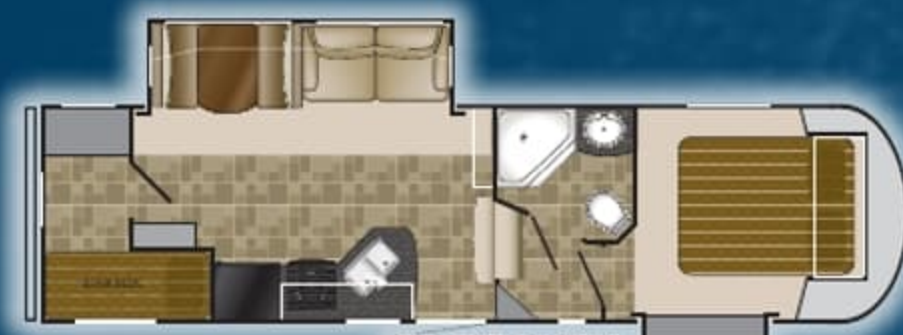
SD XLT 285BH

Length: 26' 4" Dry: 6,610 GVWR: 9,900 Height: 11' 10" Hitch: 1,135 Tanks: 53 F 40 G 40 B