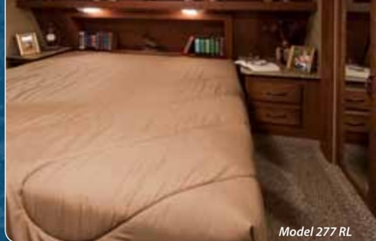
Model 277 RL

Whether you are looking for a 1/2 ton towable or are just tired of hauling around and maintaining a larger luxury unit, SUNDANCE XLT answers the call by providing you the luxury amenities of our top selling SUNDANCE in a smaller, lighter, easily manageable, fully laminated, fifth wheel. From single slide couples coaches to triple slide units, SUNDANCE XLT provides multiple possibilities to meet your exact camping and travel needs.