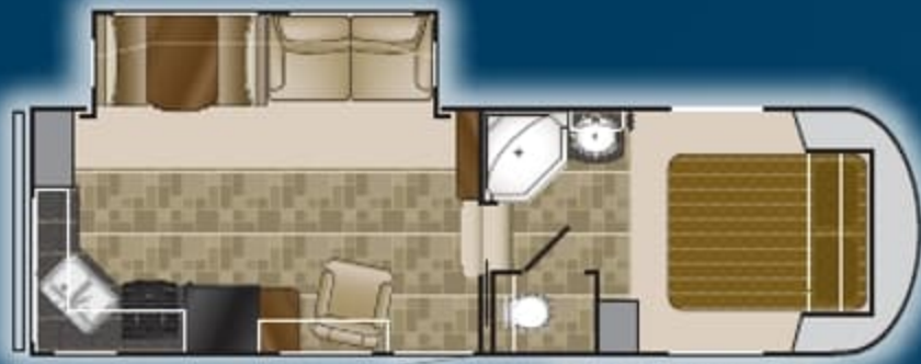
SD XLT 265RK

Length: 31' 7" Dry: 7,580 GVWR: 9,900 Height: 11' 10" Hitch: 1,420 Tanks: 53 F 80 G 40 B