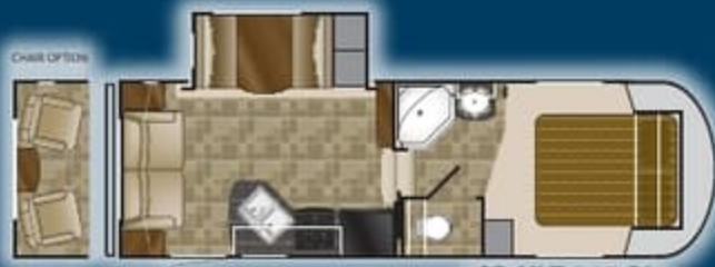
SD XLT 245 RL

Length: 26' 4" Dry: 6,610 GVWR: 9,900 Height: 11' 10" Hitch: 1,135 Tanks: 53 F 40 G 40 B