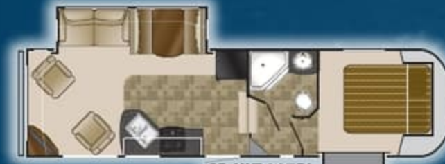
SD XLT 287RL

Length: 28' 5" Dry: 6,970 GVWR: 9,900 Height: 11' 10" Hitch: 1,270 Tanks: 53 F 80 G 40 B