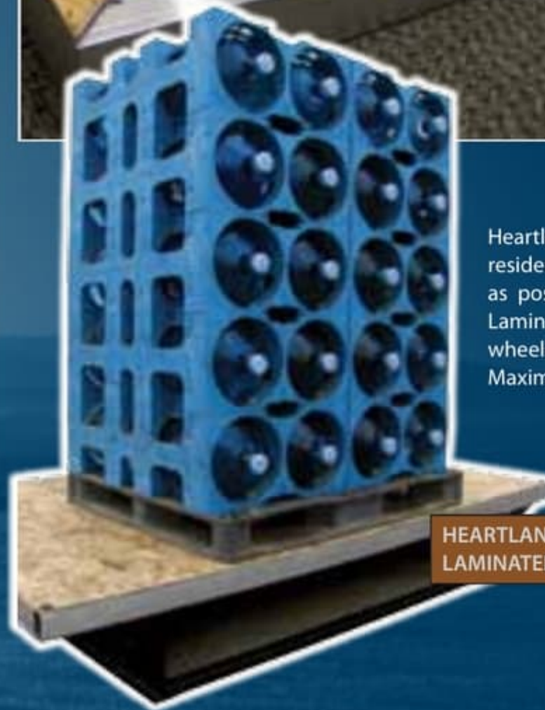
HEARTLAND's LAMINATED FLOOR

Heartland builds recreational vehicles with as many residential features and construction methods as possible and we are excited to introduce this Laminated Floor System in our mid-profile fifth wheels. Choose Heartland for Maximum Strength; Maximum Insulation Value; and Minimal Flex!!