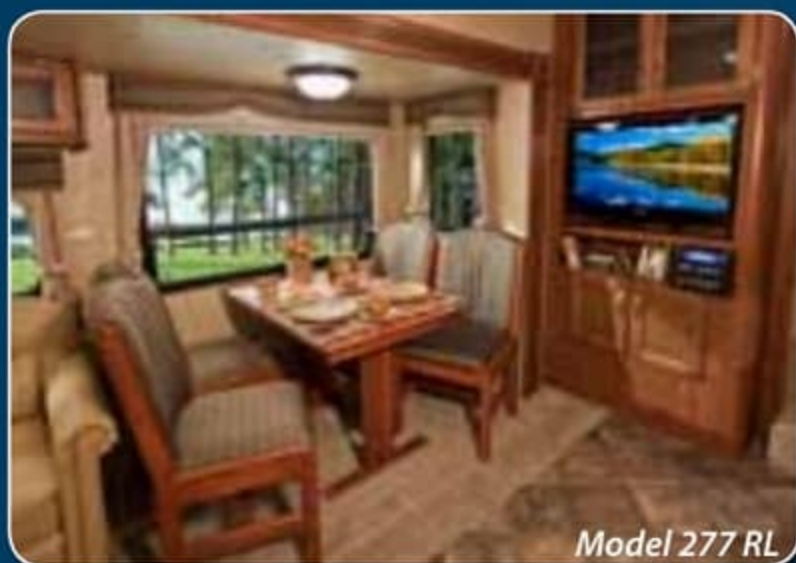
Model 277 RL