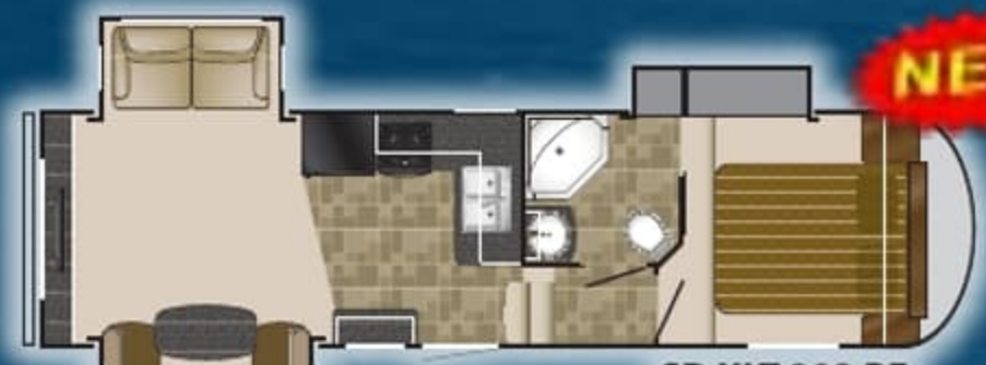
SD XLT 293 RE

Length: 29' 10" Dry: 7,466 GVWR: 9,900 Height: 11' 10" Hitch: 1,625 Tanks: 53 F 40 G 40 B