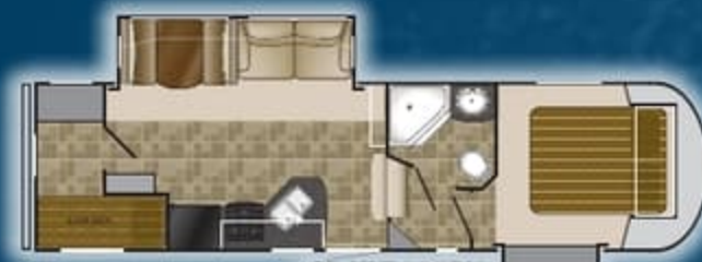
SD XLT 285BH

Length: 26' 4" Dry: 6,610 GVWR: 9,900 Height: 11' 10" Hitch: 1,135 Tanks: 53 F 40 G 40 B