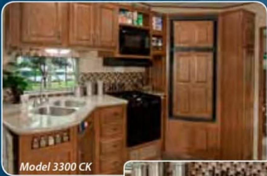
Model 3300 CK