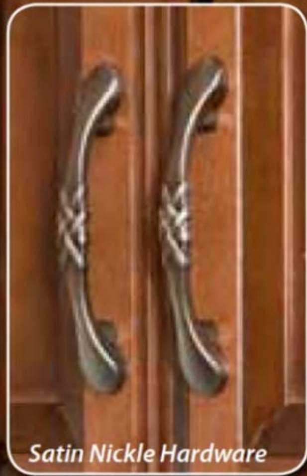
Satin Nickel Hardware