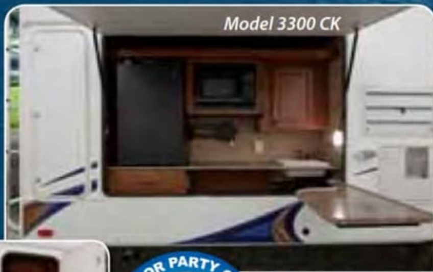
Model 3300 CK