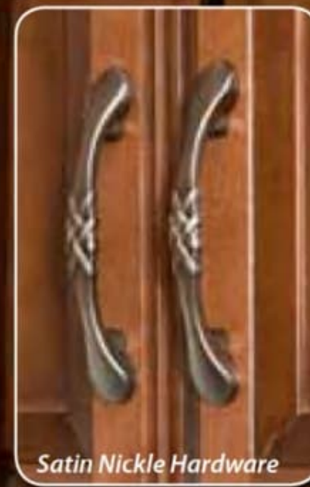
Satin Nickle Hardware