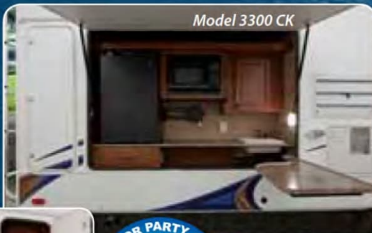
Model 3300 CK