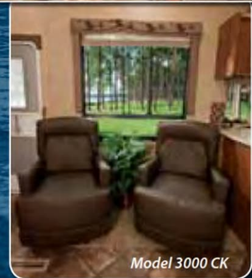
Model 3000 CK