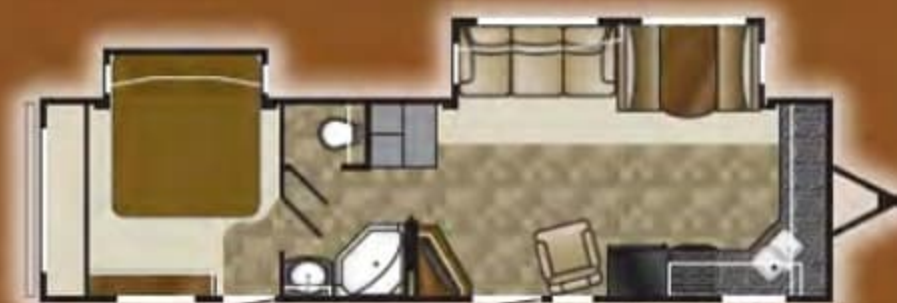
SD TT 3200FK

Length: 35' 6" Dry: 8,495 GVWR: 11,345 Height: 11' 5" Hitch: 1,185 Tanks: 47 F 40 G 40 B