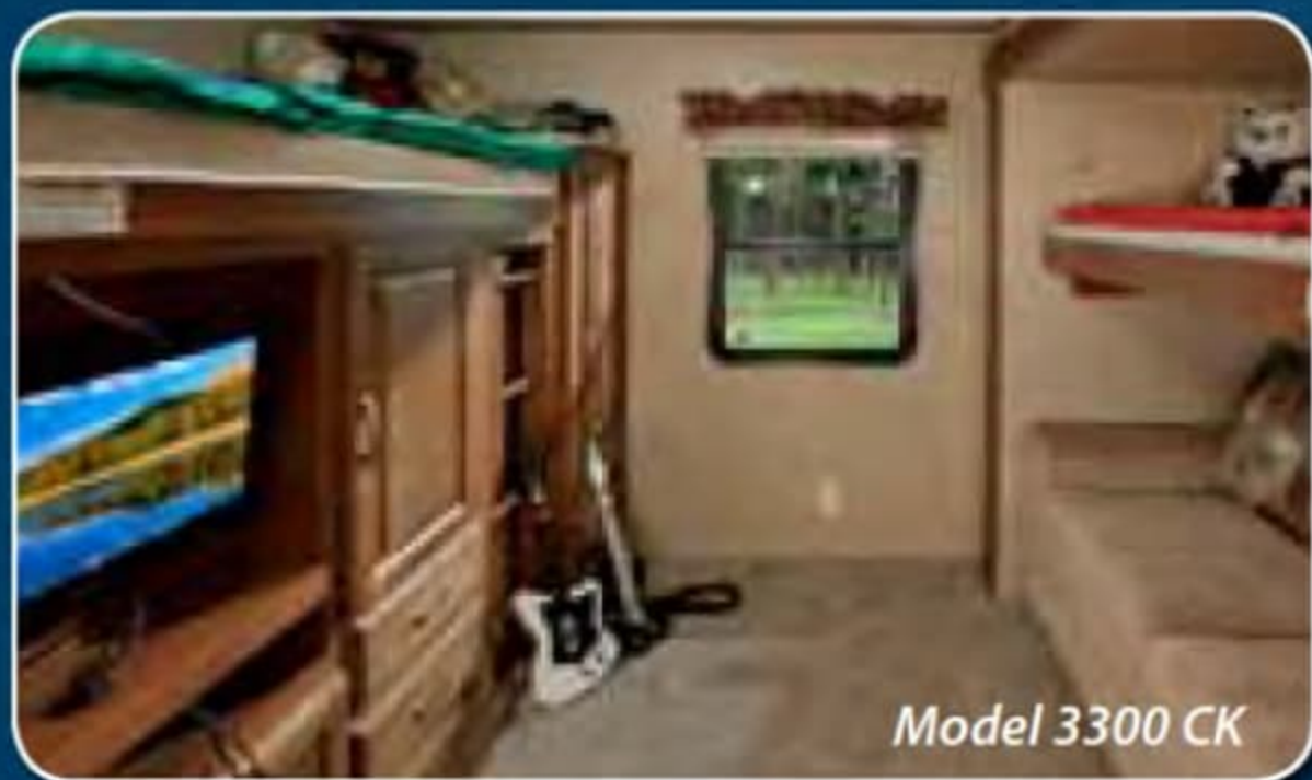
Model 3300 CK