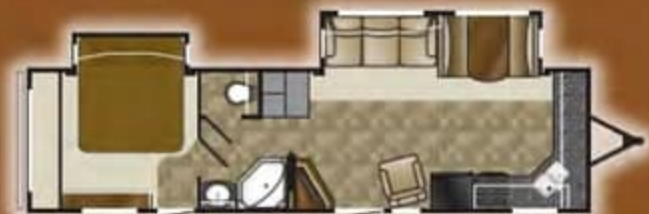
SD TT 3200FK

Length: 35' 6" Height: 11' 5" Dry: 8,495 Hitch: 1,185 GVWR: 11,345 Tanks: 47 F 40 G 40 B