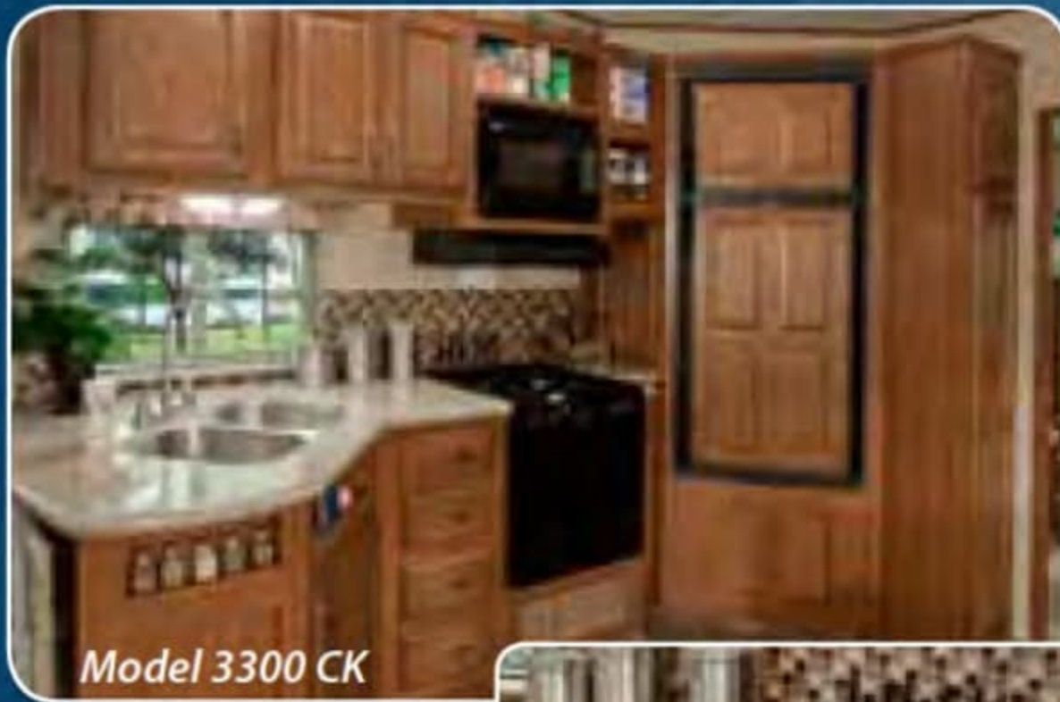
Model 3300 CK