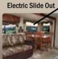
Electric Slide Out