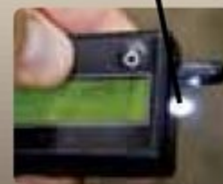
High Emittance LED Flashlight