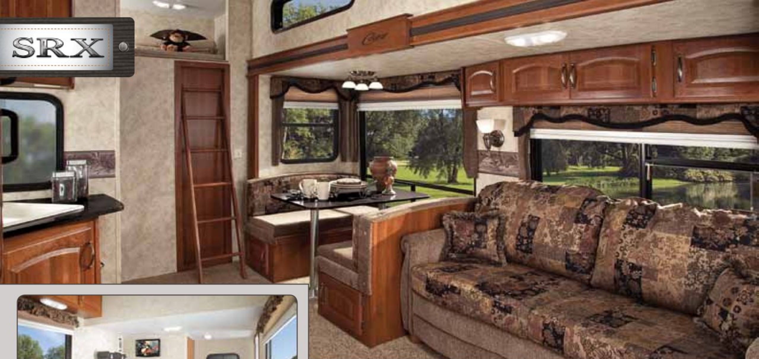
325SRX LIVING AREA (SHOWN IN AUTUMN NIGHT DECOR)