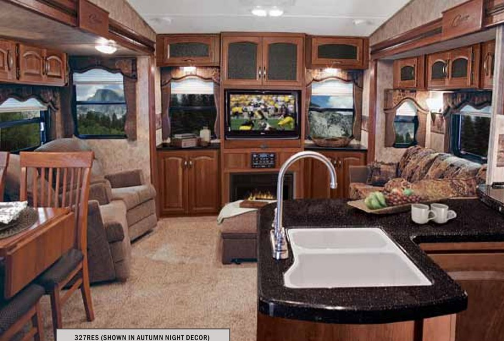
327RES (SHOWN IN AUTUMN NIGHT DECOR)