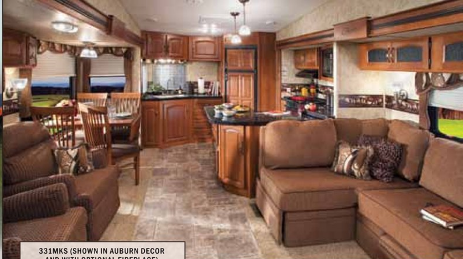
331MKS (SHOWN IN AUBURN DECOR AND WITH OPTIONAL FIREPLACE)

IT IS OUR GOAL TO GIVE EVERY COUGAR A RESIDENTIAL LOOK AND FEEL WITH ADDED FEATURES THAT YOU AND YOUR FAMILY WILL APPRECIATE.