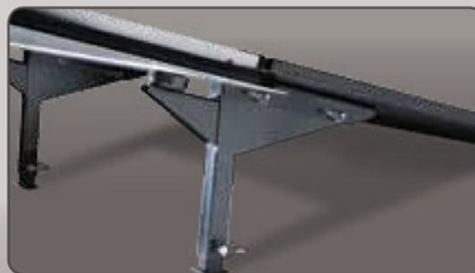
ADJUSTABLE RAMP LEGS

Part of what has made Cougar such a success over the years is our ability to incorporate customers wants and needs into a variety of floorplans. The Cougar 325SRX combines a garage model fifth wheel with a residential main living area. This creates the perfect unit for a variety of hobbies.