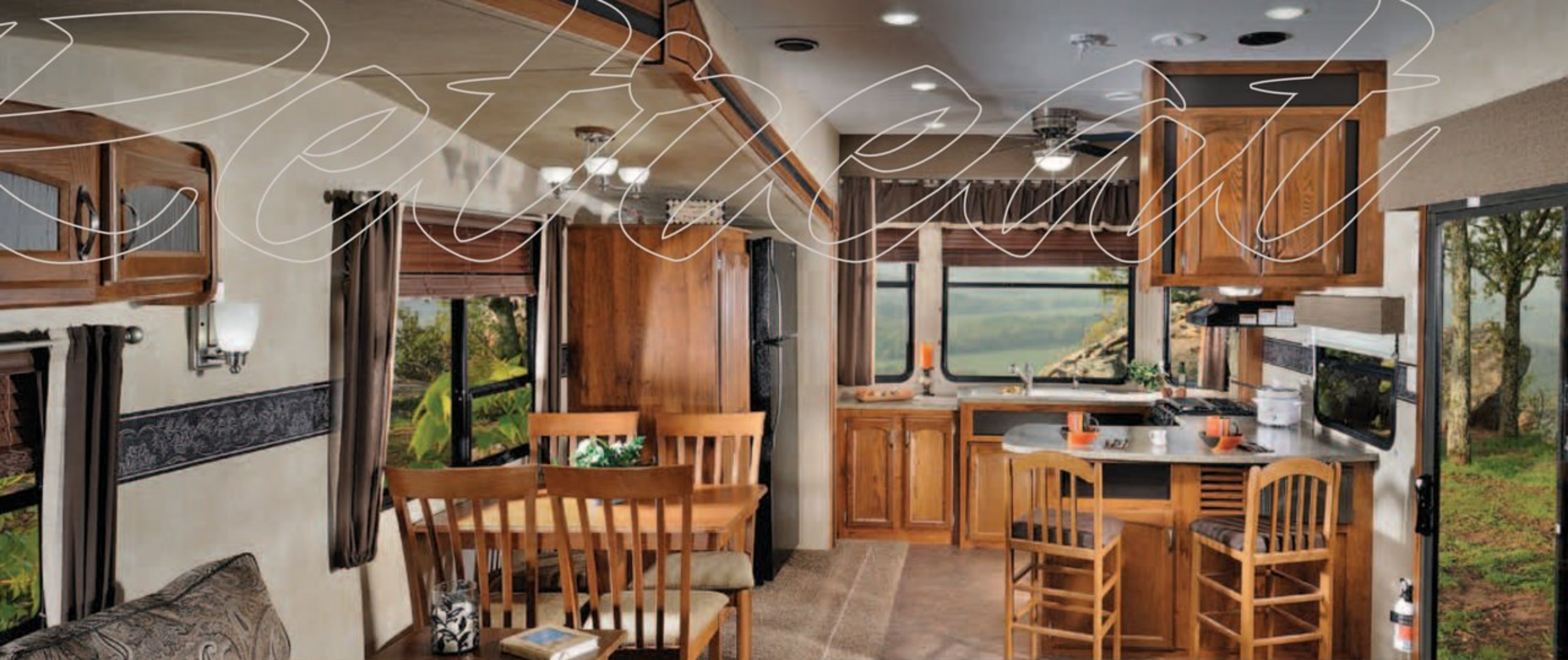
THE 39KBTS SHOWN BELOW IN MAPLECREST DECOR

The 39FKSS, shown in Saddlebrook decor is designed for your next escape. A comfortable living area with all the amenities you need for any destination. The exclusive cathedral slide out on the Retreat makes this trailer fun for the whole family to enjoy.