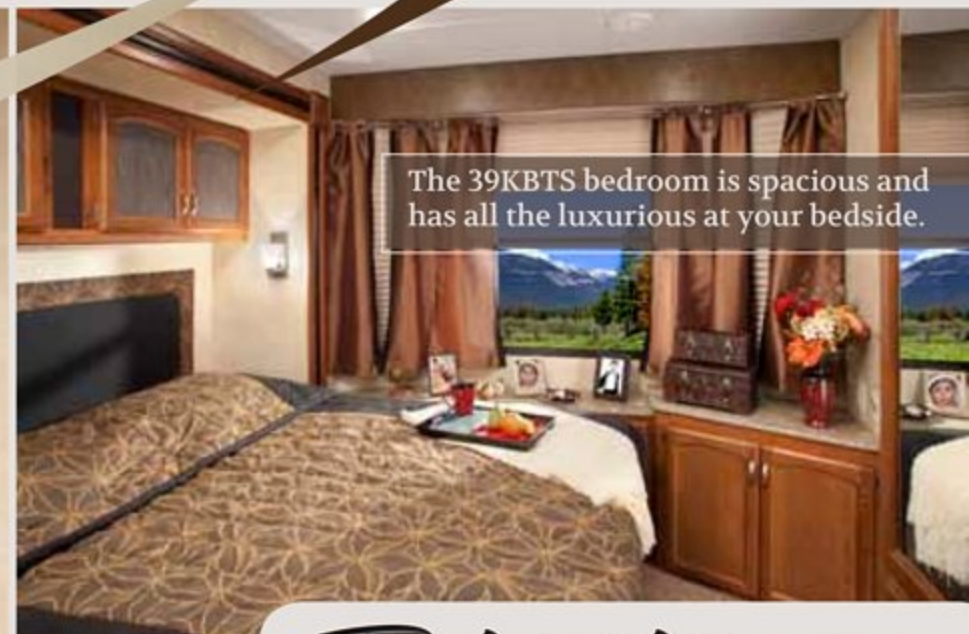
The 39KBTS bedroom is spacious and has all the luxuries at your bedside.