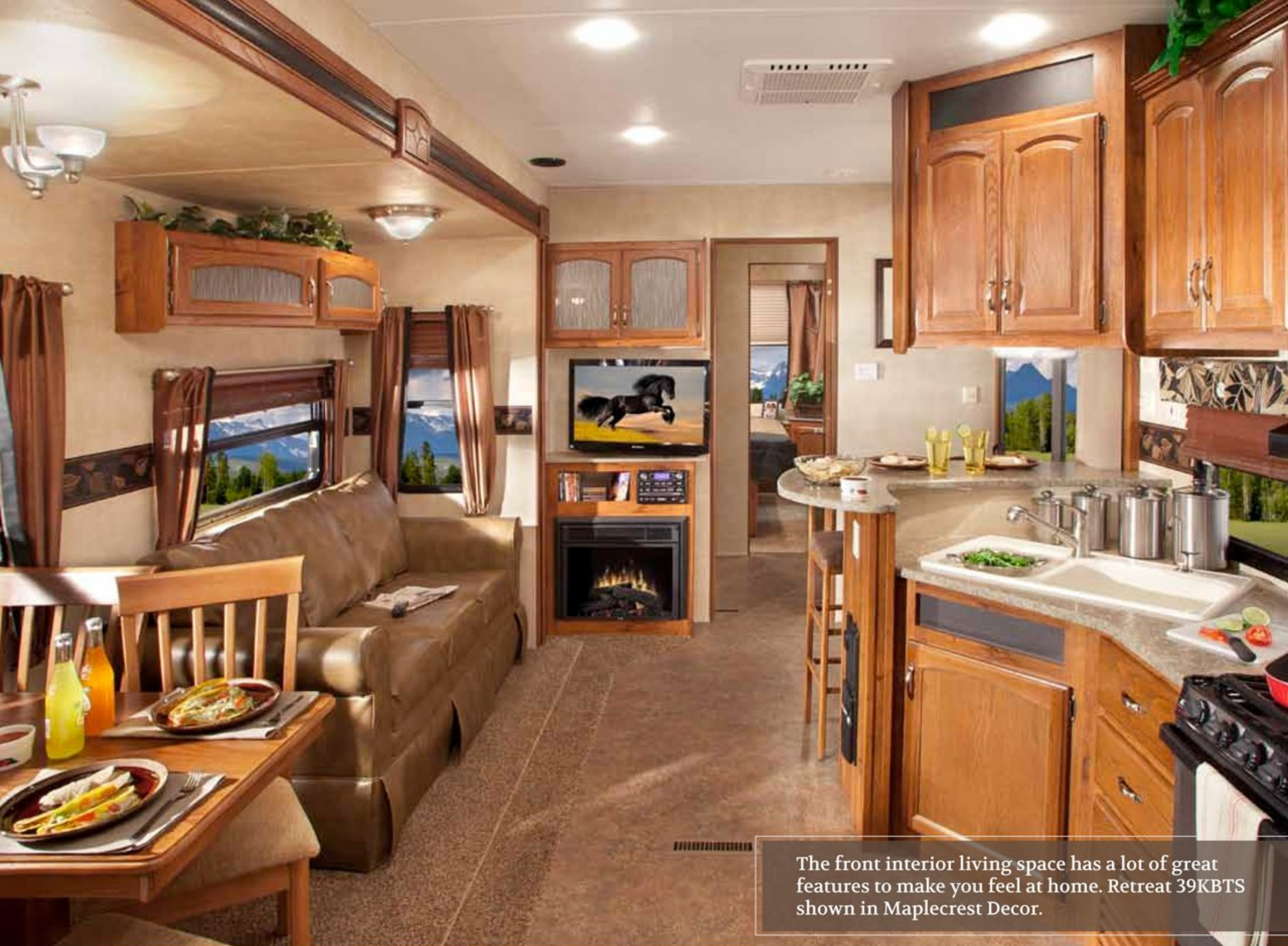
The front interior living space has a lot of great features to make you feel at home. Retreat 39KBTS shown in Maplecrest Decor.