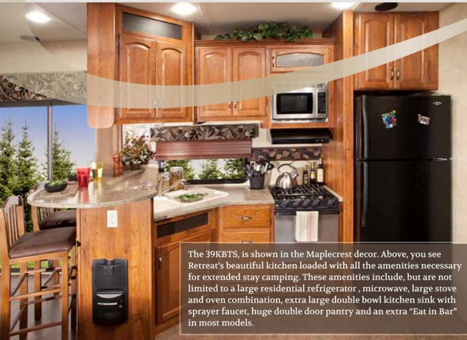
The 39KBTS, is shown in the Maplecrest decor. Above, you see Retreat's beautiful kitchen loaded with all the amenities necessary for extended stay camping. These amenities include, but are not limited to a large residential refrigerator, microwave, large stove and oven combination, extra large double bowl kitchen sink with sprayer faucet, huge double door pantry and an extra "Eat in Bar" in most models.

America is your backyard in the Retreat destination trailer. Whether it's for a weekend or for weeks at a time, the comforts of our Retreat cannot be matched!