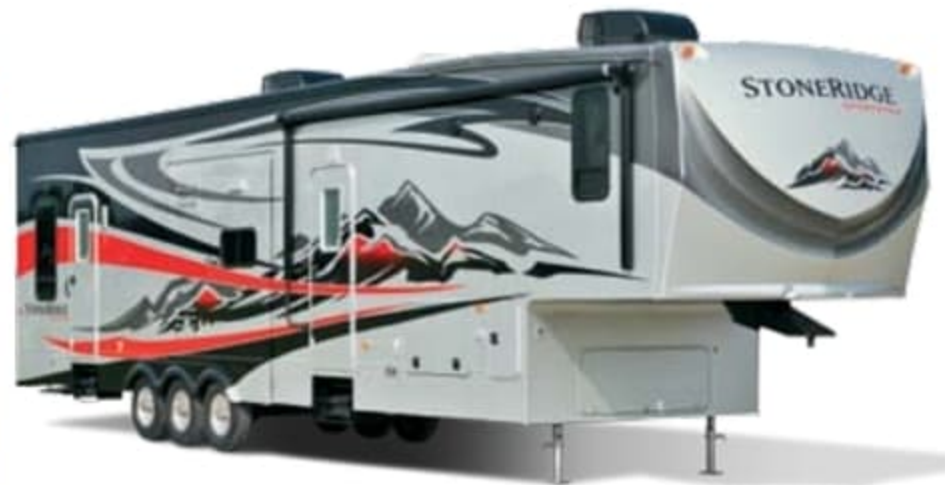
Above, 41CKS shown with optional full body paint.