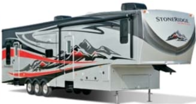
Above, 41CKS shown with optional full body paint.