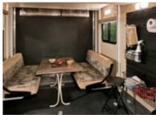
At left, the available sit-n-sleep power bed and 10' garage with available patio door.