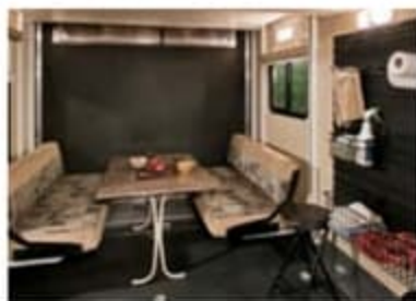
At left, the available sit-n-sleep power bed and 10' garage with available patio door.