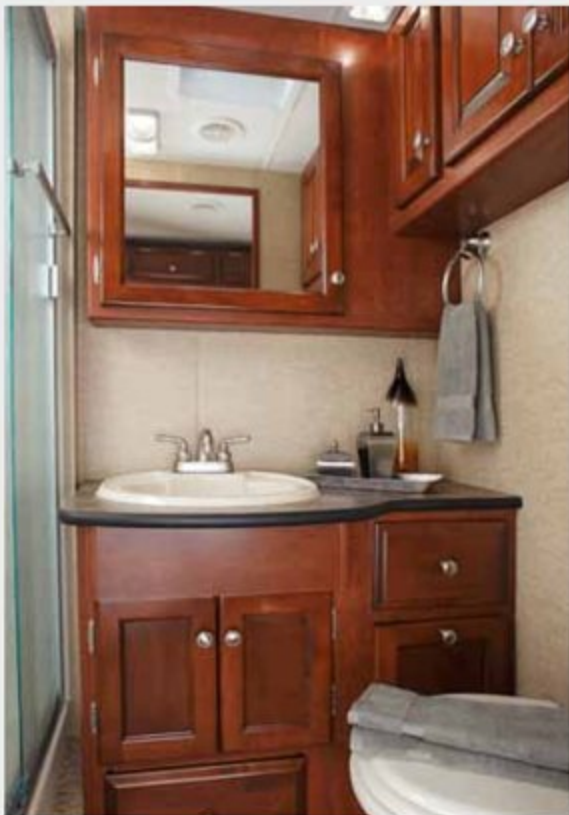
BATH & SHOWER