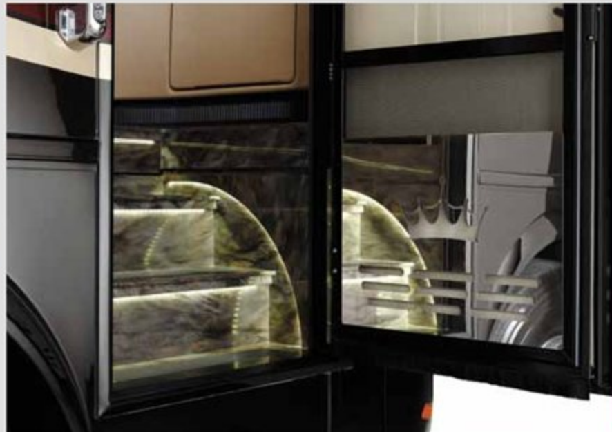
ENTRY WITH CHROME DETAIL