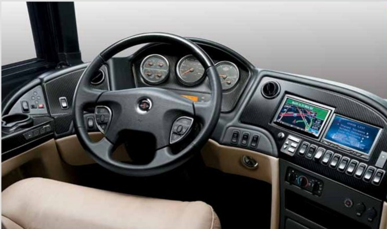
COMFORT DRIVE™ EQUIPPED