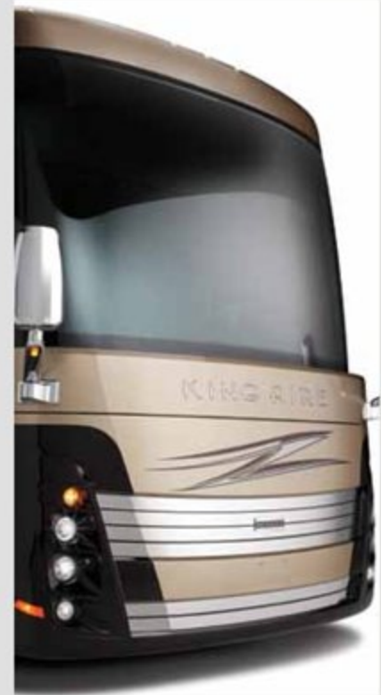
NEW FRONT GRILL