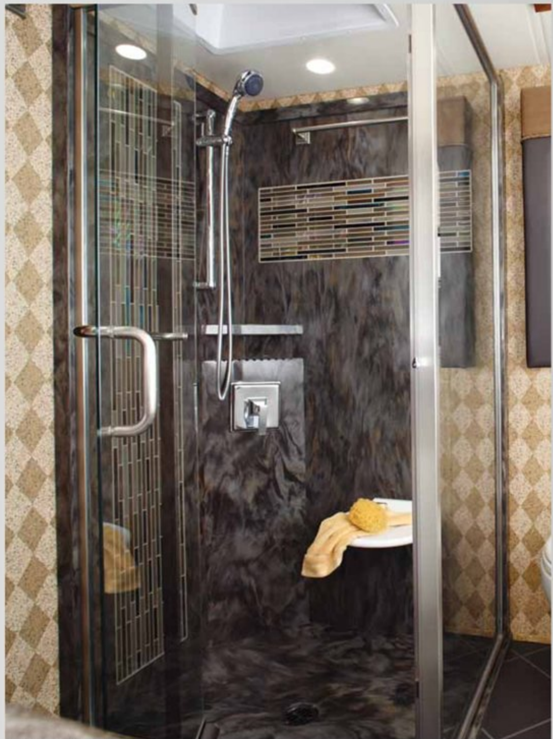
LARGEST SHOWER IN THE INDUSTRY

The new King Aire rear bathroom holds you in the lap of luxury with its 40" x 32" residential shower with designer glass tile inserts. A more roomy Ultra Leather® faced wardrobe and double sinks with a polished Corian® counter give both of you the pamper time you need.