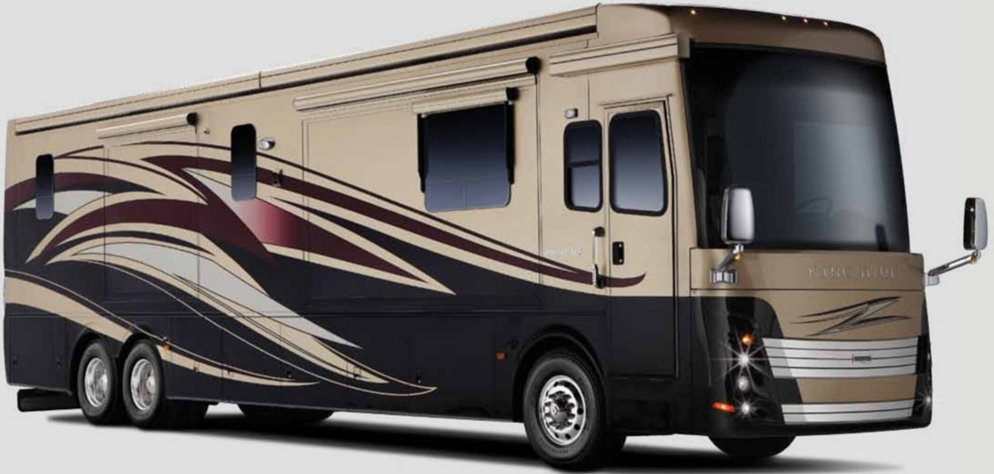
VENICE EXTERIOR PAINT