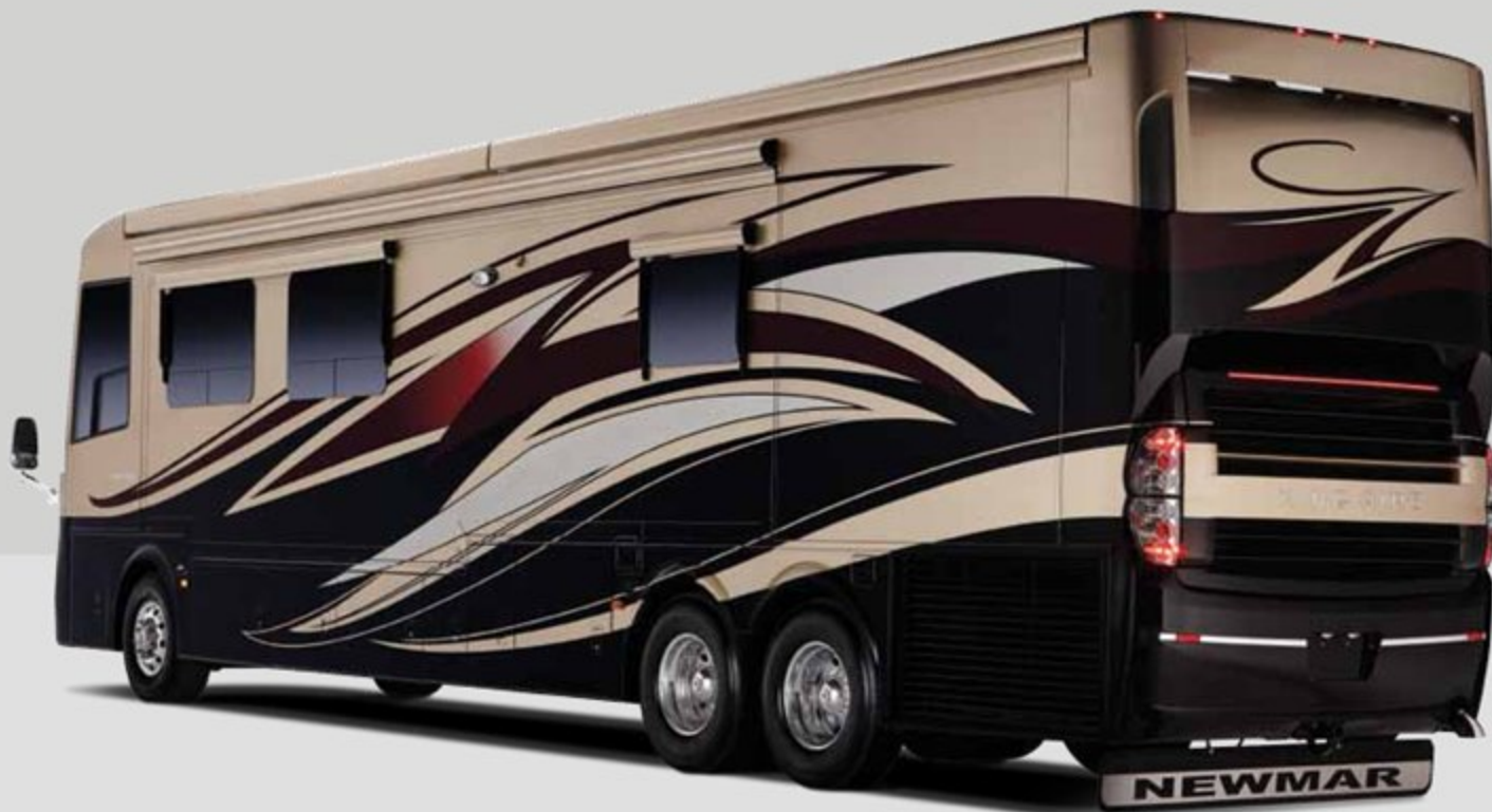
VENICE EXTERIOR PAINT

With its Full-Paint Masterpiece™ Finish and Super Clear Coat, you know it's a Newmar. The 2012 King Aire comes with four new exterior design choices and a stellar new chrome grill and headlight design.