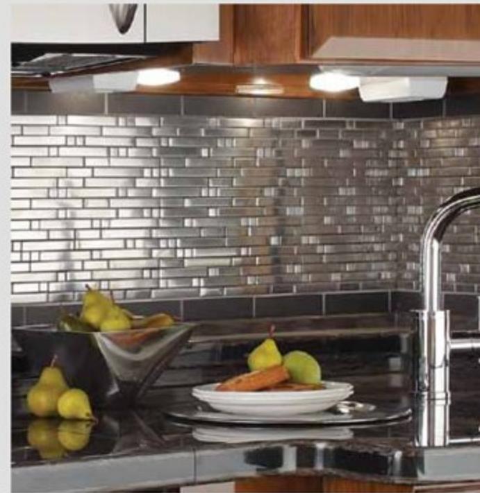
STYLISH SINK AND BACKSPASH