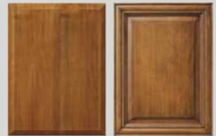
Ginger Glazed Cherry