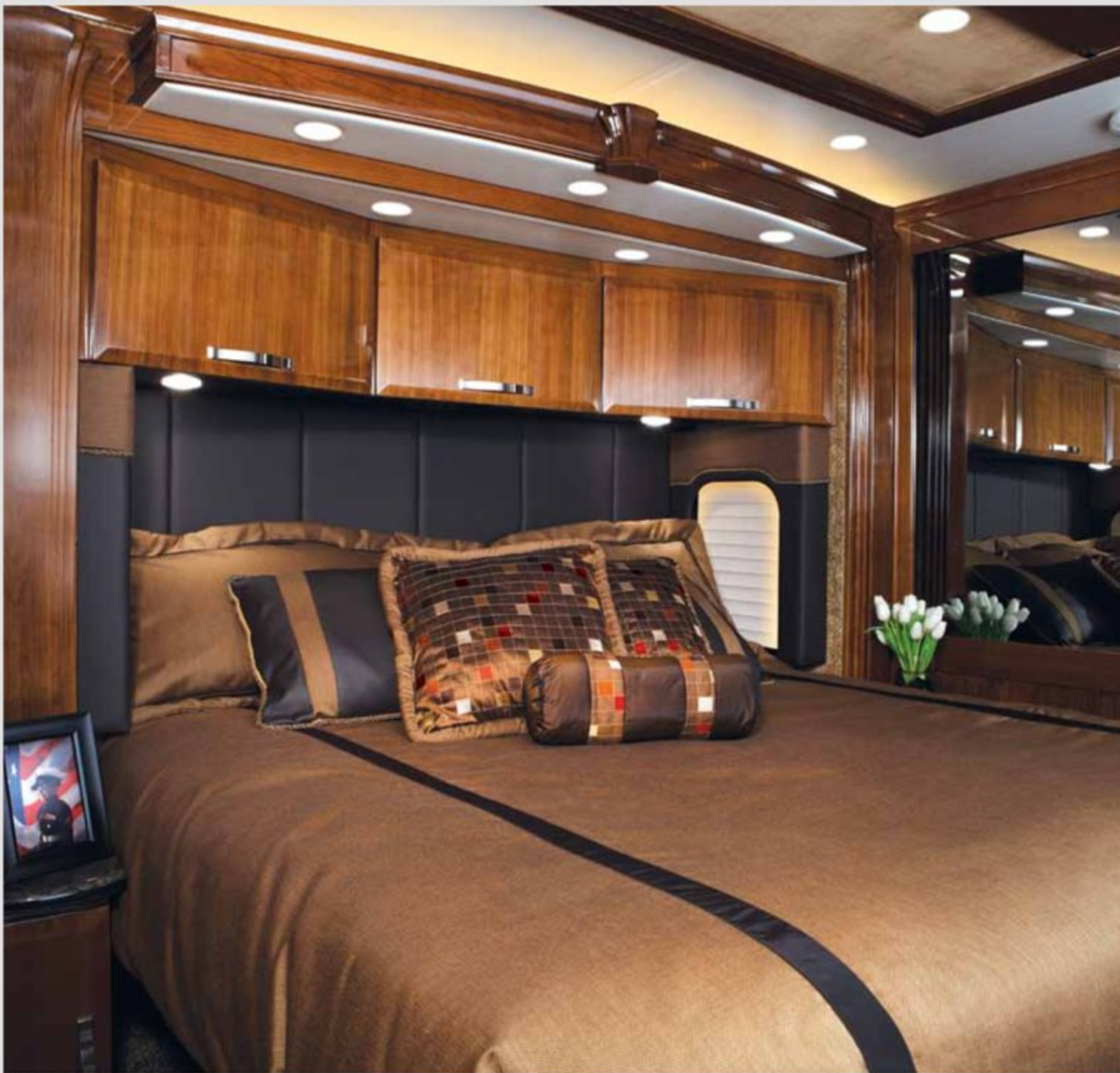
SLEEP NUMBER BED*