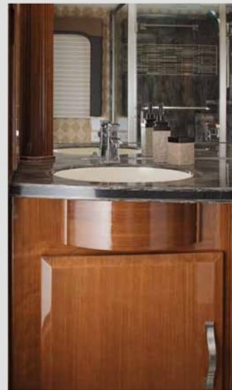
HIS & HER SINKS