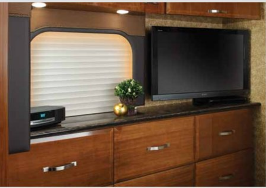
BOSE WAVE® & SONY FLATSCREEN