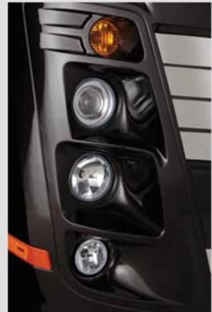
NEW HEADLIGHT ASSEMBLY