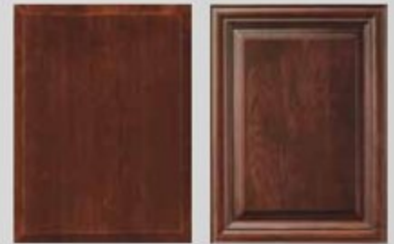
Soho Cherry - Standard