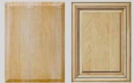
Rattan Glazed Maple