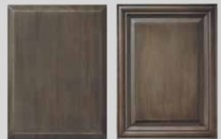
Suede Glazed Maple