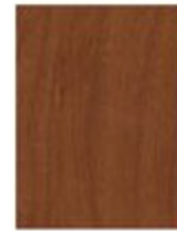
WASHINGTON GLAZED CHERRY