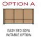
EASY BED SOFA w/ TABLE OPTION