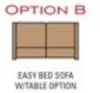
EASY BED SOFA w/ TABLE OPTION