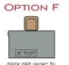
DESK OPT. w/ 26" TV