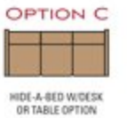
HIDE-A-BED w/ DESK OR TABLE OPTION