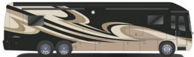
WHITE DIAMOND PEARL