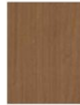
TUSCAN GLAZED MAPLE