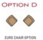
EURO CHAIR OPTION