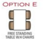
FREE STANDING TABLE w/ 4 CHAIRS