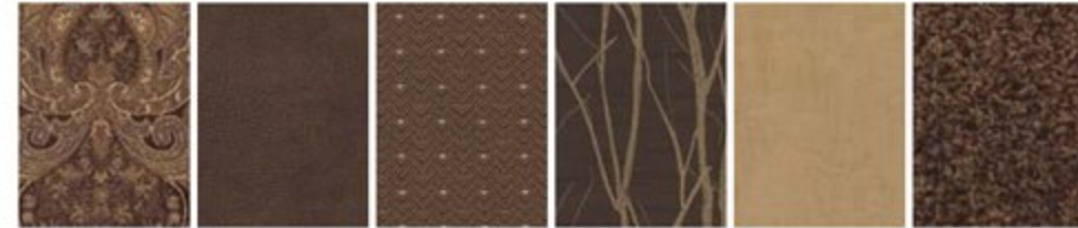
MAIN ULTRA-LEATHER SEATING COORDINATE BEDSPREAD ACCENT CARPET