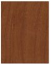
WASHINGTON GLAZED CHERRY