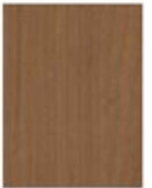
TUSCAN GLAZED MAPLE