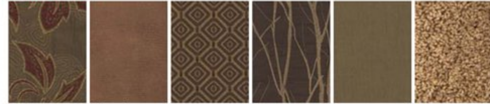
MAIN ULTRA-LEATHER SEATING COORDINATE BEDSPREAD ACCENT CARPET