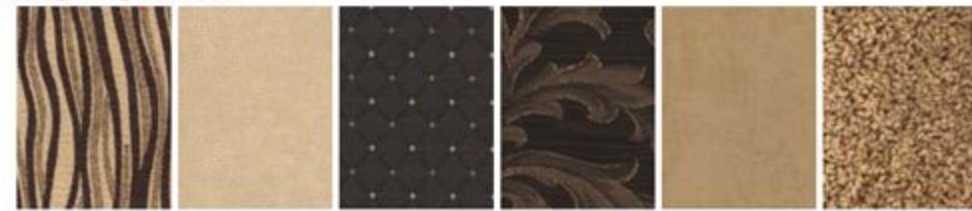
MAIN ULTRA-LEATHER SEATING COORDINATE BEDSPREAD ACCENT CARPET