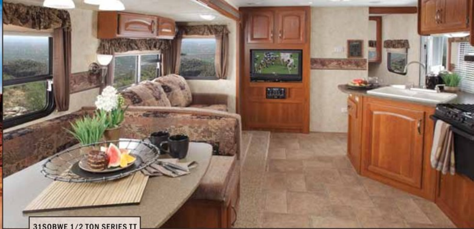
31SQBWE 1/2 TON SERIES TT