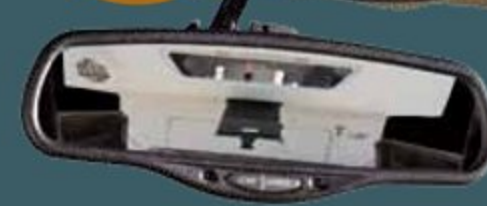
HITCH VISION DOCKING LIGHTS