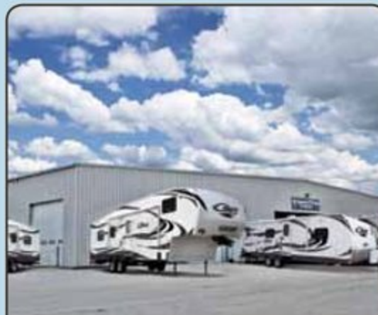
WEST COAST PRODUCTION

With its streamlined profile, radius corners, and enclosed underbelly, Cougar's aerodynamic exterior design substantially reduces air turbulence, increasing stability and mileage during travel.