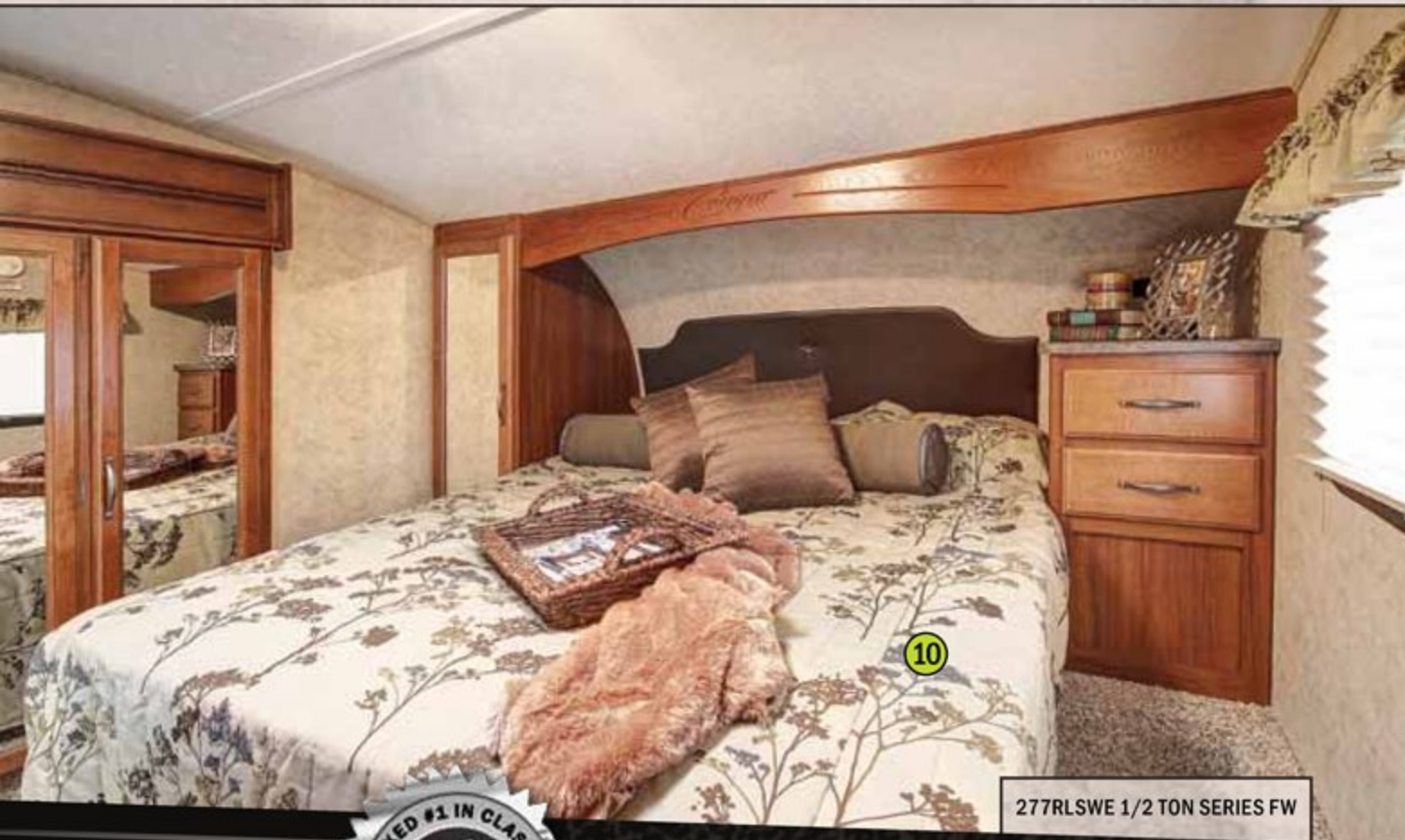
277RLSWE 1/2 TON SERIES FW