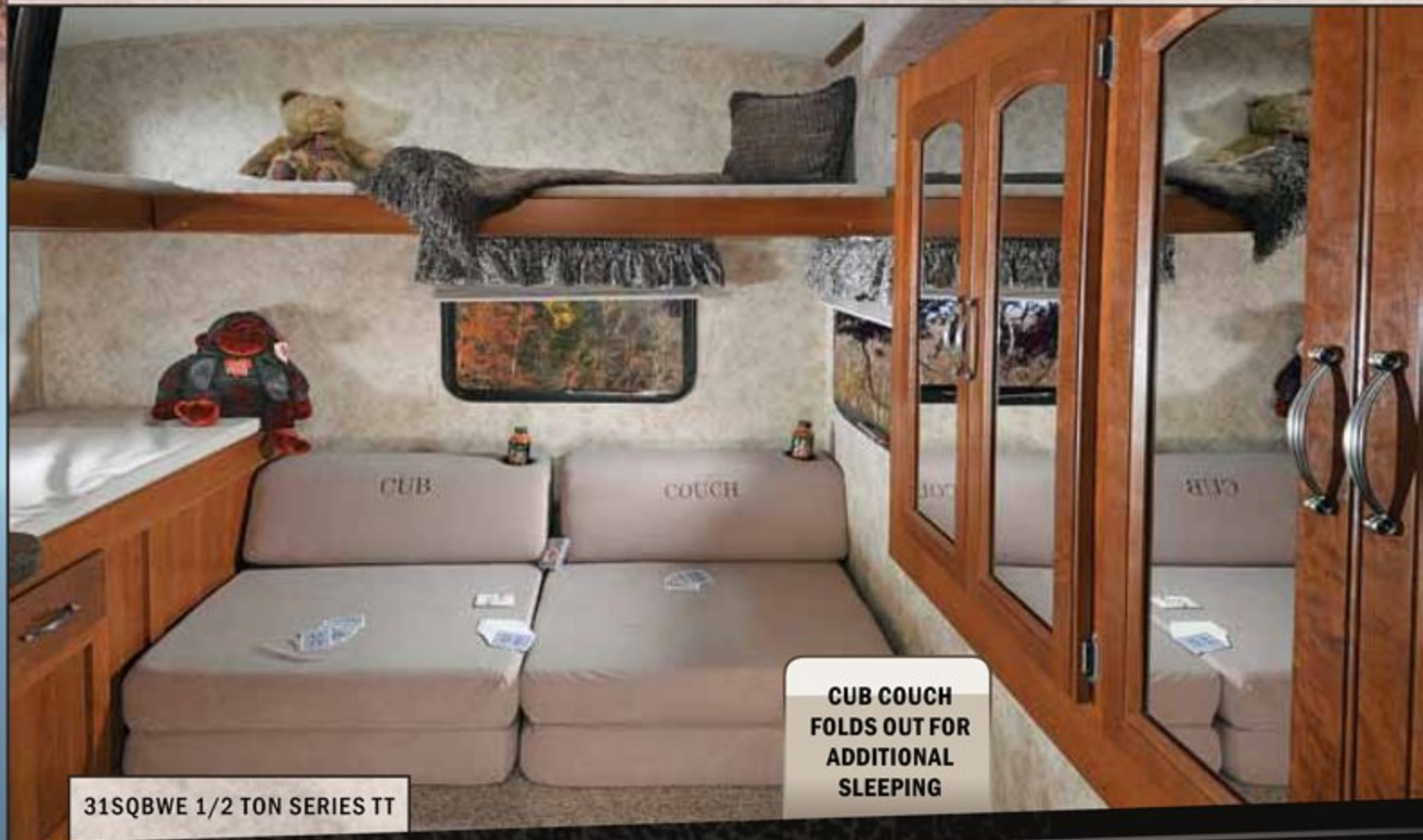
31SQBWE 1/2 TON SERIES TT

PICTURED RIGHT: The Cougar 1/2 Ton Series 31SQBWE travel trailer in silver sage decor features a spacious rear bunk area for the kids as well as a large main living area showcasing a swivel LCD TV, extra large windows, u-shaped dinette with multi-functional pop-up dinette table and true cherry wood cabinet doors and drawers.