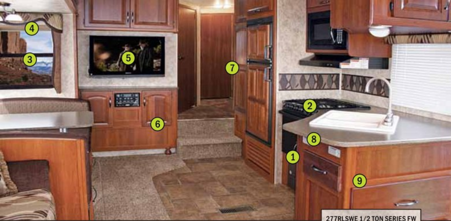
277RLSWE 1/2 TON SERIES FW