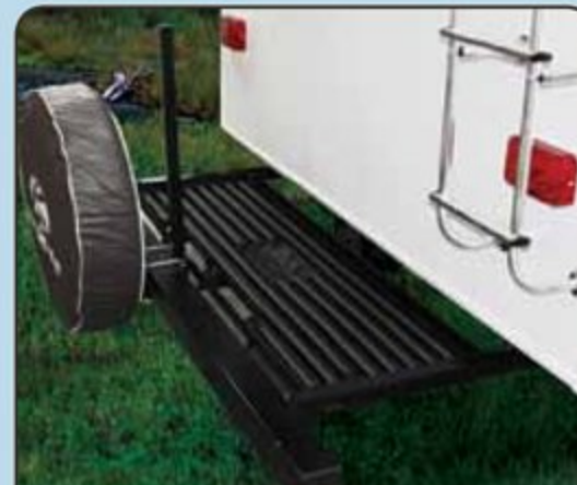
BIKE/STORAGE RACK & HARDWOOD CHERRY CABINET DOORS

Cougar has strategically produced travel trailers and fifth wheels out west in Oregon, which means high quality 1/2 Ton Series are built specifically for west coast customers by west coast production workers.