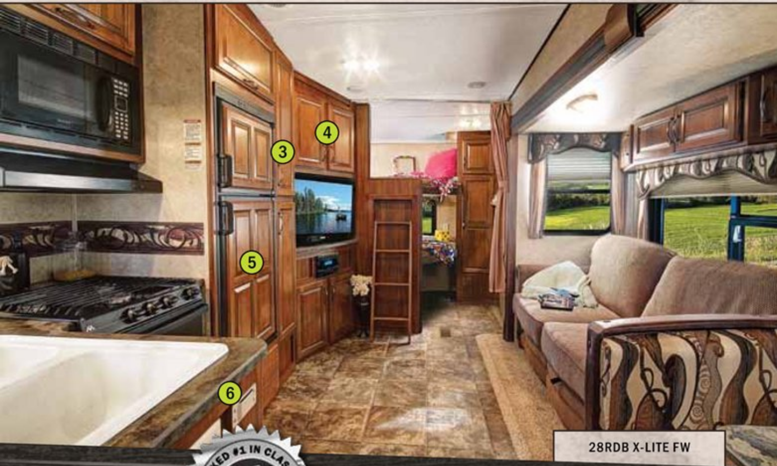
28RDB X-LITE FW