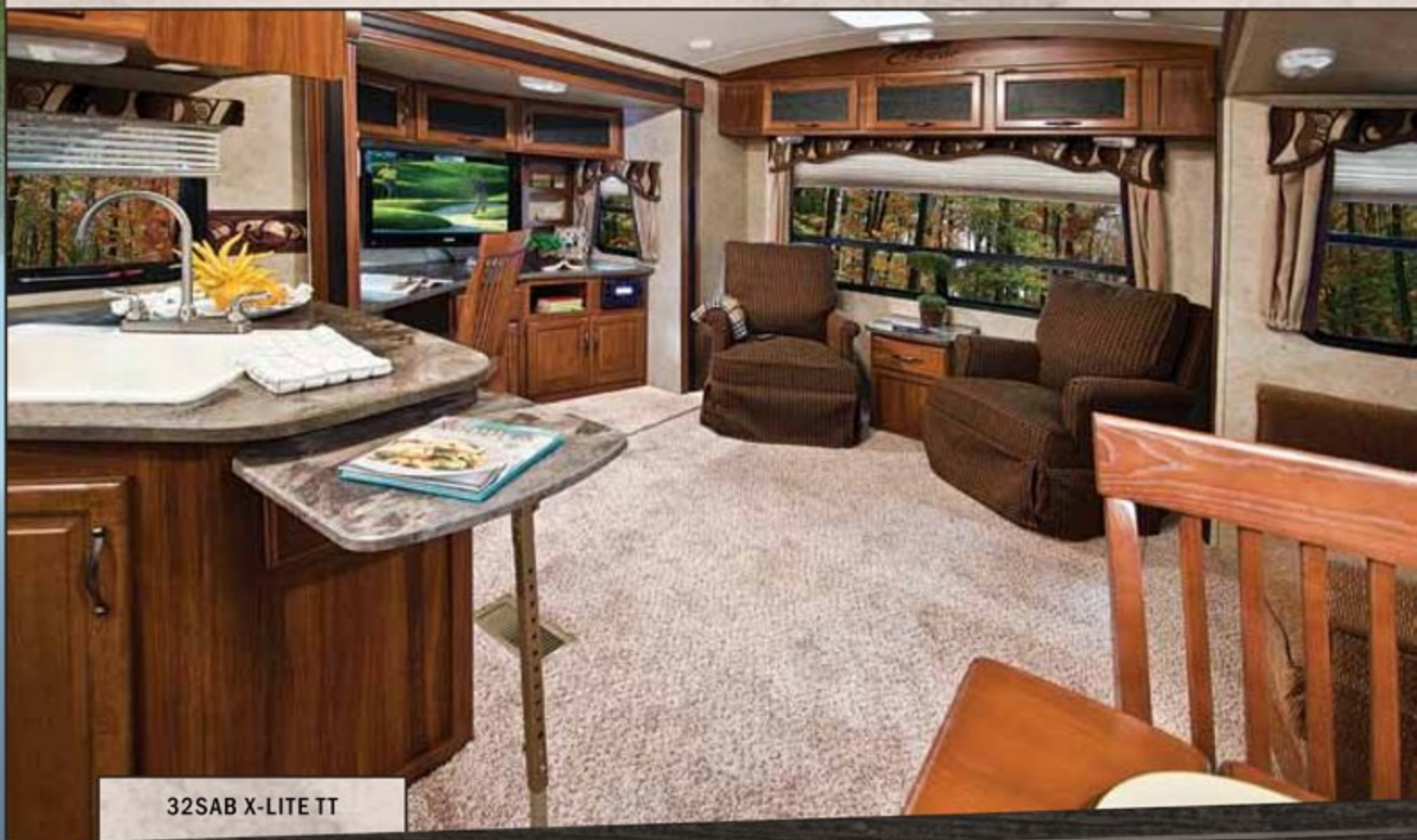
32SAB X-LITE TT