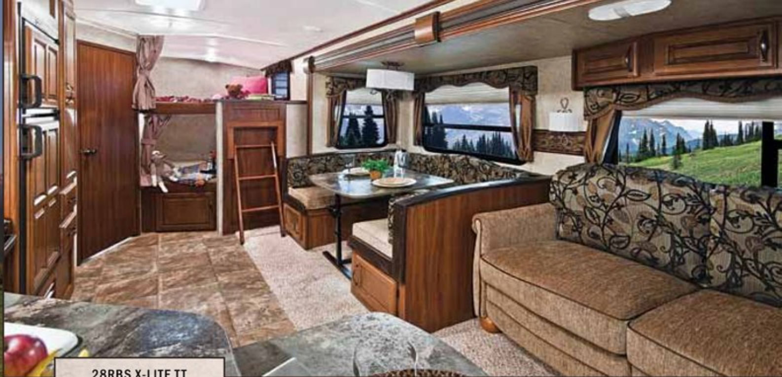
28RBS X-LITE TT