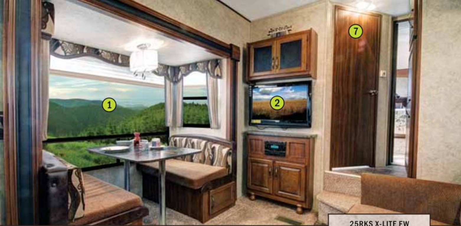
25RKS X-LITE FW