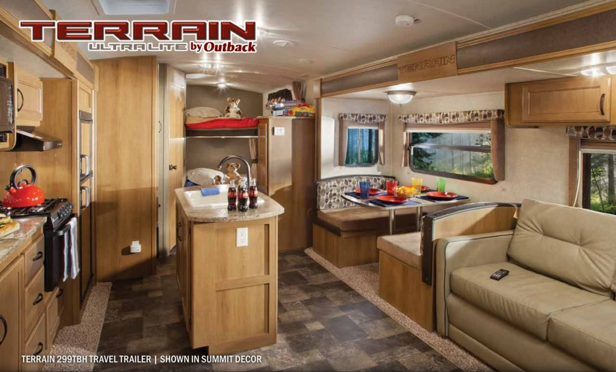
TERRAIN 299TBH TRAVEL TRAILER | SHOWN IN SUMMIT DECOR