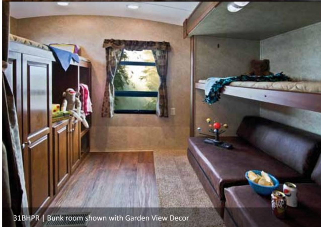
31BHPR | Bunk room shown with Garden View Decor