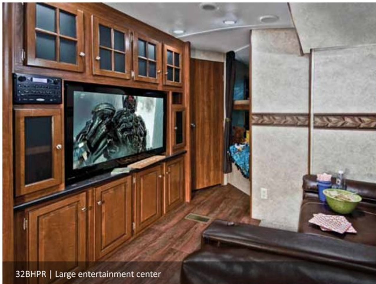
32BHPR | Large entertainment center