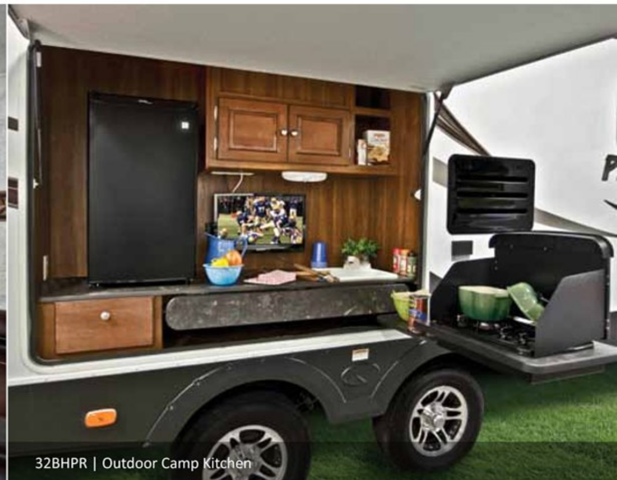
32BHPR | Outdoor Camp Kitchen