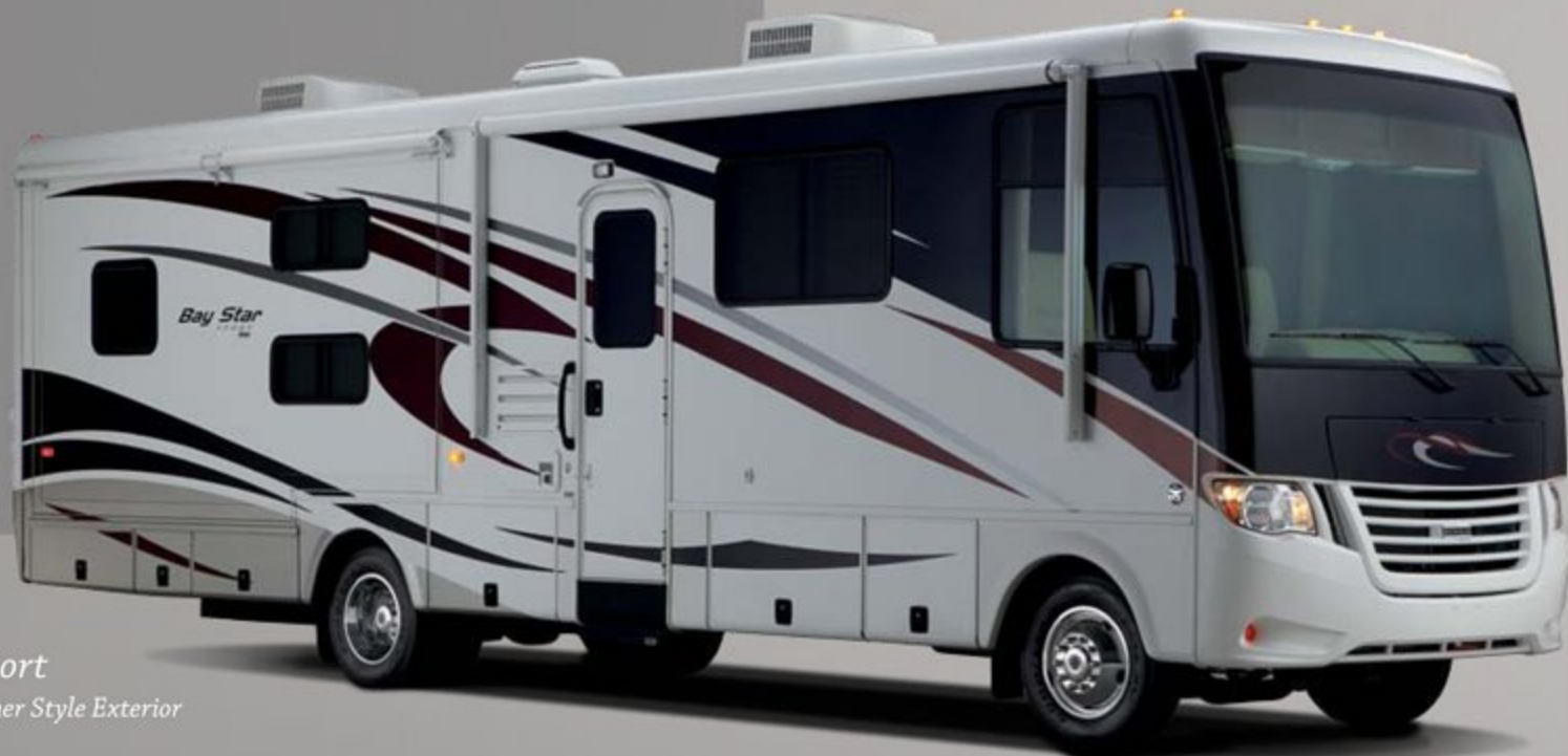
Bay Star Sport Sherwood Designer Style Exterior