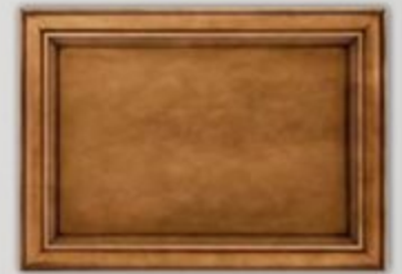
SIENNA MAPLE WITH DESIGNER MITERED, GLAZED DOORS