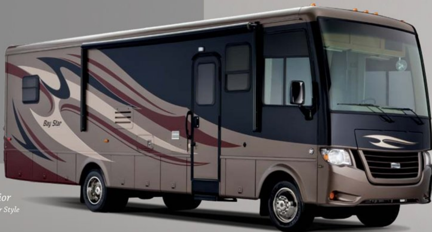
Bay Star Exterior Aztec Bronze Designer Style