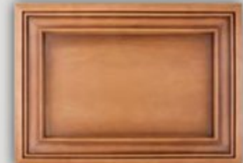
SIENNA GLAZED MAPLE WITH DESIGNER MITERED DOORS