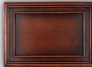
EMPIRE GLAZED MAPLE WITH DESIGNER MITERED DOORS