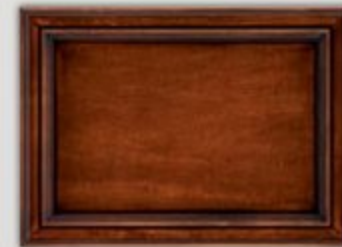
EMPIRE MAPLE WITH DESIGNER MITERED, GLAZED DOORS