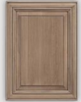
RATTAN GLAZED MAPLE