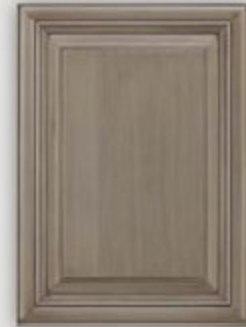
AMARETTO GLAZED MAPLE