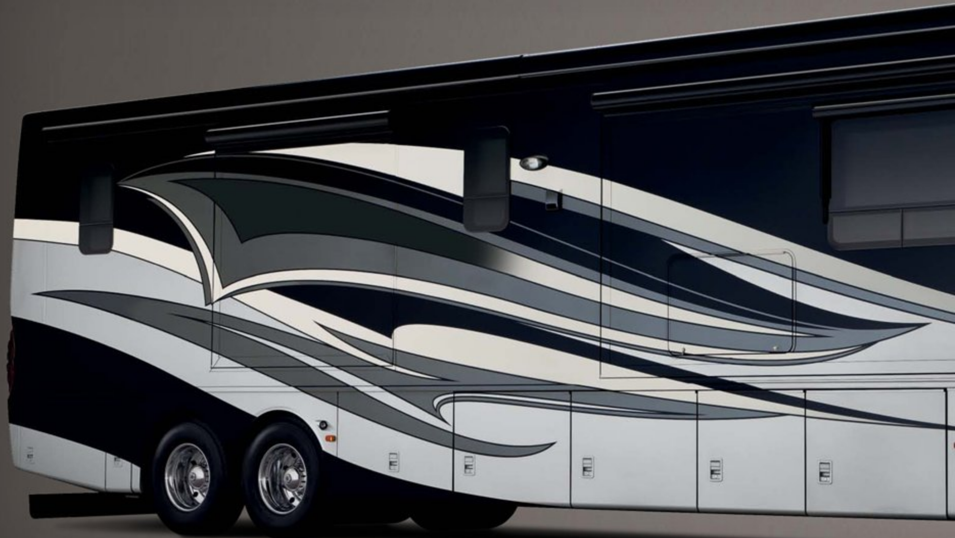
Essex Exterior Fleming Designer Style