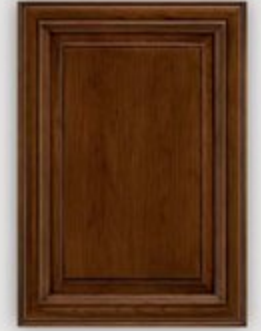
GINGER GLAZED CHERRY HIGH GLOSS