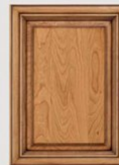
CARMEL GLAZED CHERRY