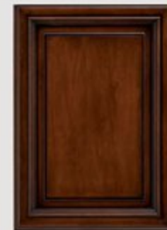
MANHATTAN GLAZED MAPLE