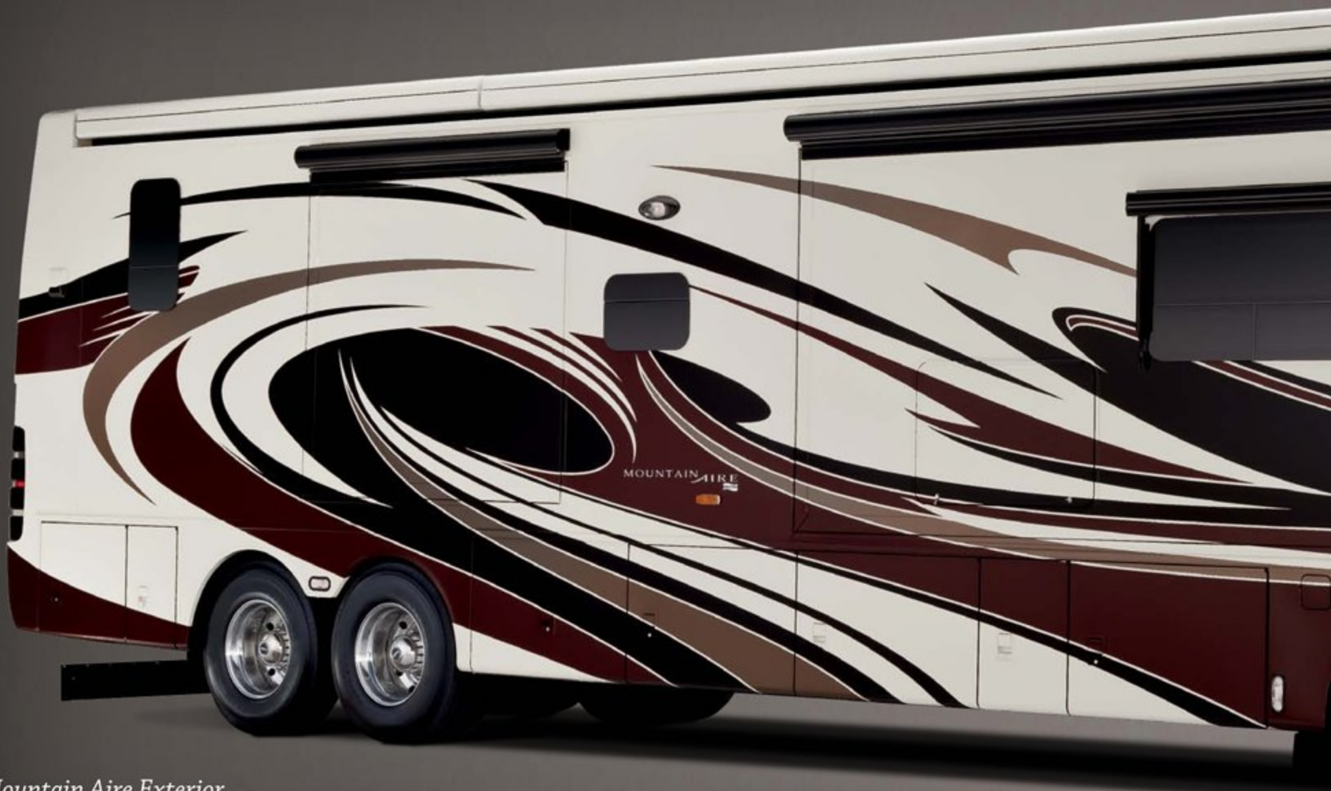
Mountain Aire Exterior Augusta Designer Style