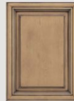
WICKER GLAZED MAPLE