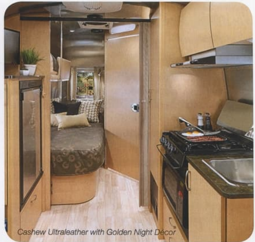
Cashew Ultraleather with Golden Night Décor