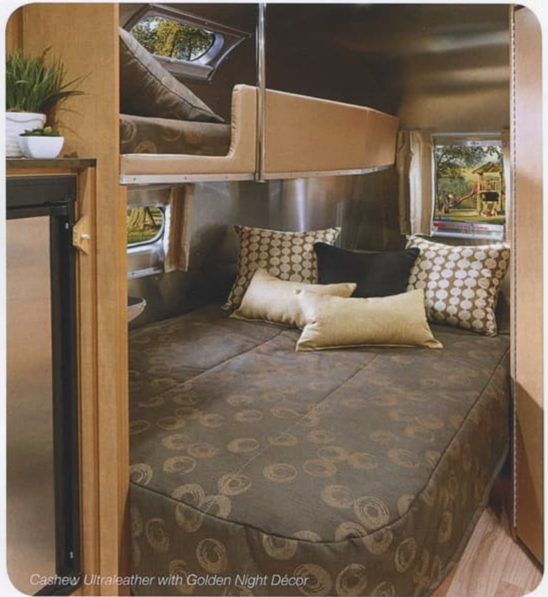
Cashew Ultraleather with Golden Night Décor

The popular Flying Cloud bunk option is now available on the Flying Cloud 19!