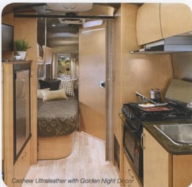
Cashew Ultraleather with Golden Night Decor