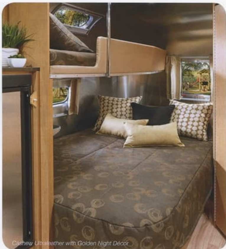
Cashew Ultra leather with Golden Night Décor

The popular Flying Cloud bunk option is now available on the Flying Cloud 19!